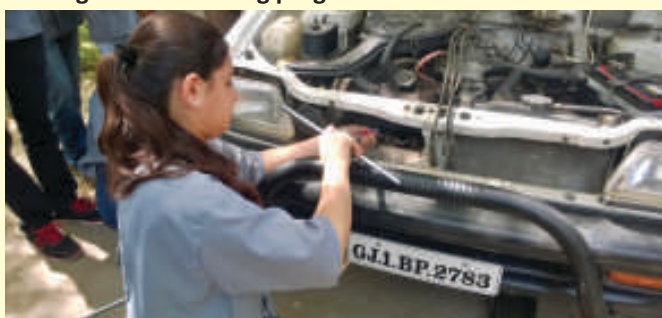
Skill Based Course on Automobiles Servicing on March 3, 2014