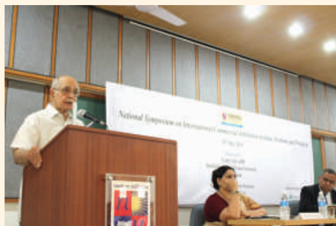
A glimpse of the National Symposium at IL-NU