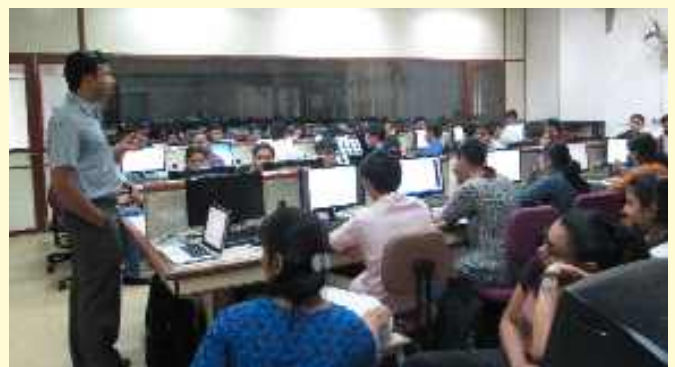
Android Programming at IDS-NU during June 30 to July 4, 2014