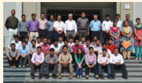
Farewell of M. Tech students, IT-NU