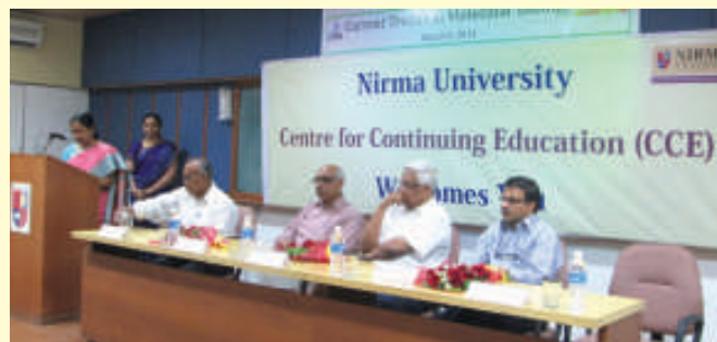
One Day Lecture Series on 'Current Trends in Molecular Biology Programme' on March 8, 2014 at IS-NU