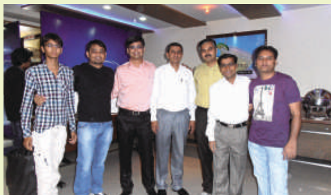
Glimpses of Annual Get Together of NU