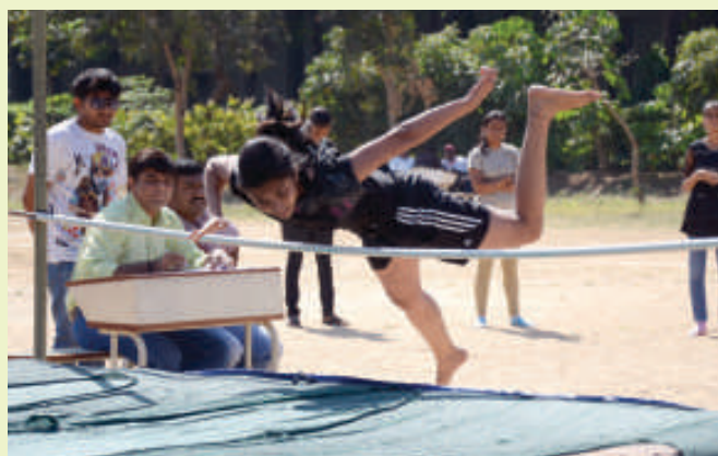
Students competing in the competitions during Annual Sports Day Celebration at NU