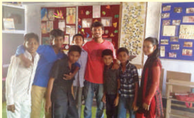
Students of IT-NU and children during Koshish, the Social Initiative

As a part of their social initiative 'Ek Ummeed', Rotaract Club of Nirma Institutes, IT-NU, in association with Prathma Blood Group, organized a blood donation drive at Nirma University during March 28-29, 2014 in which 254 blood units were collected.