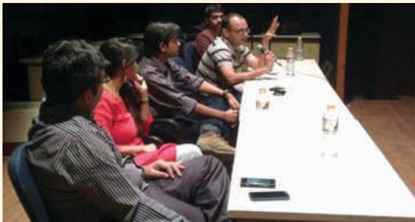
Panel Discussion on 'Success Decoded' by RCNI at IT-NU

Rotaract Club of Nirma Institute (RCNI) along with Success Decoded organized a panel discussion confluence with successful young executives on March 20, 2014. The Programme aimed at familiarizing the students about the recruitment process and how to face interviews. RCNI, IT-NU also conducted KenQuest'14, an inter-institute quizzing event for the first year students of the University. The aim of the event was to encourage and recognize the fresh lot of quizzers.