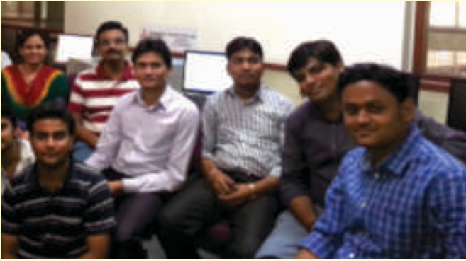
Workshop on 'Virtual Instrumentation and Its Application' on April 12-13, 2014 at IT-NU