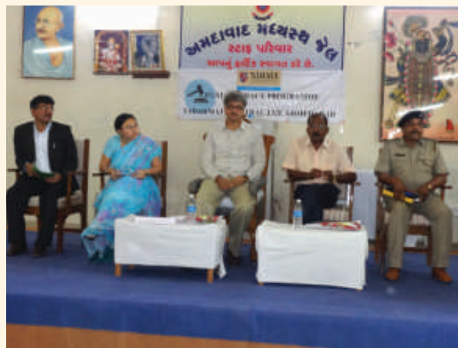
A glimpse of the Legal Awareness Programme at Sabarmati Central Jail, Ahmedabad