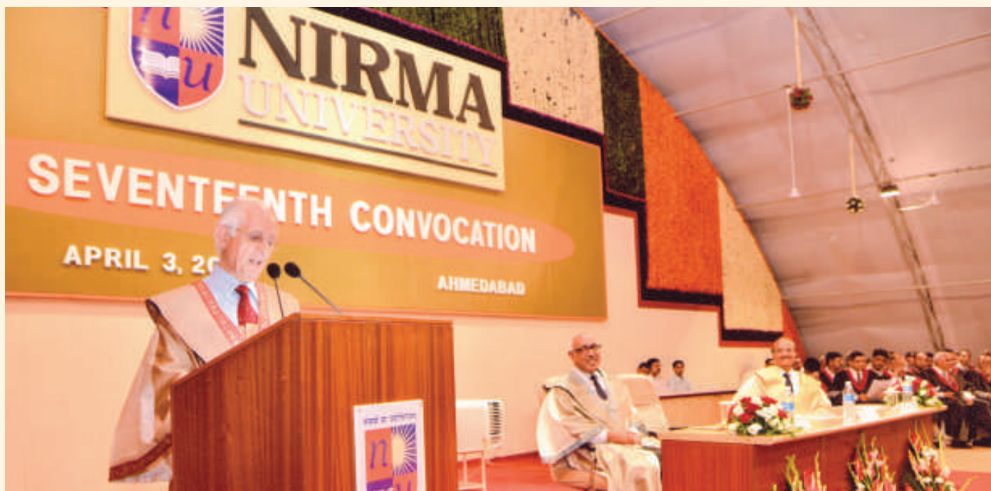
Mr. Arun Maira, Chief Guest for the Convocation, addressing the gathering at NU

Addressing the students, Chief Guest Mr. Arun Maira stated that Quality is the pursuit of excellence in whatever we do. He further commented that the time has come for us to set our sights much higher than we have so far and we must make our nation a Quality Nation in which citizens will experience quality in their daily lives. He further added that there is a widespread need in India to convert Confusion into Coordination, Contention into Collaboration, and Intention into Implementation.