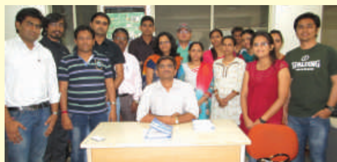
F.D.P. on 'Performance Analysis of MIMO Wireless Communication Systems' on March 5-9, 2014 at IT-NU