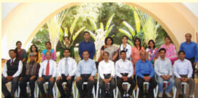
Case Teaching Workshop for Management Teachers during March 21-22, 2014 at IM-NU