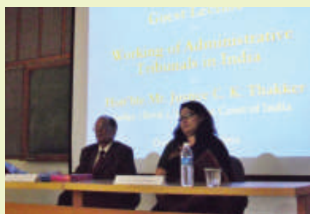
Hon'ble Justice C. K. Thakkar at IL-NU