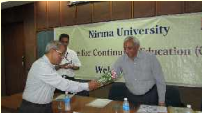
Engineering Graphics- A Language of Engineer during May 27-29, 2014