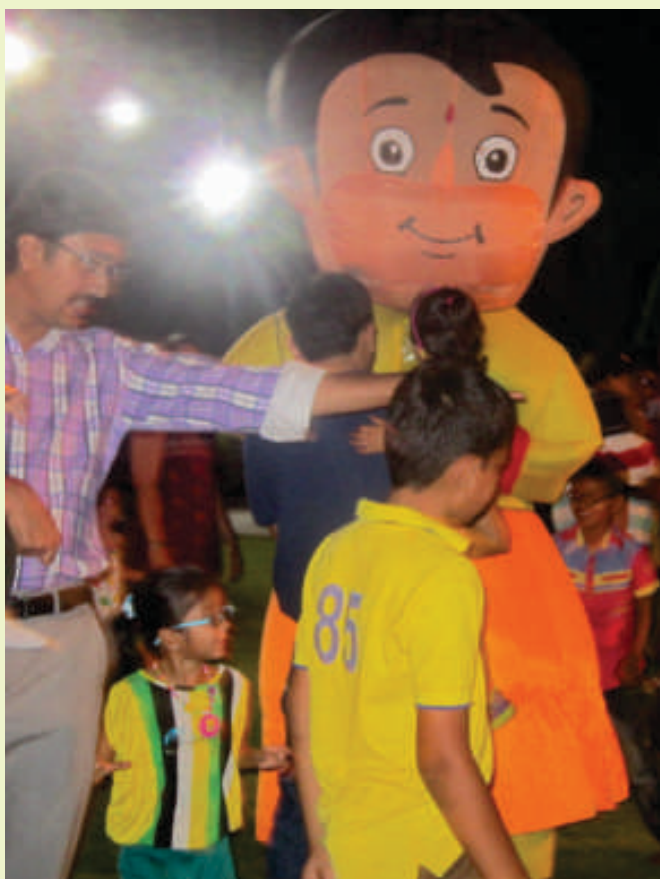
Faculty members and their children enjoying themselves during the get-together of IT-NU

The Annual Get-Together of all faculty and staff members of IT-NU was organized in the Nirma Campus on March 29, 2014.