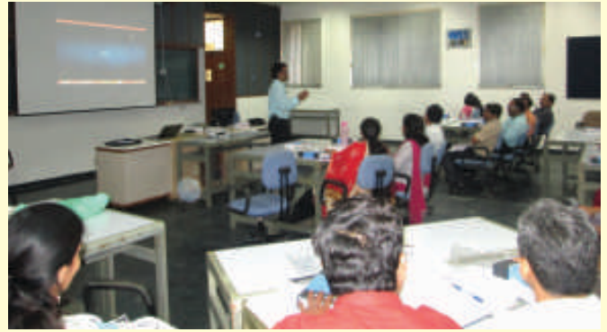
My Pledge-Self Leadership Programme during May 15-16, 2014 at IDS-NU