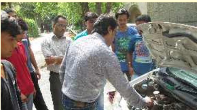
Skill Based Course on 'Automotive Servicing' during June 23 to July 05, 2014