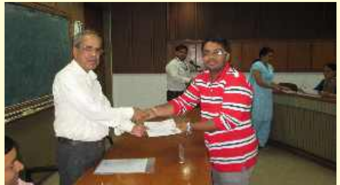
Engineering Mathematics- A Tool for Engineers during June 3-7, 2014