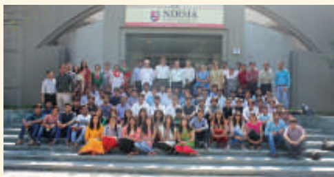
Farewell of B. Tech students, IT-NU

The farewell functions for the students of B. Tech and M.Tech students for various branches of IT-NU were organized in the months of April and May, 2014. IDS-NU organized the farewell function for the outgoing batch on May 10, 2014.