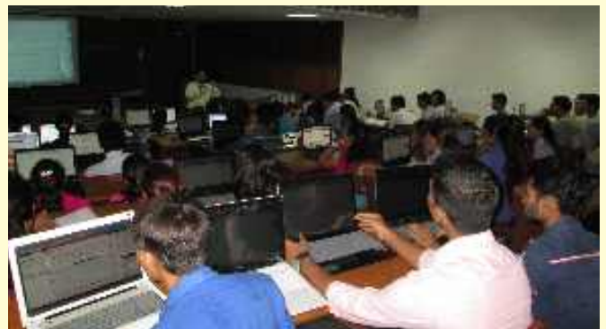
Web Designing using Visual Studio 2010 during June 25-27, 2014