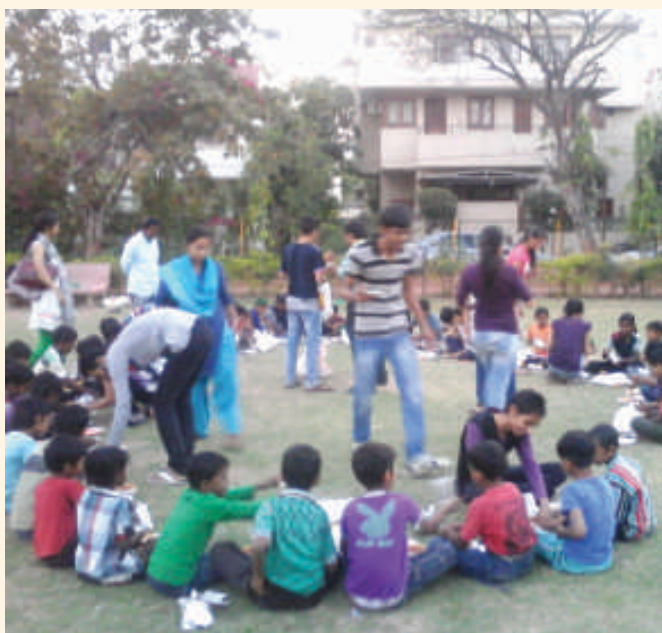
Faculty members and students of IDS-NU at NGO-SWASH

IDS-NU organised a Literacy Campaign to teach the underprivileged children at SWASH, an NGO in Ahmedabad on March 8, 2014.