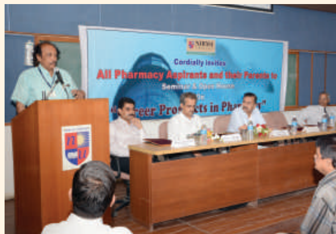
A glimpse of the Career Counselling Seminar at IP-NU