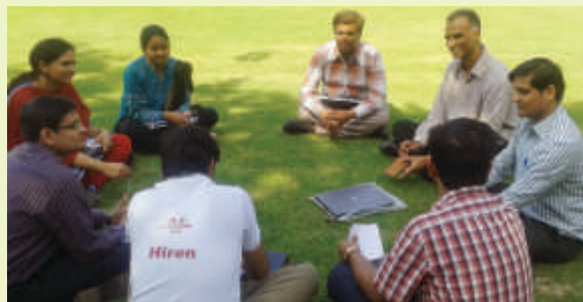
Faculty of IT-NU during the workshop conducted by ADR Cell