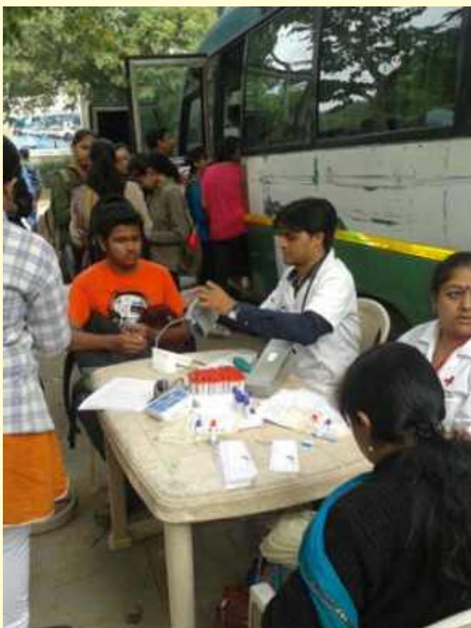
Blood Donation Camp by RCNI at IT-NU