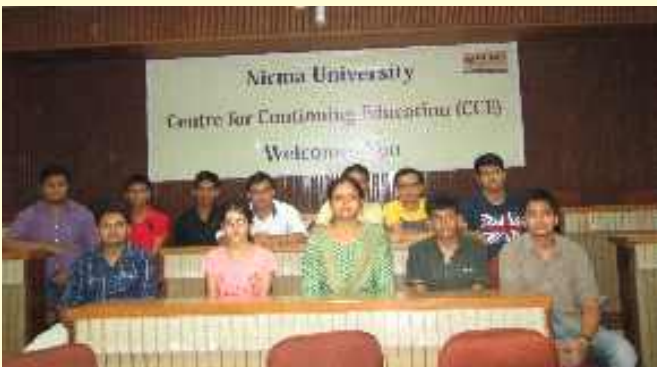
Mechanics of Solids during June 10-12, 2014