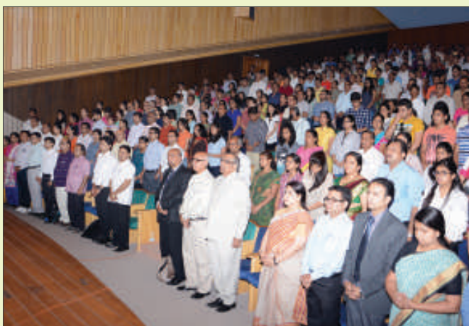
Parents, teachers and students praying for a good start during the Orientation Programme at IL-NU