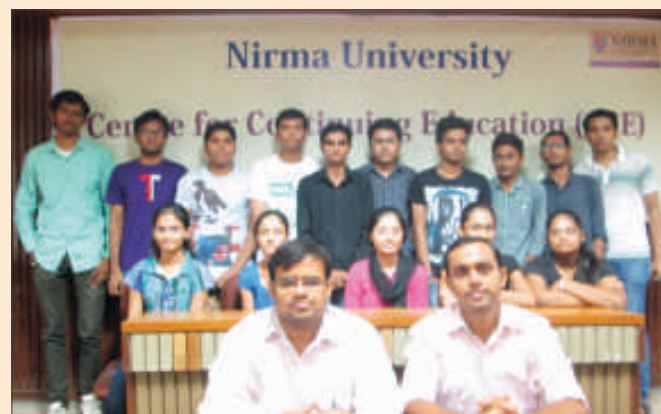
'Web Designing using ASP.NET' during August 6-8, 2014