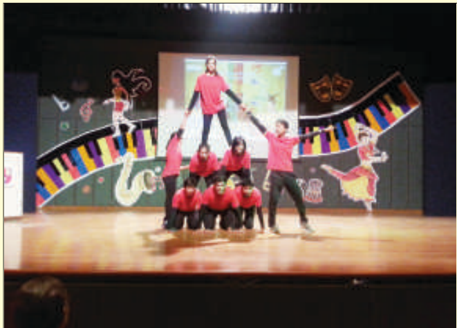
Participants during the Talent Night at IM-NU

IM-NU organised the Talent Night which is among the annual events organised by the institute. This year Antarang-2014 - the talent night was held on July 26, 2014 based on the theme, 'Let us paint the town red'. The event provided a platform for the Freshers to portray their talents in Western, contemporary and classical dances and duet / solo songs.