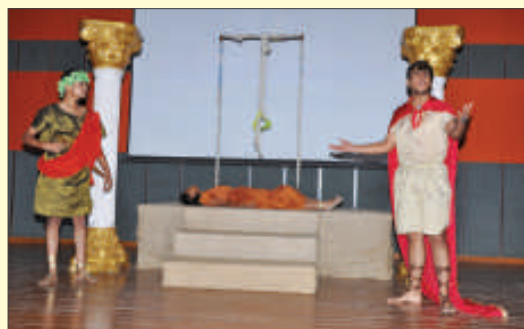
A scene from the play 'Antigone' at IL-NU

The students of IL-NU presented a unique combination of literature and law in a form of play named 'Antigone' a play by the revered Greek playwright Sophocles. The play portrayed the true nature of a man and implores to adopt ethical principles that will make us socially responsible lawyers and also bring essence of humanity.