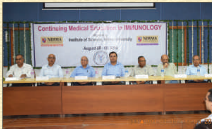
Continuing Medical Education Programme on Immunology Page 18