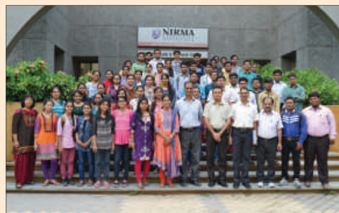
'Microwave and RF Circuit Design' at IT-NU during August 30-31, 2014