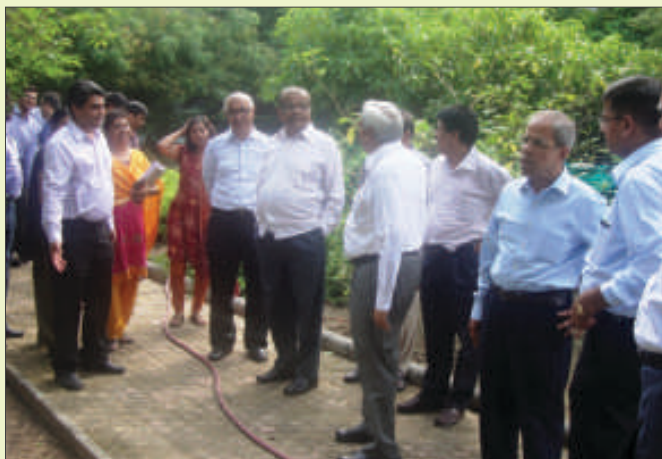
Seen in the photograph are the Senior Officers of the University, Heads of the Institutions along with the faculty and students during the Plantation Drive at IP-NU