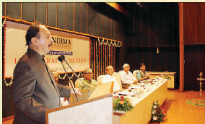
Institute of Architecture Inaugurated Page 3

This is to certify that Nirma University, Ahmedabad, Gujarat is registered with the Department of Scientific and Industrial Research (DSIR) for purposes of availing customs duty exemption in terms of Government Notifications No. 81/90-Customs dated 23 rd July, 1990 & No. 24/2007-Customs dated 1 st March, 2007 and Central Excise duty exemption in terms of Government Notifications No. 10/97-Central Excise dated 1 st March, 1997 & No. 18/2007-Central Excise dated 1 st March, 2007 as amended from time to time. The Registration is subject to terms and conditions mentioned overleaf.