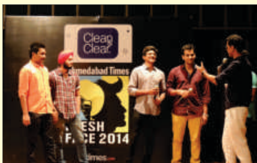
Fresh Face Talent Hunt by Times Group and RCNI, IT-NU