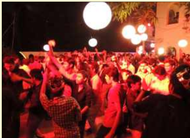
Students thoroughly enjoying the Freshers' party by RCNI, IT-NU