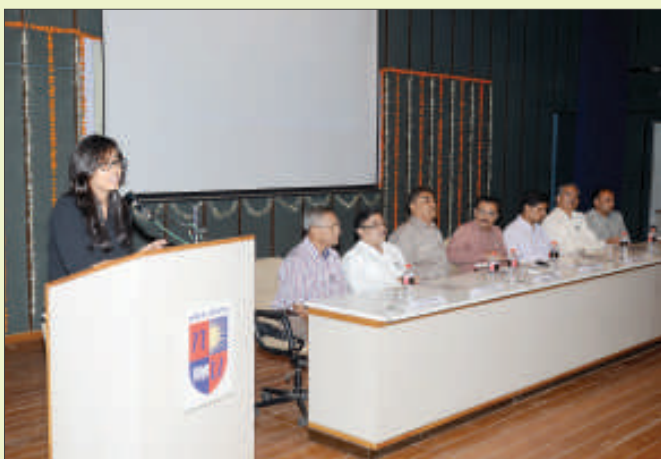
A Glimpse of the Orientation Programme at IT-NU

IT-NU organized a two-week Orientation Programme for M.Tech first year students during July 14-25, 2014. The Institute also organized Orientation Programmes for B.Tech first year students from July 1 to 7, 2014 and for MCA first year students from August 4 to 6, 2014.