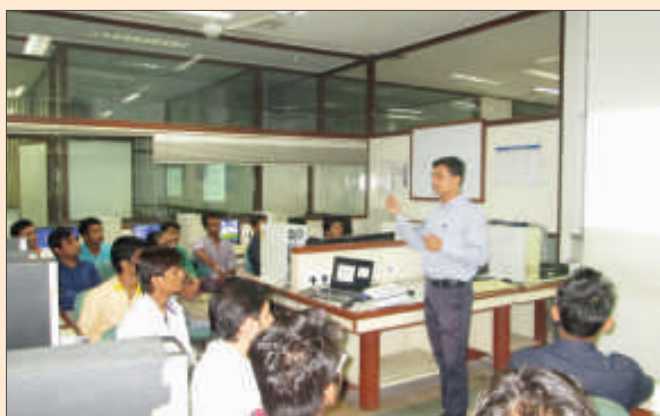
Four- Day Workshop on 'Simulation Software for Chemical Engineering Applications' at IT-NU during August 23-24 and 30-31, 2014