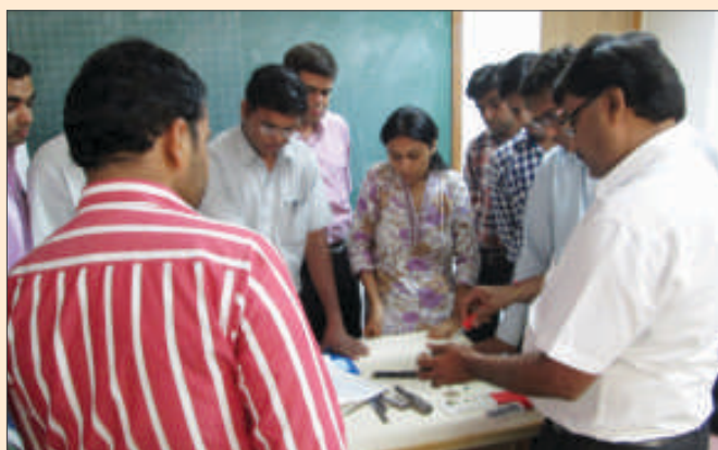
'CNC Technology and Programming' at IDS during July 2-4, 2014

The other programmes organized by/under CCE were: