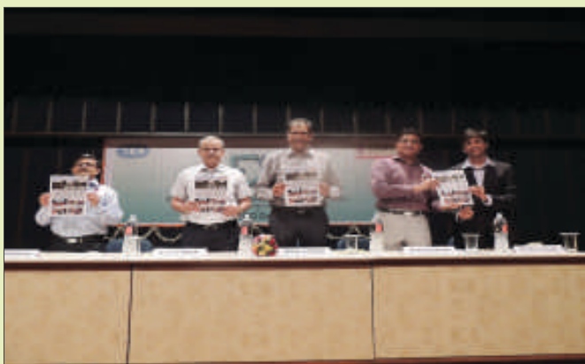
Release of Magazine during the celebration of ECO day at IT-NU

Electronics and Communication Student Organization (ECO), IT-NU, celebrated the ECO day on August 21, 2014. Various activities like Project Presentation, Expert Talks, Alumni Interaction etc. were organized.