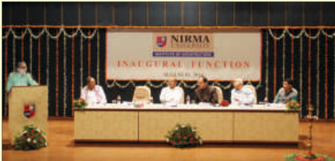
Dr B. V. Doshi, Chief Guest of the Inauguration of IA-NU, addressing the gathering