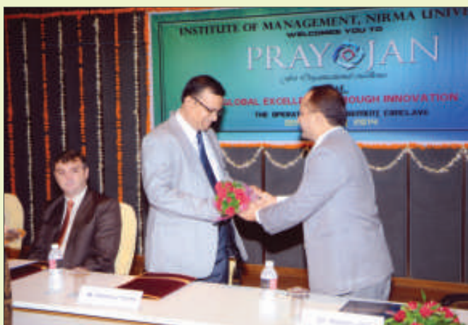
A glimpse of Prayojan-The Operations Management Conclave at IM-NU