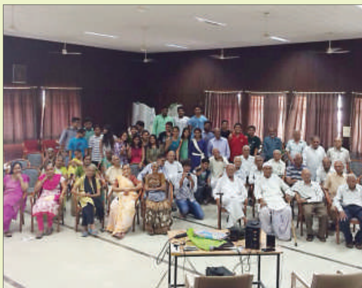
A Glimpse of the visit of the students and staff of IT-NU to the Old Age Home

IT-NU organised a visit to Hiramani 'Sandhya Jeevan Kutir' an old age home on July 13, 2014. The elderly people as well as the volunteers shared their thoughts and ideologies. Volunteers later showed their talents through performances in order to entertain the enthusiastic audience. Games were played by the participants, while the audience cheered for them while savouring snacks. Winners of the games were presented with a memento and small gifts were given to all the elderly as a gesture of respect.