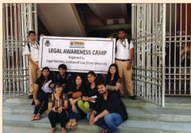
IL-NU students at a school for the workshop

The Workshops were organised by the students of IL-NU at various places in the vicinity of Ahmedabad as Ganpath University on Gender Equality and Constitutional Rights; C.N Vidhalaya on Eve Teasing; Nirman High School on Child Rights' Adarsh High School on Child Abuse and Child Rights and K.H. Kapadia School on Sexual Harassment at Workplace during August 9-28, 2014. These workshops were a part of the Legal Awareness Camp.