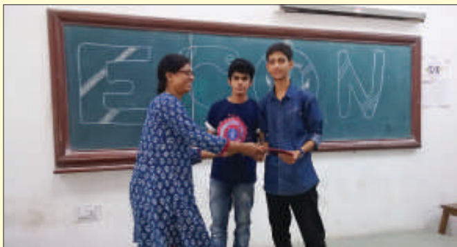
Participants in ECON Event receiving prize

Quiz, Extempore and Talent Show were organised by Electronics and Communication Organisation for Nirma (ECON), IDS-NU on July 26, 2014.