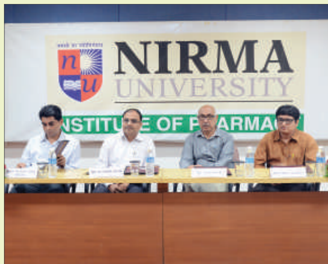
Dignitaries on the dais during the M.Pharm Orientation Programme at IP-NU