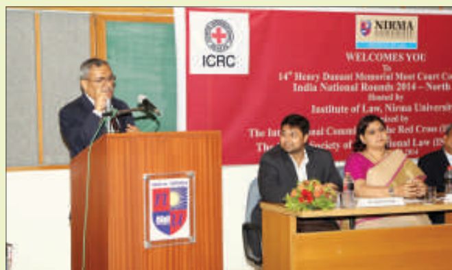
Fourteenth Henry Dunant Memorial Moot Court Competition at IL-NU