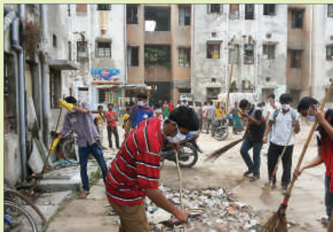
Students of IT-NU during the Cleanliness Drive at 'Gokud Avsan' area of Jodhpur ward

A Blood Donation Camp was organized in association with Prathma Blood Center, Ahmedabad during August 27-28, 2014. Total 305 unit of blood was collected. The Camp was co-ordinated by Rotaract Club of Nirma Institutes.