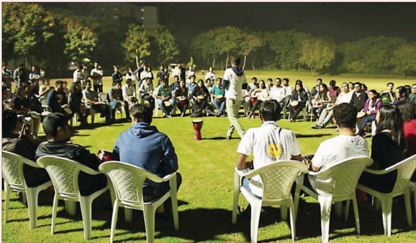
Students participating in the Drum Circle

In order to create awareness for World AIDS Day, The Cultural Committee of IM-NU organized a "Drum Circle", in association with Taal Inc. More than a hundred students participated and played together on December 1, 2016. It was a prelude to Perspective Richter 10.