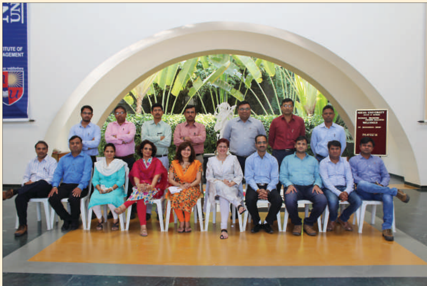
MDP-Effective Communications for Higher Performance for Managers from Reliance, Gujarat Gas and Modern Insulator during October 18-20, 2016.