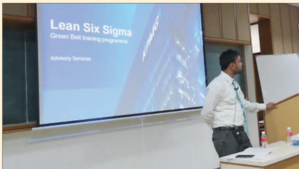
Six-Sigma Green Belt Certification Programme

Optimus-the Operations club of IM-NU in association with KPMG organized a four-day certification programme on Six-Sigma Green Belt for the second year MBA (FT) students. The programme was scheduled on August 13-14, 2016 and 21-22, August 2016.