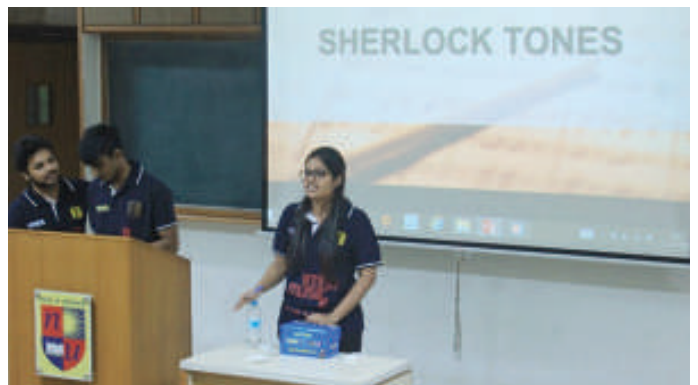
Participants at Sherlock Tones

Club Fiesta- the Music and Dance Club of IM-NU took the excitement level at a high with the event Sherlock Tones organised on the October 21, 2016. The first round of the event saw participants flexing their memory muscles to remember songs from various Bollywood films. The second round was a slightly tuned version of the famous Dumb Charades game. After an interesting tie between 3 teams, the final four proceeded to the next and final round. The event lived up to its name in the final round where the last four teams were to go through a treasure hunt. The team 'Sax Bombs' were declared winners of the competition.