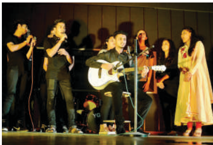
Nirvana—the Talent Show for BBA and B.Com. Students

Abhivyakti - BBA Cultural Committee organised the Talent show on August 27, 2016 for the Batch of 2016-21 (First Year) of BBA-MBA Programme and Batch of 2016-19 of the B.Com. (Hons.) Programme in association with Spinshot - the Photography Club, Thespians - the Dramatics Club and Ritayan - the Dance and Music Club of BBA-MBA Programme. The first year performers were given a platform to showcase their talents and there were in all 20 performances consisting of dancing, music and drama. The performances were in English, Hindi and in regional languages like Gujarati and Punjabi. The audience also had a good time cheering for their fellow classmates and friends. B.Com. Students participated in Group dance and Group singing and performed extra-ordinarily.