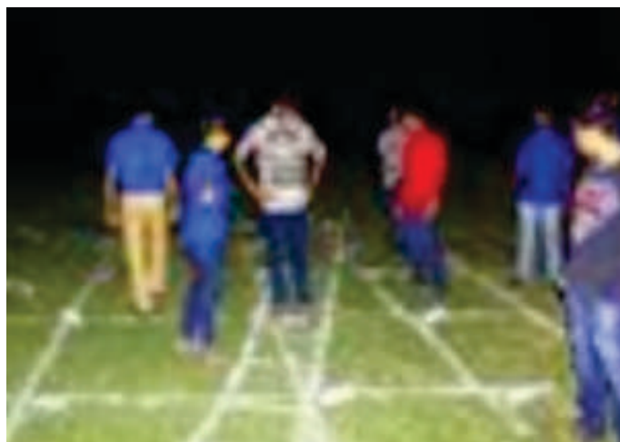
Games at Finanza 2016

On August 19, 2016 Finesse – the Finance Club of IM-NU organized Finanza. The event comprised of several games and quizzes. It help the MBA students to become aware of finance related concepts and brands through fun-filled activities.