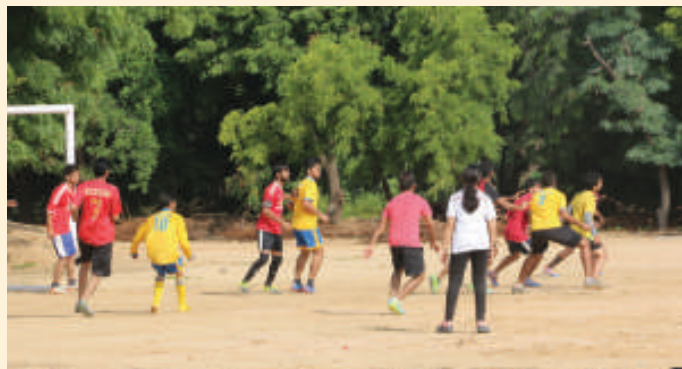
A Football Tournament

Khelnayak—the BBA Sports Committee on September 30, 2016. The purpose of the event was to decide which team of Football would play in the Nirma Cup i.e. BBA team or the MBA team. Also this was to indulge students in extra-curricular activities apart from studies. The event was a successful with great enthusiasm from students of both BBA and MBA