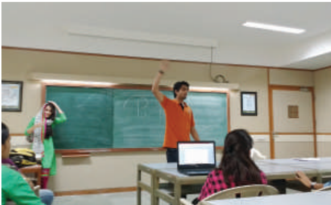
A performance during "Play the Play"

On September 7, 2016 Thespians, the newly formed Drama Club of BBA, organised its first event 'Play the Play'. The event witnessed several performances of skits, mono acts and story-telling by the talented students from all the three years. Not only this, but the range of emotions expressed in the acts from love to betrayal to comedy to tragedy to wisdom were indeed fascinating and worth appreciating.