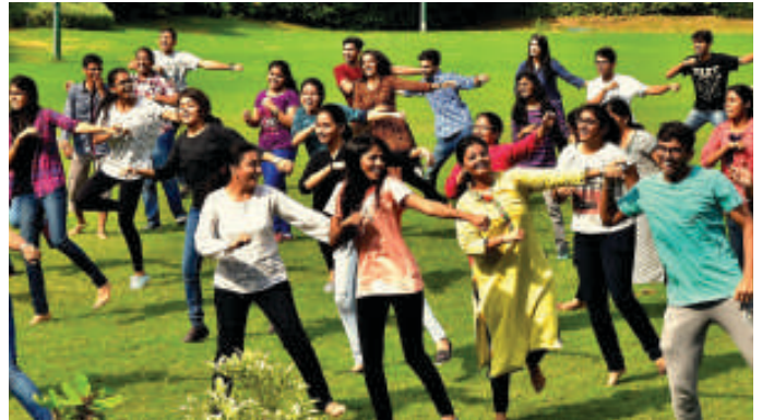
Participants at 'Energia'