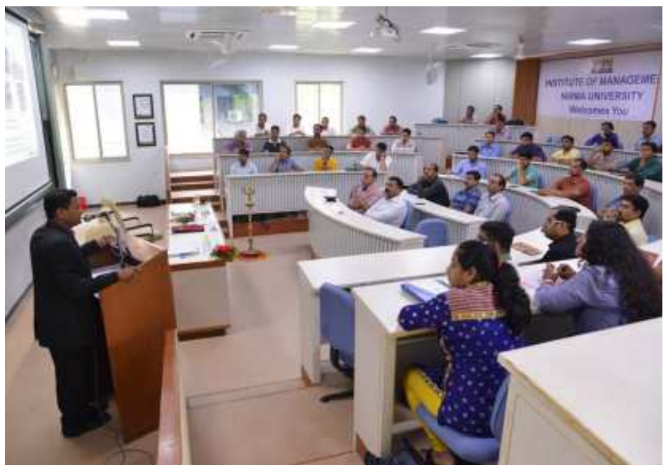
Executive Diploma Programme Batch 2016-17 Inauguration Function