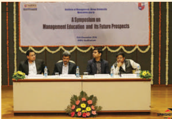
Delegates at the Symposium -Management Education and its Future Prospects