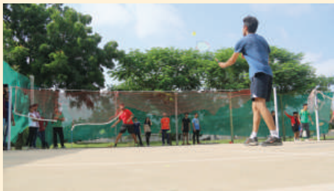
A match during the Badminton tournament

On September 21 and 23, 2016 a Badminton tournament was organized by the Sports Committee (BBA-MBA) of IM-NU. The purpose of the event was to engage students in extra - curricular activities and to provide them with a balance of academics and sports. A total of 44 students participated in this event, including 36 boys and 8 girls. Each match consisted of one set of eleven points.