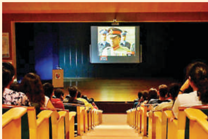
Kargil Vijay Divas Celebration

On July 28, 2016, The students of the social group of BBA - The Mavericks, celebrated Kargil Vijay Divas in memory of the martyrs of the Kargil war. The event comprised of a screening of a short documentary followed by a brief presentation by a student whose father was a survivor of the Kargil war. The students of the BBA Programme gained insights into the war scene and the significance of the Indian army. The group left with enlightenment, pride and respect for the martyrs of Kargil war and the Indian army.