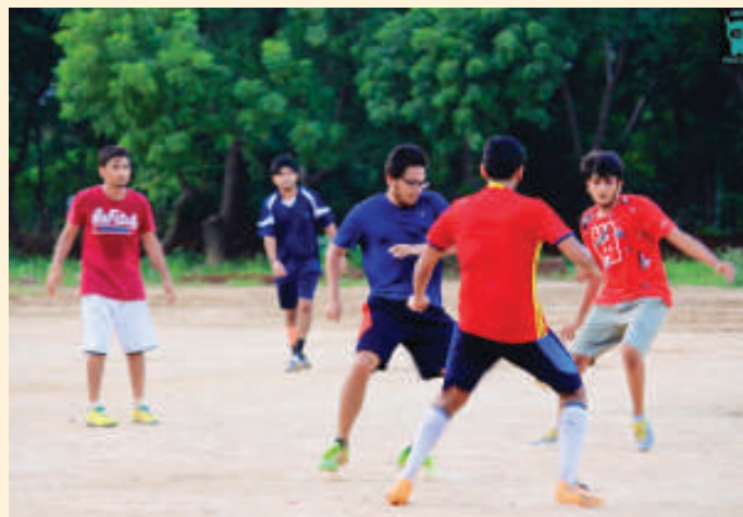
A Football Tournament of COPA

COPA, the Intra-Institute Football Tournament for MBA students of IM-NU, was organized by Sportzz Comm between September 2 and 5, 2016. Around 165 students participated in the event enthusiastically in a total of 10 matches. For the first time, girls were included in the teams. Team- Junior A were the winners and team- Junior B was the runner-up in the event. The tournament witnessed the most interesting matches where the players showcased their passion and aggression in the right sportsmanship.