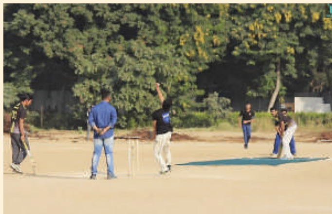
Match during Cric8

On November 14, 2016, a series of matches for two events "Cric8" and "Smashes" were organized. Smashes was a badminton event. The two-sport event was spread over three days. They generated enthusiastic participation and fierce competition.