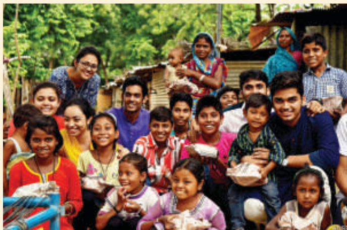
Food Drive by BBA Students

This August 15, 2016, on the 70th Independence Day, the Social Committee of BBA, Mavericks, conducted a food drive for some of the slum dwellers of the city. Following a monetary contribution of nearly Rs. 10,000, the food was packed in paper bags and distributed by 12 volunteers. They provided food to 150 underprivileged people from the slums located near Nirma University, Pakwan Crossroads and GMDC ground.