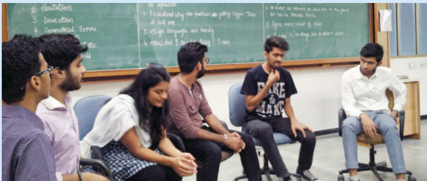
1 minute to spread it, 6 to discuss it

The Intra Institute BBA event by the Quiz and Debate Club was held in two phases. The first phase was the JAM (Just a Minute) phase held on September 2, 2016 where the participants, in 2 groups of 6, competed to speak on the given topic for a minute. The participants' feedback was extremely encouraging as they all enjoyed the event. Such sessions would definitely improve their speaking skills. The second phase comprised of a Group Discussion on September 7, 2016. The topics were "Pros and Cons of abolishing Income Tax" and "Should India immediately stop its foreign aid programmes?"