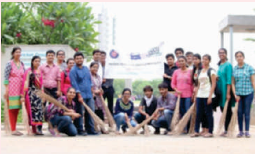
NSS – Swachh Bharat Abhiyan

The Samvaad session on "Female Foeticide" was followed by movie screening "Matrubhoomi" on December 20, 2016.