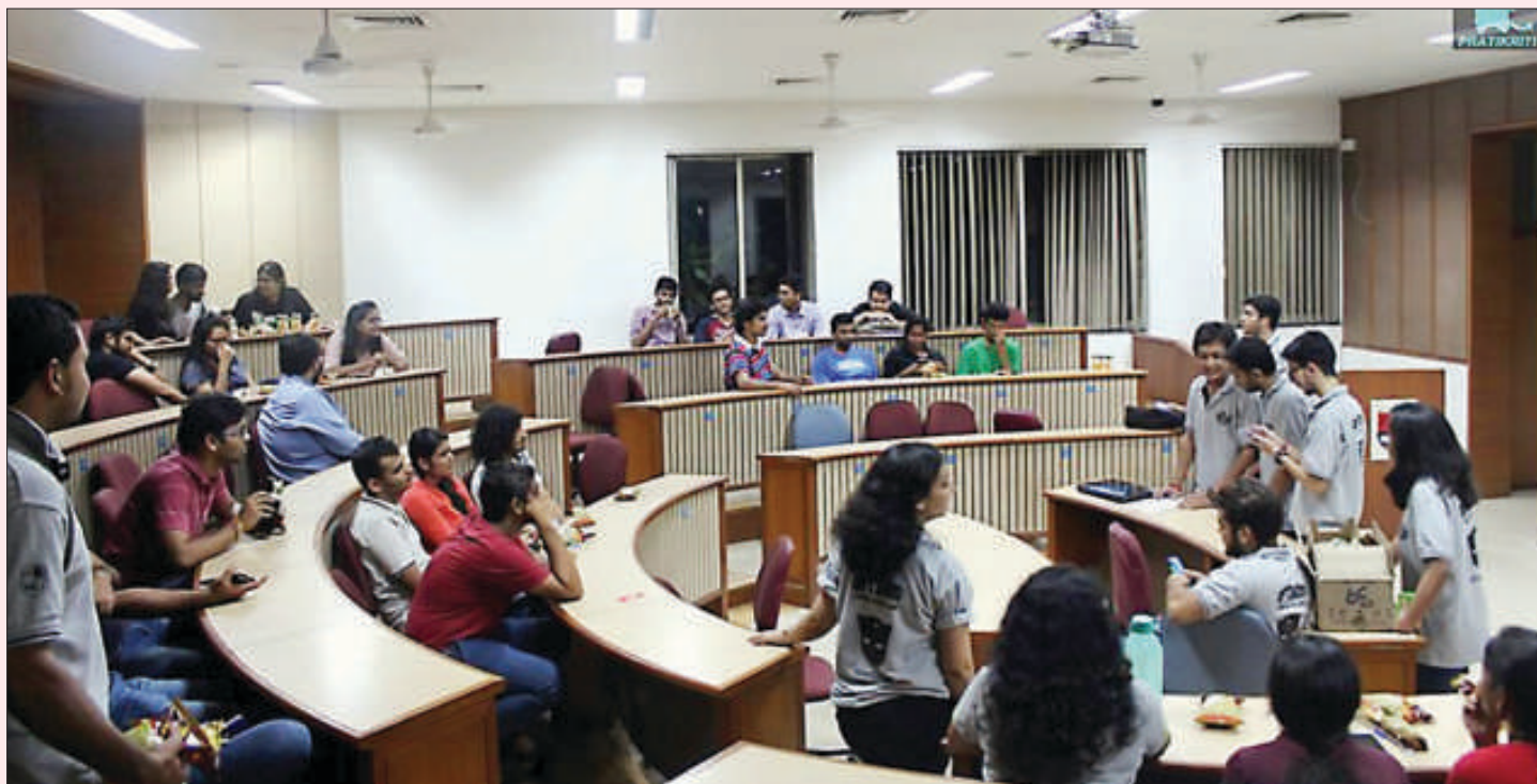
Break the Code 3.0

Optimus, the Operations Club conducted their first fun based event for the current academic year – “Break the Code 3.0” on August 22, 2016. The participants were required to identify the name of actors, name of TV series, flags, movies and famous personalities. The event was a huge success with a total of 180 entries of which 100 people took part in the event. The event consisted of 3 rounds.