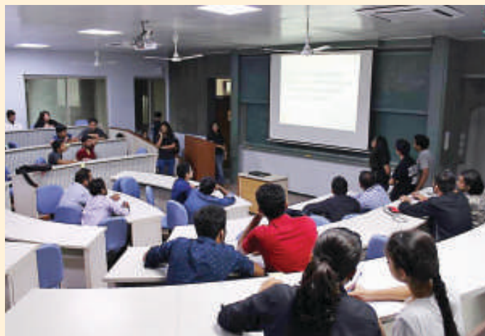
Participants in Biz-quiz

Biz-quiz (Business quiz) was the second annual event organized by the club XQuizIT- the Quiz Club of IM-NU on October 13, 2016. The event consisted of three rounds and rounds 1 and 2 were written questionnaire. It consisted of identifying logos, personality/company and general business question. Twenty-eight teams had participated in the event. Three teams were declared winners and prizes worth Rs. 6000 were distributed at the end of final round.