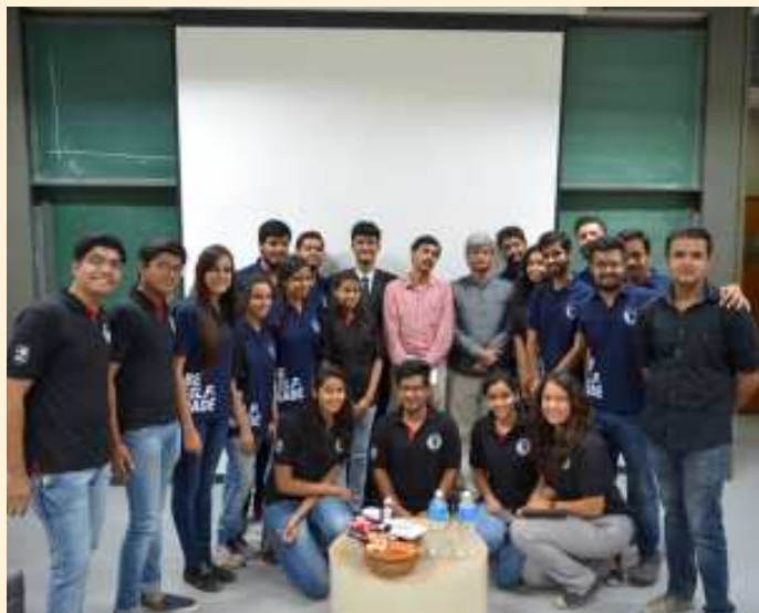
Participants at E-Insights