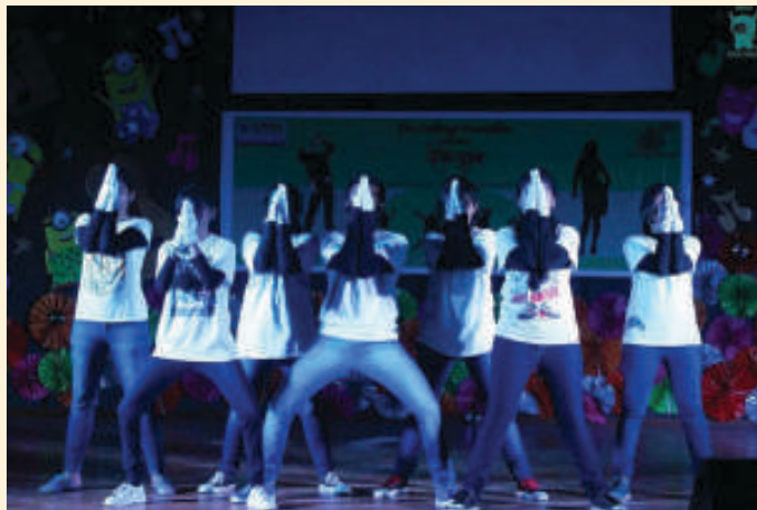
Participants at Apratim on July 23, 2016

The MBA Cultural Committee of IM-NU has organized Talent Night 2016-Apratim on July 23, 2016 for the MBA-FT 2016-18 batch. The purpose of this event was to provide a platform to the juniors to showcase their talent through music, dance, performances fashion shows, stand-up comedy and a skit. The event was overwhelming with enthusiastic performances of the talented children of Saral Foundation, Chehre - the Dramatics Club of IM-NU and Club Fiesta- the Music and Dance Club of IM-NU among others.