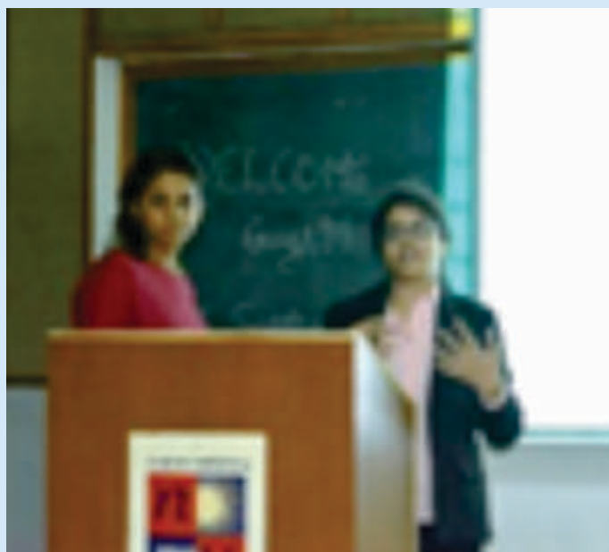
Participants at “Out of the Box”

The motto behind the event was to stir the innovative thoughts in the young minds of IM-NU. We definitely succeeded in doing so. Participants guessed characters from literature and movies. Participants had to write a story up to the interval. They enjoyed the event thoroughly.