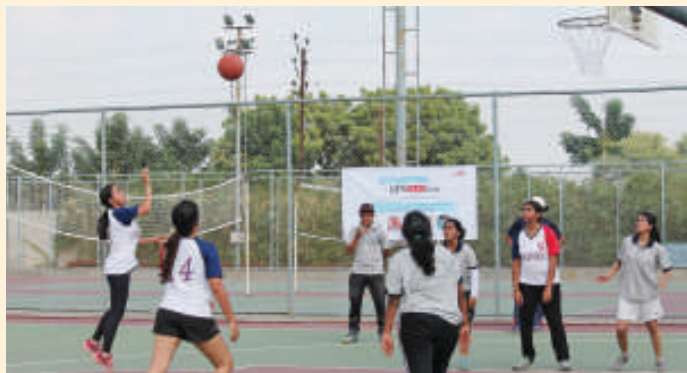
Parakram 2016 – The National Level Inter B-school Sports Event

colleges participated and fought for the trophy of Parakram. The tournament went down to the wire with both KJS and NICMAR having a chance to win the Parakram. Eventually it was team NICMAR who won the Parakram trophy. This year associate Parakram 2016 was associated with "Chetana Foundation" for the noble cause of Save Girl Child. Sportzzz. Comm celebrated Save Girl Child Day on October 6, 2016, encouraging the college fraternity to wear White clothes and Pink ribbon on this day. The staff members and students also supported and donated to the fund collection drive.