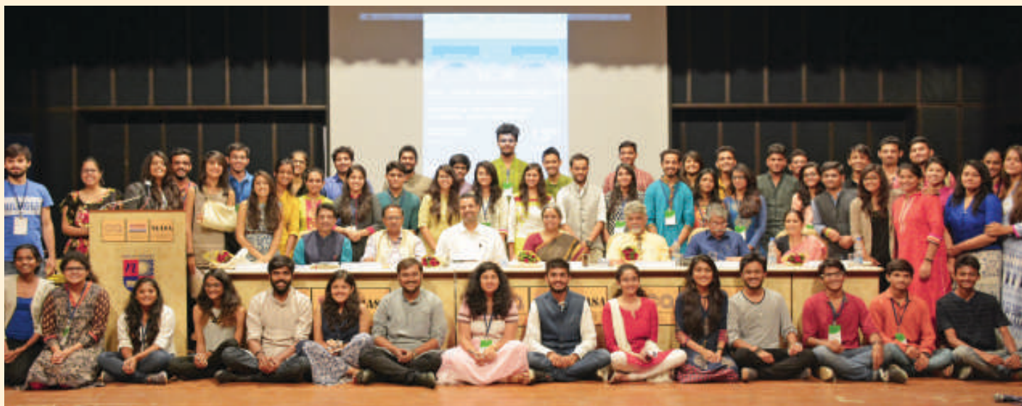
Zonal Public Jury Group Photo