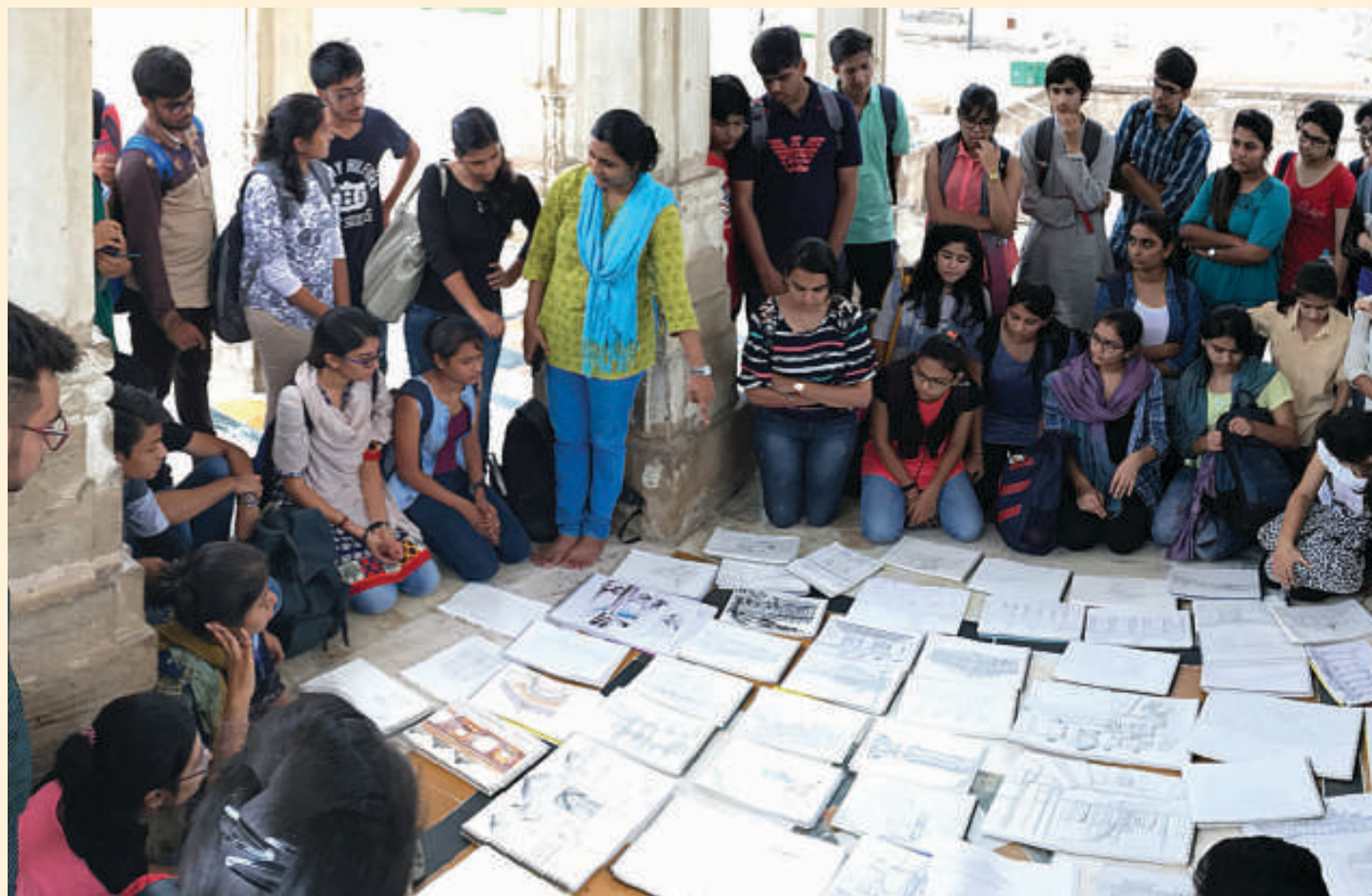
Discussion Session at Sarkhej Roja

The newly joined students of IAP-NU visited the Sarkhej Roja & Gandhi Ashram for a sketching trip as a part of their orientation programme on August 4, 2016. Along with it various workshops were organized for students such as origami.