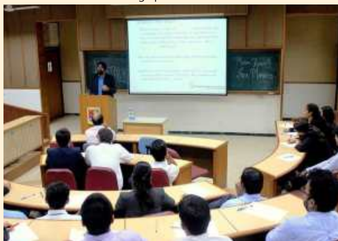
Fintalk on 'Findependence'