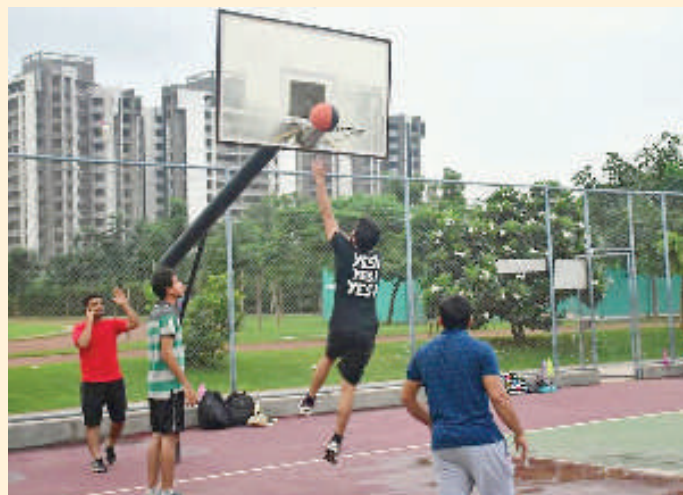
Slam Dunk 2016

players showcased their passion and aggression in the right sportsmanship.