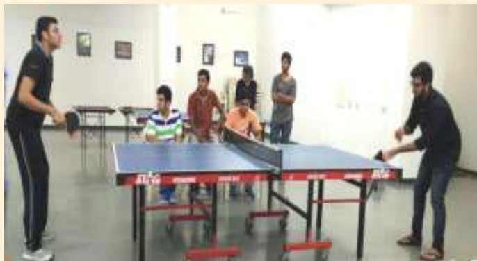
Table Tennis Tournament

A Table tennis tournament was organized on July 29, 2016 by Khelnayak--the Sports Committee (BBA-MBA) of Institute of Management, Nirma University. The purpose of the event was to indulge students in extracurricular activities and to provide them with a balance of academics and sports. The event was a successful one with full enthusiasm from students of the 2nd and 3rd years of BBA-MBA batch.