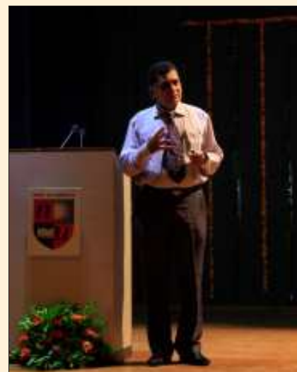
An engaging session of Utkrishta- the Management Conclave