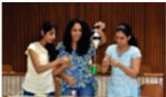
Participants at Junk to Jewel

‘Swayam’, the Entrepreneurship club of IM-NU, organized the event ‘Junk to Jewel’ on August 10, 2016. Participants were required to make innovative products out of recyclable trash. Two hundred students participated in this Intra Institute event using a limited budget, time and junk. They made innovatively designed products like a multipurpose table lamp, a study table, a chandelier, a solar panel, a fishing stick, a work station, a mini wardrobe and more.