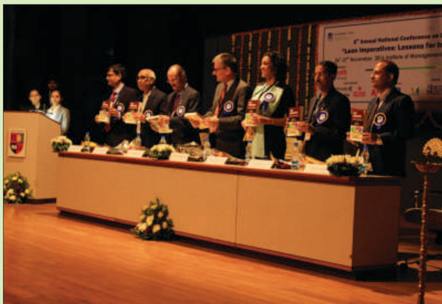
Delegates launching Conference Proceeding at the 6th Annual National Conference on Quality Management