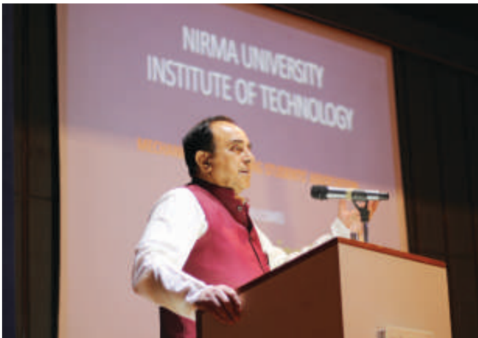
Dr Subramanian Swamy delivering Guest Lecture