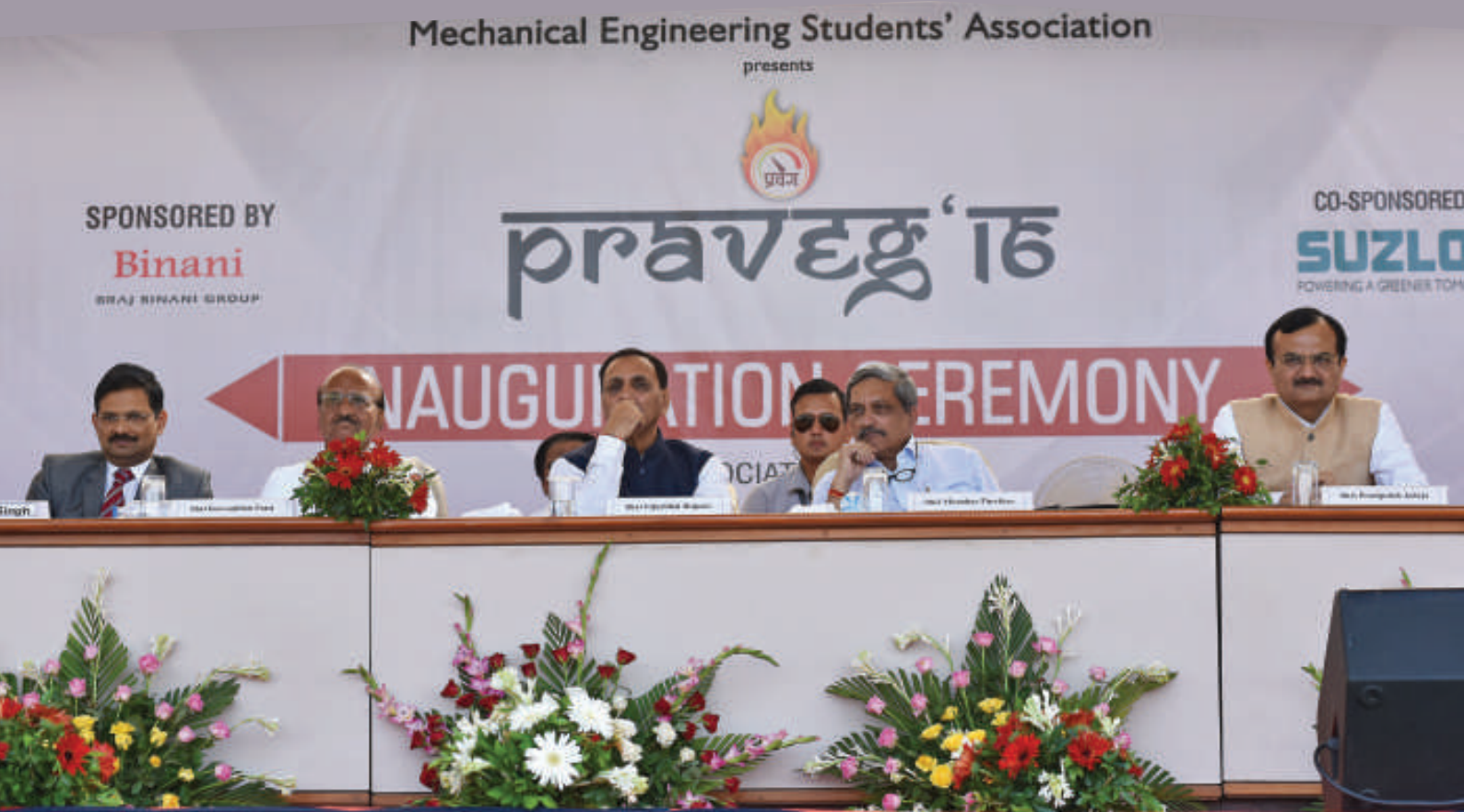
Shri Manohar Parrikar and Shri Vijay Rupani attending 'PRAVEG – Annual Techno Cultural Fest'