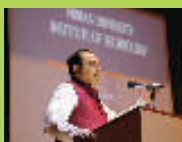
Guest Lecture by Dr Subramanian Swamy