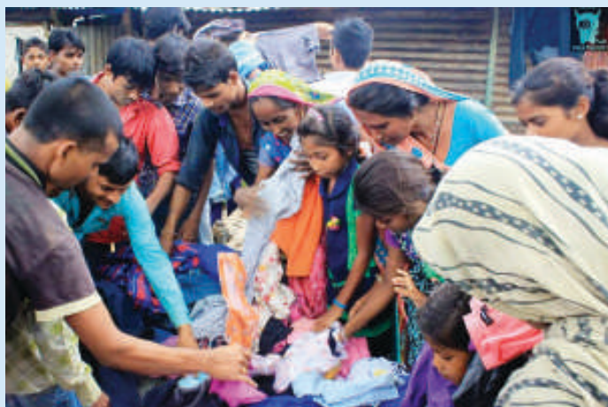
Friendship Day 2016

On August 7, 2016, a group of enthusiastic youth of Saral Foundation (an NGO of IM-NU) had arranged a celebration of Friendship Day in association with the Rotaract Club of IM-NU (RCIMNU). Saral Foundation, Rotaract and students of IM-NU exchanged Friendship Day bands with the children of workers working at the construction site of Nirma University. The children enthusiastically received gifts of umbrellas, footwear, chocolates and the love they received from the students. Refreshment and games were arranged for them. The cloth drive initiative by Saral Foundation was extended to residents of nearby slums.