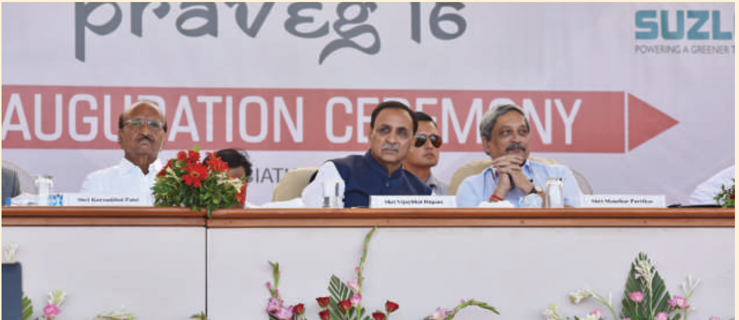
Dr Karasanbhai Patel, Shri Vijay Rupani and Shri Manohar Parrikar – PRAVEG 2016