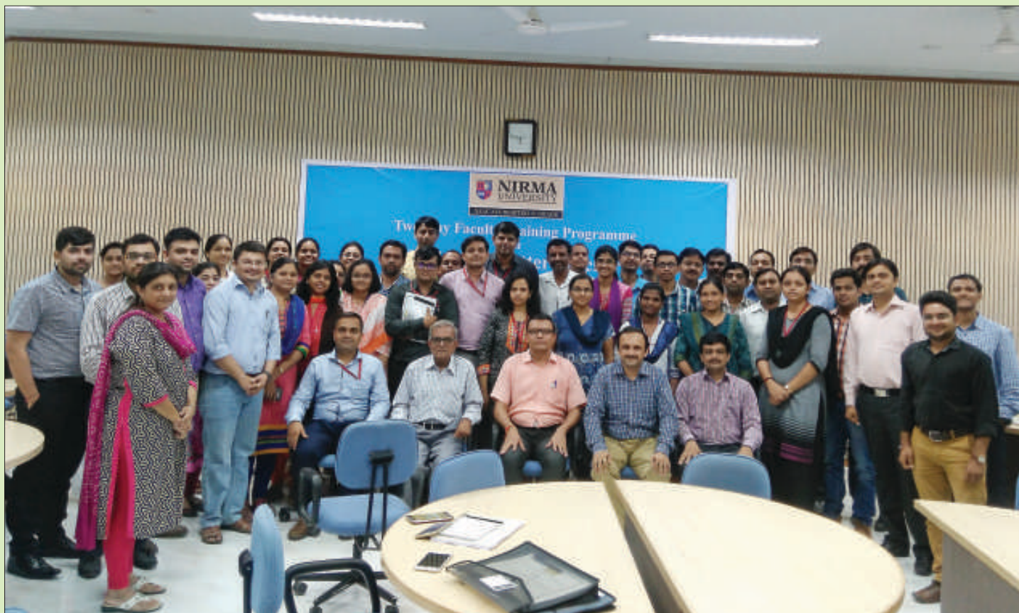
Participants of Two-Day Training Programme on “Building a Better Teacher”

A two-day training programme for faculty members from different universities, colleges, and polytechnics was organized by Academic Development and Research Cell during August 19 – 20, 2016. The topics for the programme focused on: Education Philosophy – Present and Past, Changing Role of Faculty, Addressing Large Classrooms, Art of Classroom Presentation, Digital Era Tools for Teaching-Learning, Assessing Classroom Effectiveness, Effective Student Mentoring. Twenty faculty members from different constituent Institutes of Nirma University and twenty three faculty members from Institutes like Pandit Deendayal Petroleum University, Gandhinagar; D. D. Thakar Arts and K. J. Patel Commerce College, Khedbhrama; LCIT College, Mehsana; S. B. Polytechnic, Savli; K. J. Institute of Engineering and Technology, Savli; and Charotar University of Science, Changa participated in the training program.