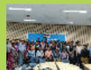
Training Programme by ADR