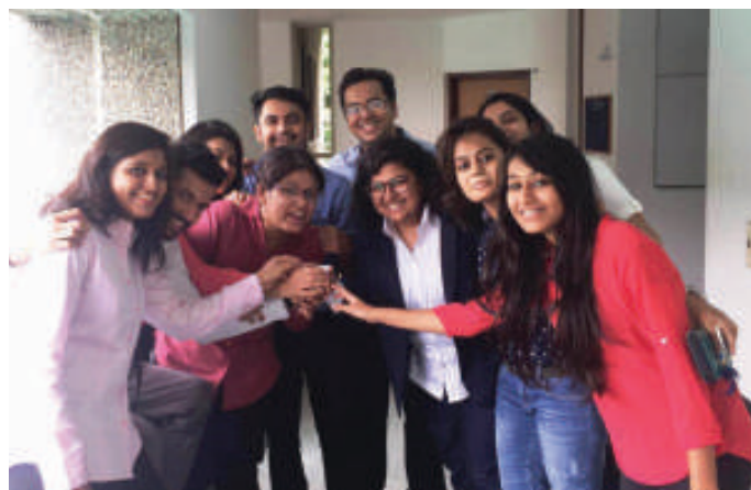
First batch of BBA-MBA students in the MBA phase

IM-NU welcomed its first batch of BBA-MBA students in the MBA phase beginning on July 11, 2016 with a week-long induction programme full of activity oriented learning.