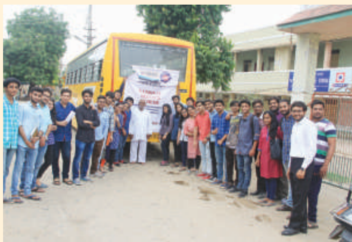
NSS volunteers on Duty

NSS volunteers did a field visit to the adopted Jamiyatpura village in Gandhinagar on October 1-2, 2016 where the NSS volunteers conducted survey of 260+ houses of Jamiyatpura village and oriented the students of the middle school and village residents about Swacchh Bharat Scheme and benefits and needs of Cleanliness.