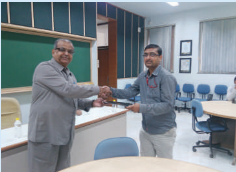
Inaugural Function of Training Programme for Laboratory Assistants, Computer Operators and Computer Programmers