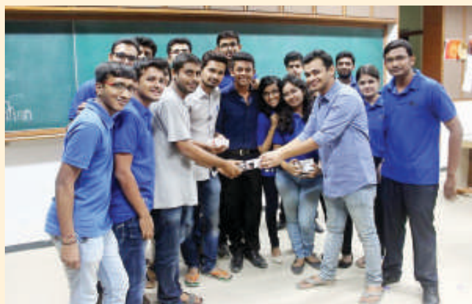
Cognition by Finesse, the Finance Club

Finesse, the Finance Club of IM-NU organized the event "Cognition– Gamble with your knowledge" on October 17, 2016. The event was held to enable the students to learn about the financial aspects, concepts and frameworks through a fun game and brush away the fear of finance. It helped to engage students in the field of finance and to test their knowledge of the current events happening in India and around the world. The event had 3 rounds existing of crossword, dominos effect and technical round. Prizes were given to the top 2 teams. 90 teams comprising of 180 students participated in it. It comprised of three distinct and well-planned rounds revolving around various aspects of finance.