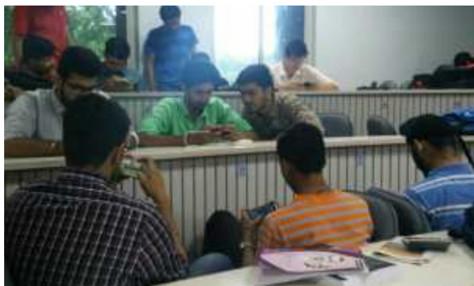
LAN gaming –“Mini Militia”

On July 14, 2016, the BBA Cultural Committee conducted its event for semesters III and V “Mini Militia”, a virtual LAN gaming activity. Overall 42 gaming enthusiasts participated in the game in groups of three, and played in two rounds of 10 and 12 minutes each. The arena was filled with excitement and energy as the students tried to reach the top scores.