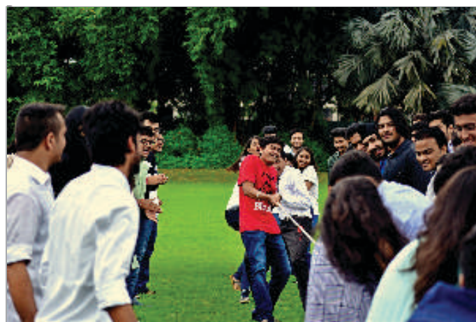
A Tug of War during 'Crescendo'

On September 1, 2016 the BBA Junior-Senior Fusion, a wonderful event was organized by Abhivyakti- the BBA Cultural Committee. Everybody had great fun participating in interesting games like a Tug of War, a Selfie Game and a Junior-Senior Interaction Game. It was organized to promote a healthy intermingling of students from the various batches of the BBA