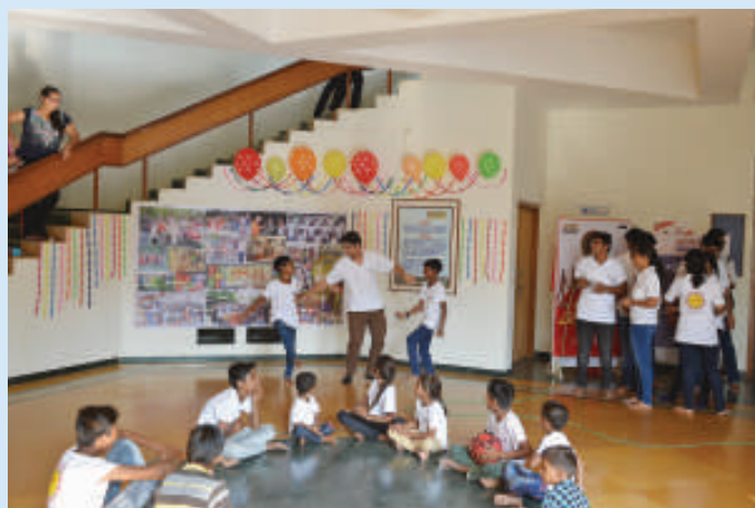
Saral Foundation Day Celebrations

The students of IM-NU – on October 2, 2016 – celebrated the Saral Foundation Day. The children had come along with their parents to be a part of the celebration. Various fun events were organized for their entertainment. One of the students presented a stand-up comedy. The atmosphere was filled with laughter when he started unfolding his humorous punches. Other students played musical instruments and sung various songs. They were given study tables and lunch boxes as presents which will help them to study better.