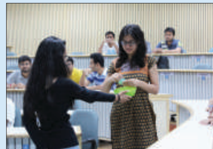
Participants at the Rotract Quiz

All the film and TV series lovers were thrilled, when Rotaract Club of IM-NU organized their first event, "Pehchaan Kaun". In the online round 10 out of 37 teams qualified for the offline round. The offline round, was further divided into two rounds. The first one tested the participants' knowledge of TV series, Cartoons, Sports. The participants relived their childhood memories when they were made to recollect about the cartoon characters and names, which they all grew up watching.