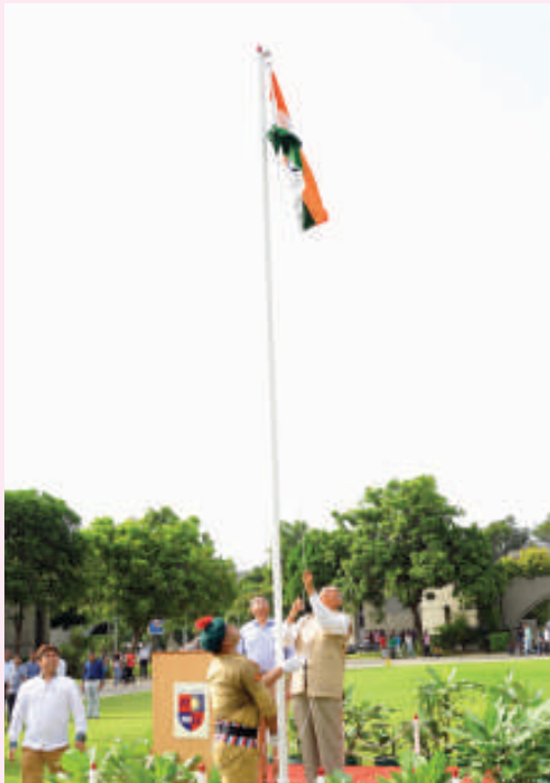
Flag Hoisting on 71st Independence Day