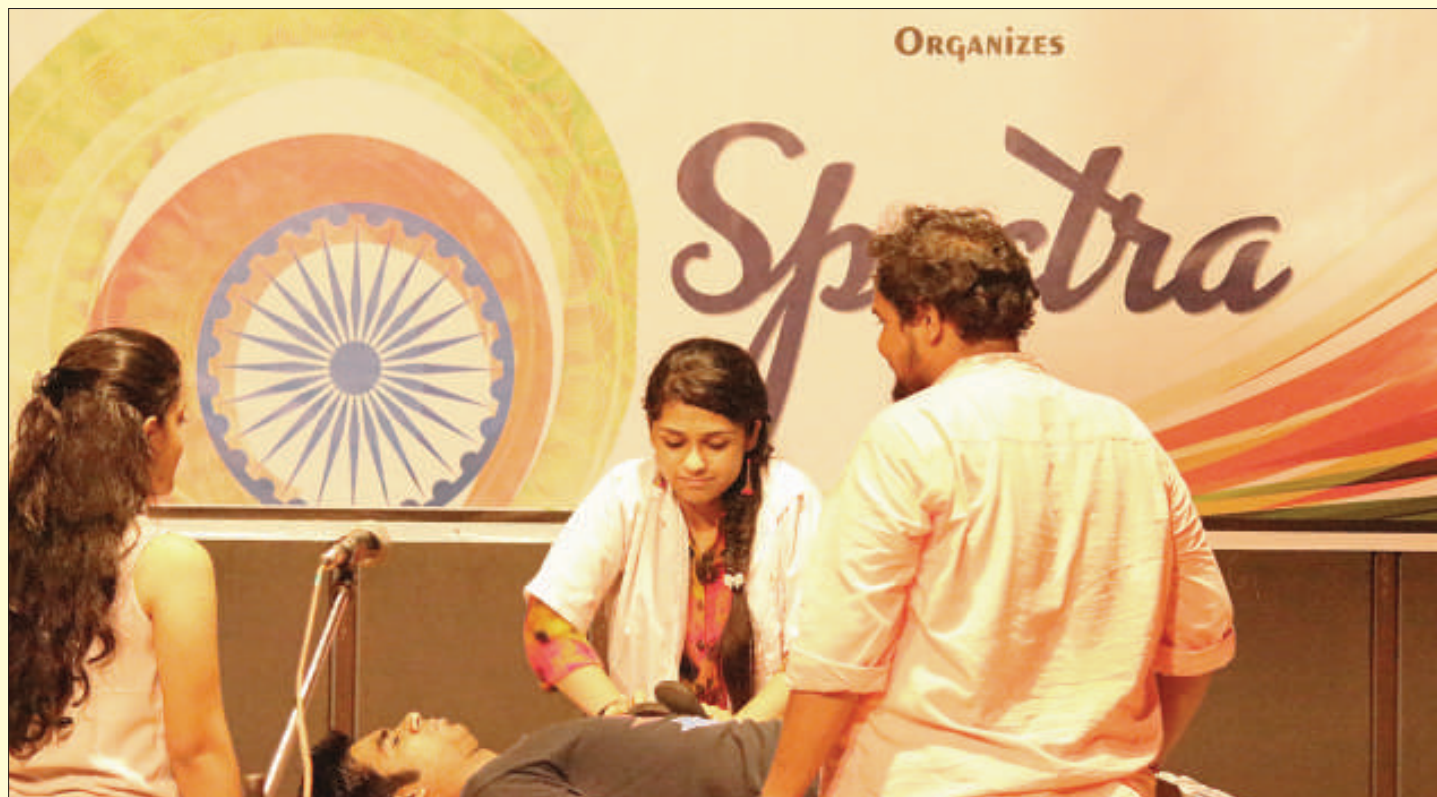
Spectra 2017 – An Act

All clubs (Drama club, Music club, Art and Craft club, Design club and photography club) of IP-NU in association with NIPSA conducted SPECTRA 2017. It was organized during August 22 - 23, 2017 at IP-NU and about 200 participants from various pharmacy and other colleges, and many students from IP-NU has participated in this colorful event. Various events like Body Painting, Mehandi, Rangoli, Ad-Mad, Mono acting, logo designing, photography (Theme: Rural), Singing and Musical Instrument competition were hosted where the participants presented their idea of patriotism and freedom in the vivid artistic forms. The theme of the entire event was Patriotism. The event was a grand success and it inspired everyone by spreading the message of nationalism.