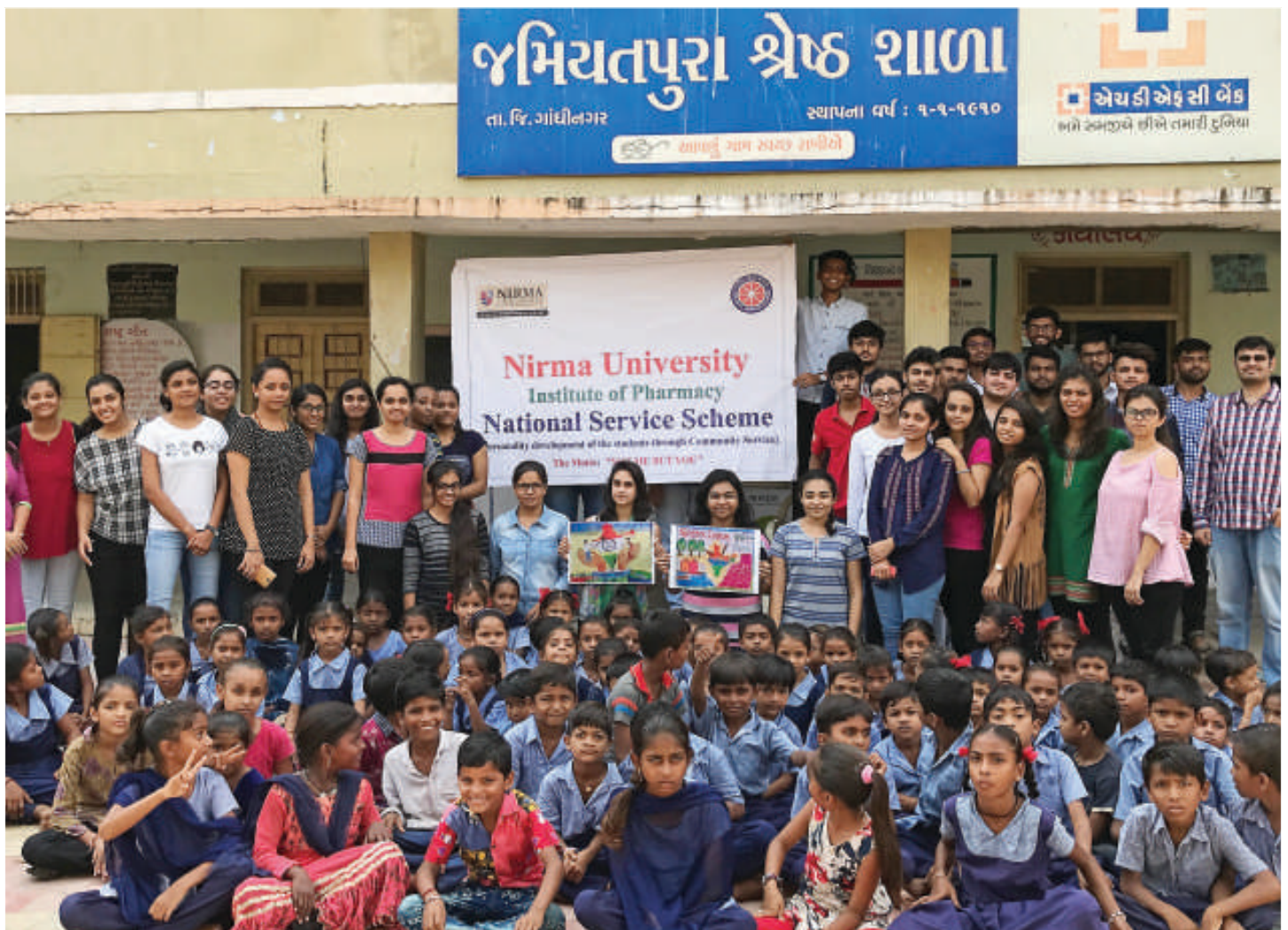
Activities at Jamyatpura Village

The students of B. Pharm Semester V, IP-NU visited Primary School at Lilapur and Jamyatpura village and conducted various activities like cleanliness drive, awareness session on health and hygiene, sports etc. as a part of Social Extension Activity.