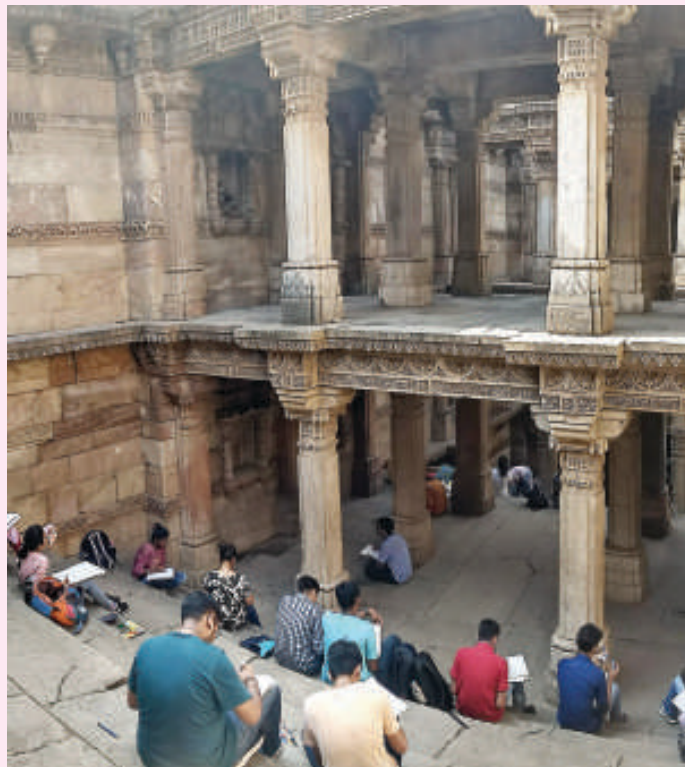
Students at Adalaj Stepwell

Students visited Adalaj stepwell, Sabarmati ashram, riverfront, GIFT city and AUDA as a part of orientation program.