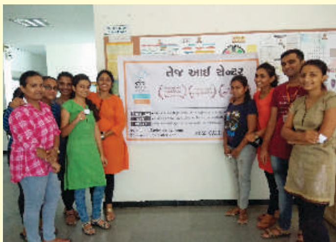
Visit to Tej Eye Center