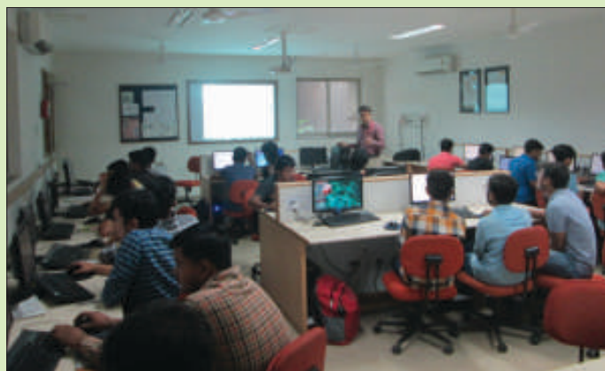
Training Program on "Solid Modelling using CAD Software" conducted by IT-NU on every working Saturday from July 15, 2017 to November 25, 2017