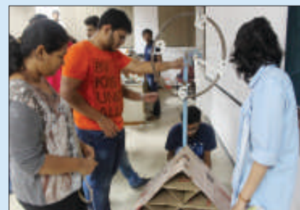
Jewel in the Making

On August 10, 2017 Swayam– the Entrepreneurship club of IM-NU organised Junk to Jewel, which was based on the concept of Upcycle. The idea behind this event was to bring out the skills of turning waste material or junk into something productive and creative or jewels while thinking on one's feet. The teams were provided with inventory right out of the junkyard and they had to generate an idea of a product and had to make it using the waste materials. The teams pitched great products which reflected their thinking skills, creativity, execution of ideas and overall presentation.