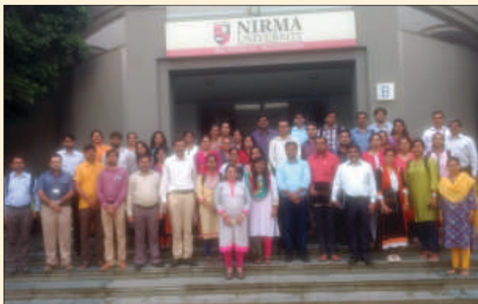
Participants of workshop

A two-day workshop on 'Digital Era Tools for Teaching-Learning' was organized during September 15-16, 2017. The workshop was attended by 47 faculty members of universities, colleges and polytechnics from the Institutions of Higher Education from across different parts of India and faculty members from different constituent Institutes of Nirma University. The workshop consisted of hands on session on "Information and Communication Technology (ICT)" tools that can be integrated in teaching-learning for faculty of higher education. There were sessions on: (i) Tools and Rubrics for designing flipped class rooms (ii) Tools for designing Massive Open Online Courses (MOOC) (iii) Use of Moodle for managing eResources and administering eAssessment.