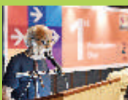
Foundation Day DoD-NU