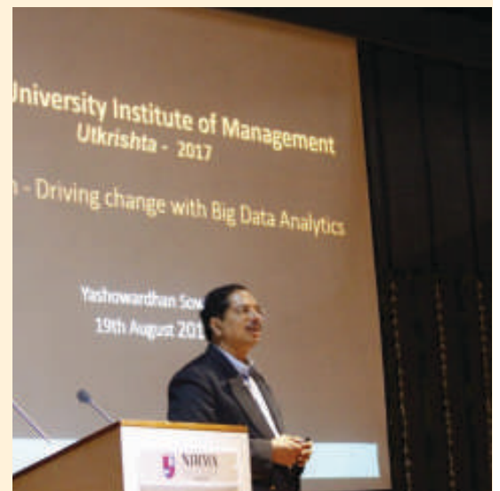
Speaker at Utkrishta