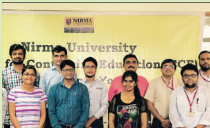
Training Program on "Programmable Logic Controller" conducted by IT-NU on July 1-31, 2017