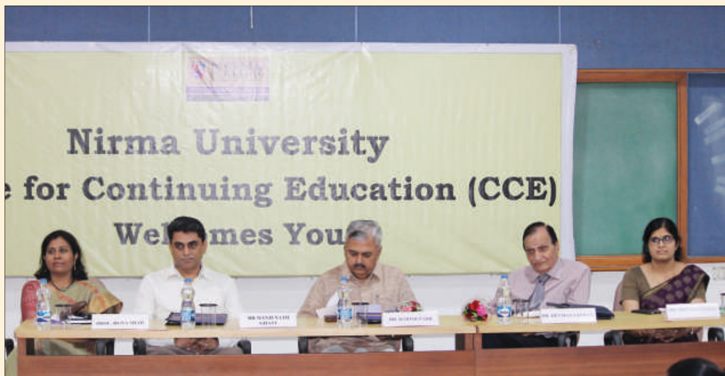
Medical Writing Workshop