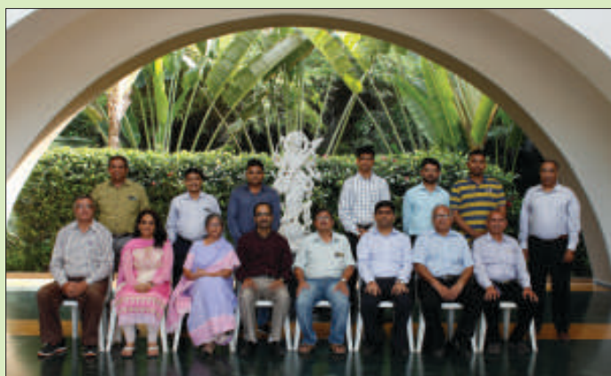
Management Development Programme on "Decision Making & Problem Solving Skills For Managers" conducted by IM-NU on September 14 - 15, 2017