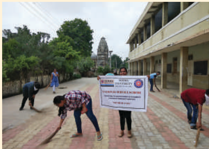
Cleaning in Progress – IL-NU