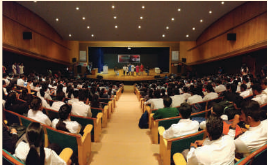
Audience enjoying singing performances

Deshraag – a patriotic song competition was held on August 11, 2017 by Nirma University for students and staff. The event was in Institute of Management Auditorium and it proved to be a huge success. The participants displayed never-seen-before sentiments on the stage singing songs that reverberated, infusing nationalistic spirit in the audience.