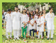
Celebrating Independence Day