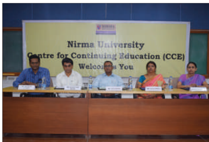
Hands on Training