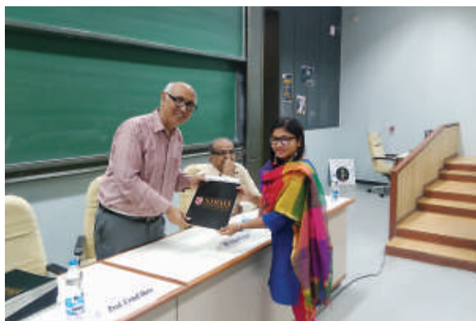
Participant receiving Certificate

The ADR Cell had organized Induction Training Programme for the faculty members of Nirma University during May 29 - June 23, 2017. The Certificate Distribution Function of the Induction Training Programme was arranged on August 19, 2017. The honorable Director General and Director (Academic and General Administration) of the University graced the occasion and congratulated the participants for their successful completion of the programme. A few participants gave their feedback about the programme.