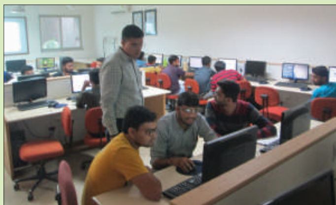
Training Program on "Advanced Finite Element Analysis using CAE Packages for Engineers and Working Professionals" conducted by IT-NU from September 4, 2017 to October 5, 2017