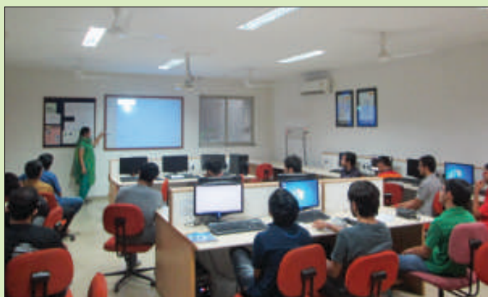
Training Program on "Finite Element Analysis using CAE Packages" conducted by IT-NU from August 22, 2017 to September 12, 2017