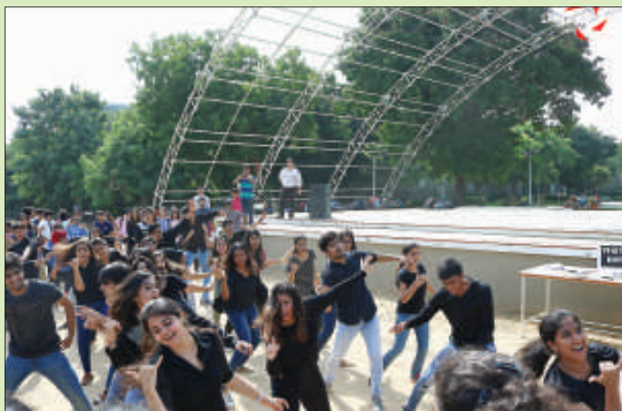
Freshers' Party in Progress

This enthusiastic event at IM-NU on September 20, 2017 marked the fun-filled interaction of the senior students with those in the First Year of the BBA programme. This was the Freshers' party for the new batch of BBA-MBA students. With the motive of getting to know one another, the event included