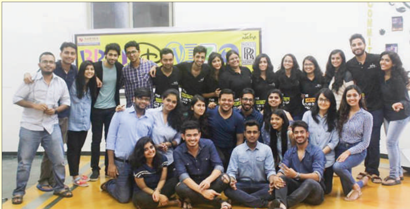
Group of Brandwizer

Niche - the Marketing Club of IM-NU hosted the first event of the year, Brandwizer 2017 on July 27, 2017. The event went on floors with around 300 people participating to showcase their knowledge of brands and everything related to them. It measured the students' acquaintance with various logos, taglines, mascots, brand names and crosswords. The event gathered a huge crowd that turned the venue a lively, spirited place.