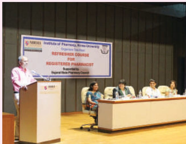
Refresher Course – IP-NU

IP-NU organized Two Days "Refresher course for Registered Pharmacist" which was supported by Gujarat State Pharmacy Council during September 16-17, 2017. Eminent speakers from pharmaceutical industries, hospitals, practitioners, academia and clinical research organizations delivered talk on varied topics. 210 participants with background of Retailers, Community pharmacists, hospital pharmacists, pharmacist from industries, clinical research organizations attended. Their knowledge pertaining to ethics, patient compliance, adverse drug reactions and drug interactions was refreshed. Recent advancements in HIV, novel drug delivery system and bioavailability of drugs were also discussed.