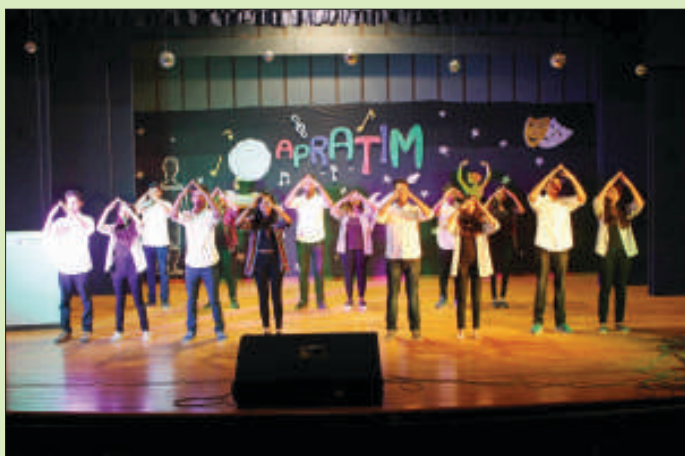
Students performing at Apratim 2017