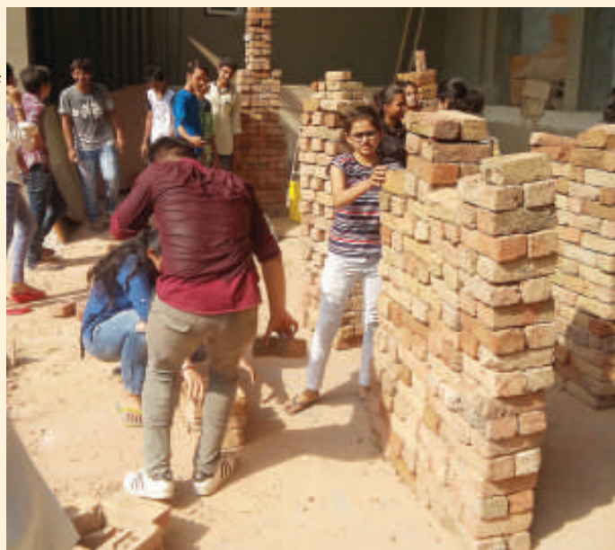
Students at Adalaj Stepwell