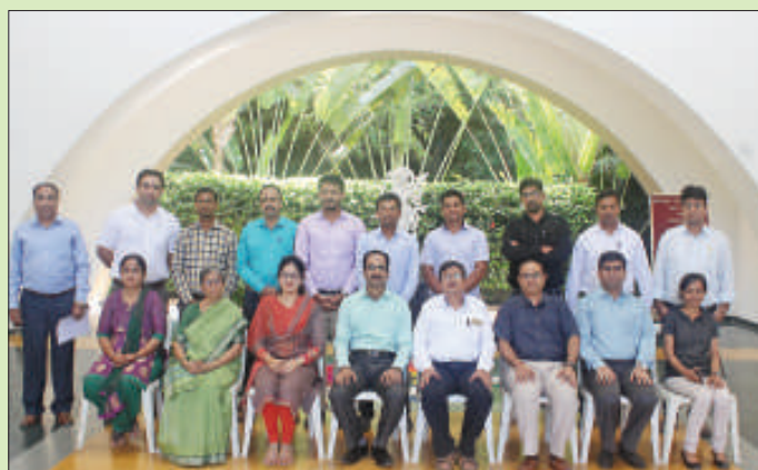
Management Development Programme on "Effective Communications for Higher Performance" conducted by IM-NU on September 28 - 30, 2017