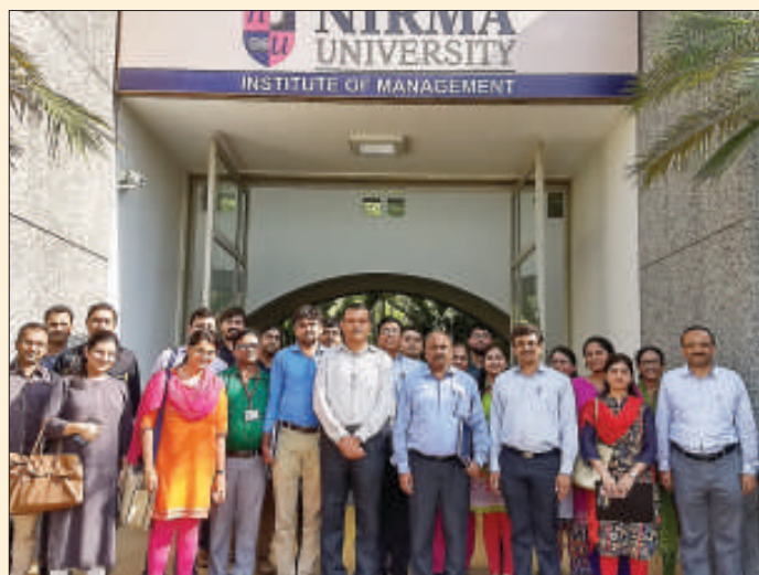
Participants of ROP 2017

Research orientation programme for faculty members of Nirma University was organized by the Directorate of Research and Innovation, Nirma University during June 5-17, 2017 (Phase-I and Phase-II) and June 17- August 19, 2017 (Phase-III under the Mentor). Sixteen faculty members from all constituent Institutes of Nirma University who are aspirant PhD candidates or have just started their Ph.D. attended the program. The major topics covered during the program included: research proposal writing; literature review; data analytics; referencing software; e-learning resources; referencing/bibliography; h index, citation index, impact factor; Ph.D. Programme under Nirma University; innovation and intellectual property; patenting; application of statistics in research; tools and techniques of research; funding agencies. The participants actively participated in all the sessions.