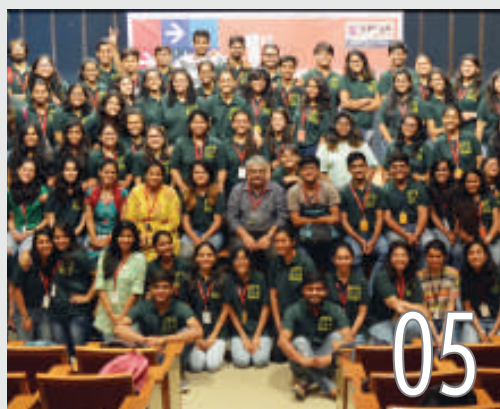
DoD - NU Students