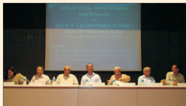
Panel Discussion on Use Of ICT in Governance of India: Ideas for a renewed nation.