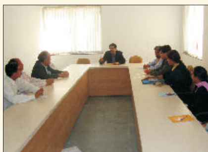
Institute of Science, NU constituted Institute of Science Advisory Committee (ISAC). Discussion in progress.