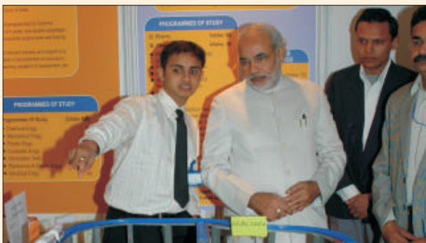
Shri Narendra Modi at exhibition during Indian Science Congress, 2005