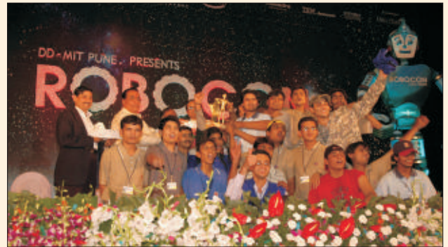
Institute of Technology, NU students' winner team of ROBOCON, 2006