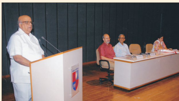
Shri T. N. Seshan at Institute Lecture Series, July, 2007