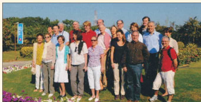
Foreign Visitors at University Visit