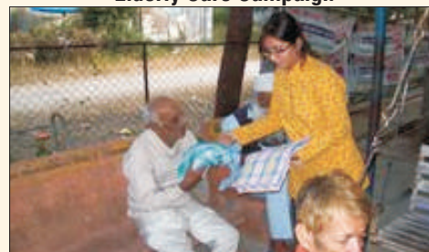
ECON arranged a visit to Krishna Vriddhashram, Gandhinagar on 15 th Nov, 2009 by IDS-NU. The objective of the visit was to donate the amount generated by selling card from exhibition of greeting cards. They also donated towels, distributed biscuits and chocolates to the elderly people.