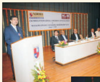
Mr. Uday Kotak, Vice Chairman & Managing Director, Kotak Mahindra Bank Ltd at inauguration of NICOM-2010