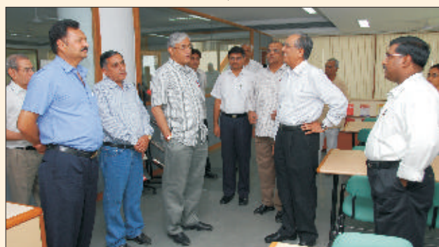
Bar council member's visit, 2007