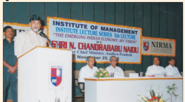
Shri N. Chandrababu Naidu at 10 th Institute Lecture Series, 2005