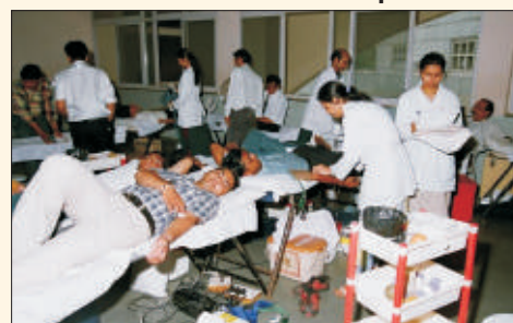
ISTE student Chapter, IT-NU organized. Blood Donation Camp, 12 th & 13 th Feb, 2010 in collaboration with Red Cross Society.