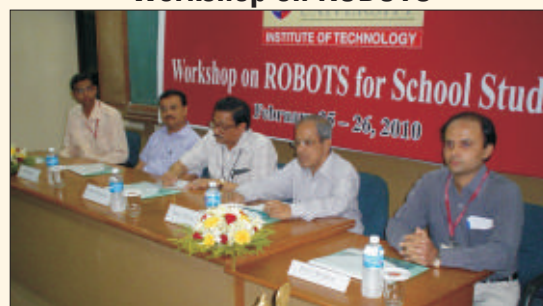
Inauguration of two days workshop on ROBOTS for school students on 25 th Feb, 2010 by Mechanical Engineering Department, IT-NU.

One week, in-house Induction Training programme was organized for faculty members, 29 th Dec to 4 th Jan, 2010, IDS-NU