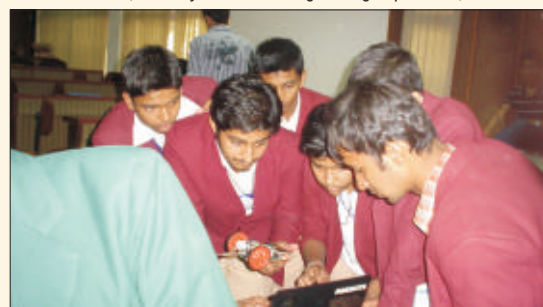
School students at workshop on ROBOTS