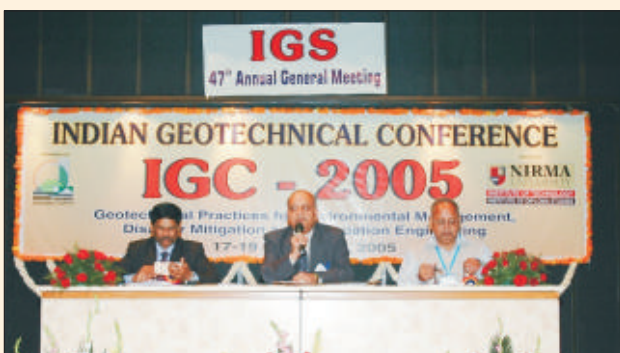
Indian Geotechnical Conference, 2005