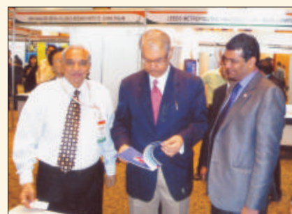
High Commissioner of India Nirma University Stall, 6 th Feb, 2010