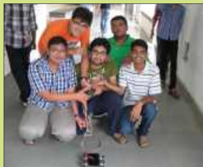
Students exhibiting robot at Gyan Aarambh '12 organized by Electrical Engineering Department of IT-NU.

Electrical Engineering Student's Association (EESA) of IT-NU organized their annual event "Gyan Aarambh'12" on August 4, 2012. This workshop was organized for the students of Semester 1, and was aimed to impart the knowledge regarding all the domains of construction of basic manual robot.