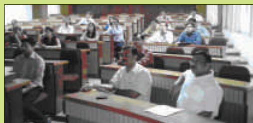
Participants during the inauguration of Research Methodology Workshop at IT-NU.

A 2 week ISTE workshop on “Introduction to Research Methodology” was organized for the Teachers and M. Tech. students by the CSE Dept of IT-NU in collaboration with IIT Bombay and MHRD, New Delhi as National Mission on Education through ICT from June 25 to July 4, 2012.