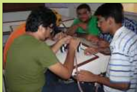
Students participating in the event Gyan Aarambh '12 organized by Electrical Engineering Department of IT-NU.