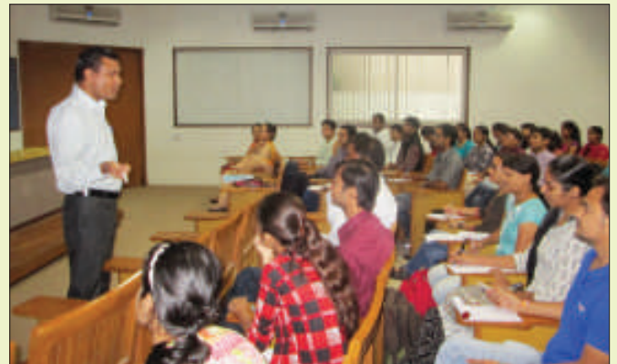
Glimpses of Workshop on 'Antenna Theory and Design'