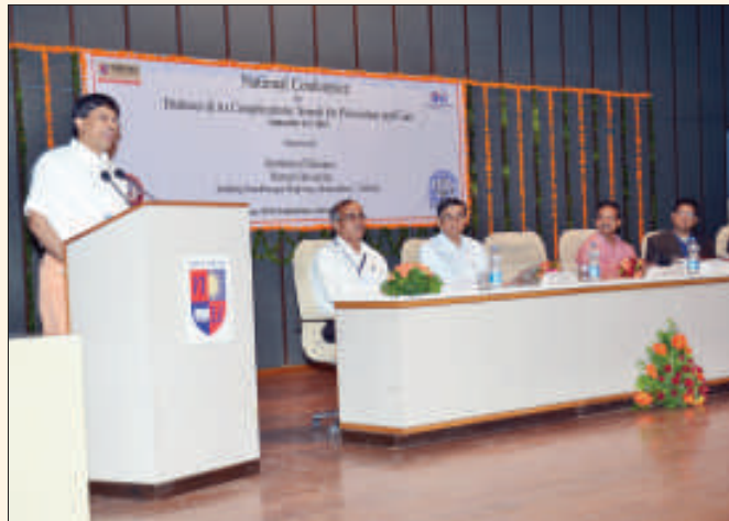
A glimpse of the National Conference on 'Diabetes and its Complications: Search for Prevention and Cure'