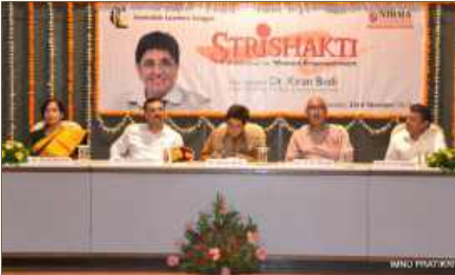
Dr Kiran Bedi, India's first IPS officer, at 'Strishakti'- a Seminar on Women Empowerment, IT-NU

India's first woman IPS officer, Dr Kiran Bedi was in IT-NU to deliver a talk on 'Strishakti: Empowering Her' on October 24, 2013. She discussed women empowerment and its challenges with a full house. The event was facilitated by 'Invincible Leaders' League', a student's leadership group from IT-NU.