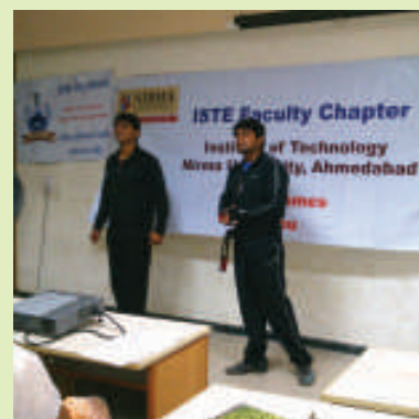
Rushiraj Martial Arts experts during the Self Defence Technique for Women organized by ISTE faculty chapter, IT-NU