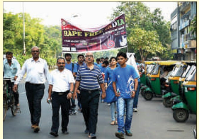
Glimpse of the Campaign initiated by Rotaract Club of Nirma Institute (RCNI), IT-NU