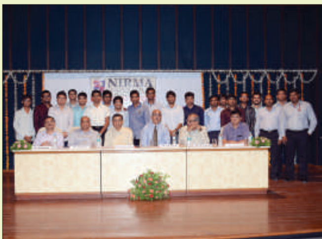
Felicitating of the entire group for winning an event in the national level BAJA-SAE competition during Foundation Day of IT-NU on October 03, 2013

IT-NU celebrated its Foundation Day on October 03, 2013. Various activities were planned by the various students' club in IT-NU. A final grand event of felicitating students and faculties was organized for their outstanding achievements.