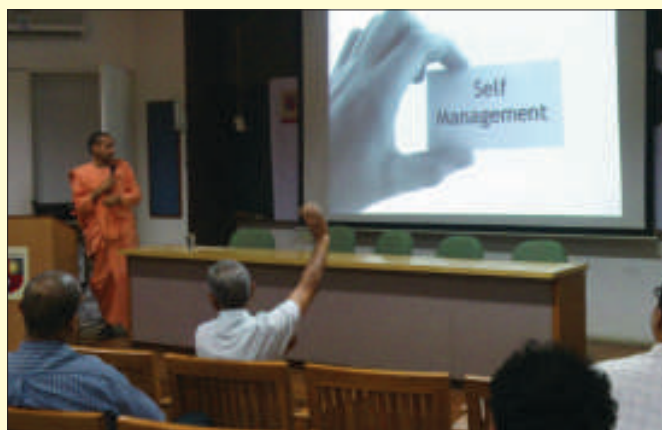
Swami Rohininandasaji delivered a lecture on 'Art of Mind Control' at IT-NU on September 7, 2013