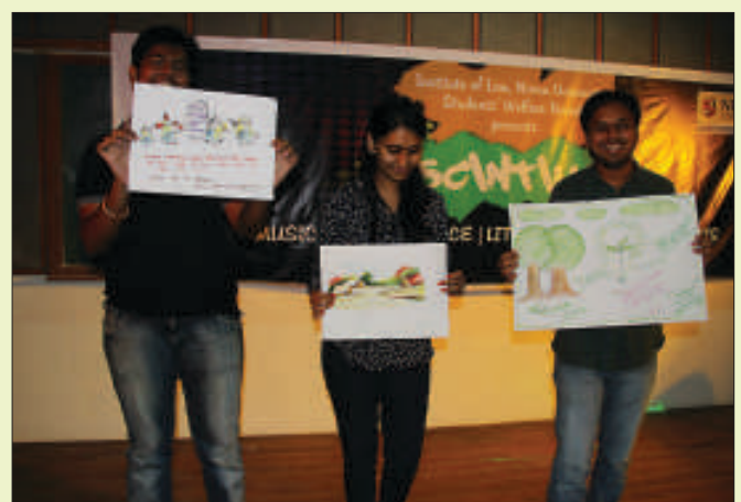
Students performing in 'Scintilla 13'

This event was an excellent opportunity for students to showcase their talents in various forms of art and literary events and they also get a chance to represent the institute in the Inter-Institute Cultural Fest. There was an enthusiastic participation from the students in all the categories. The audience witnessed some great hidden talents.