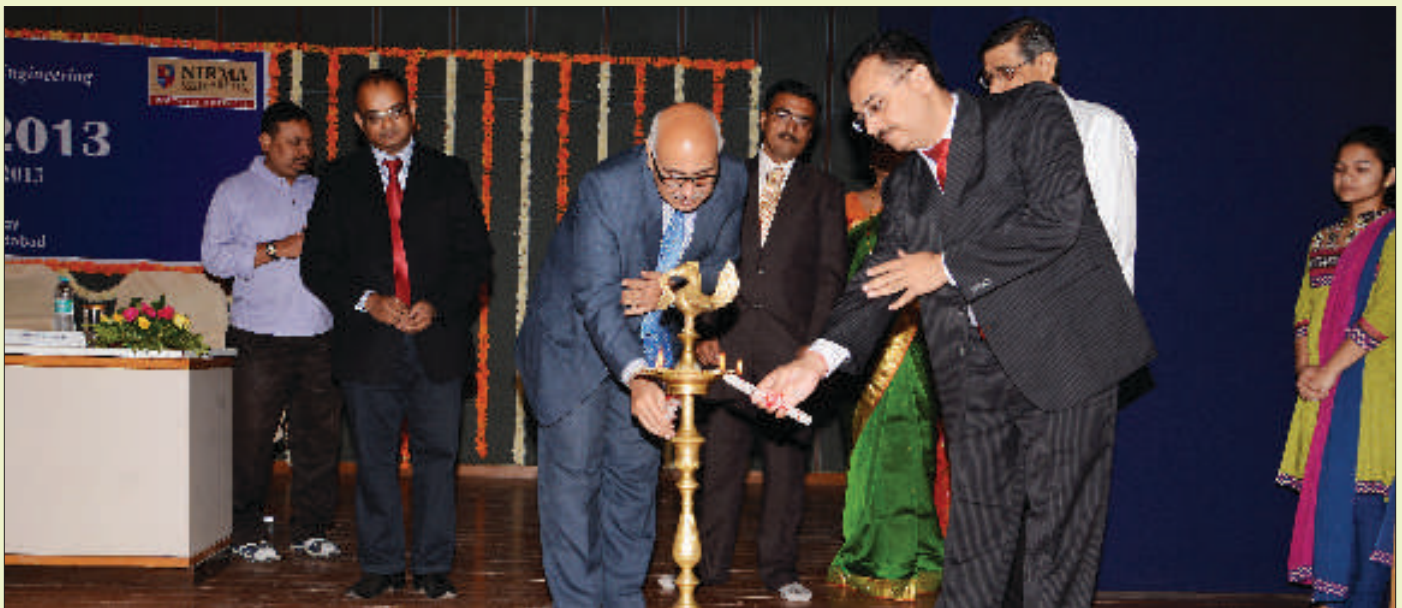
Dignitaries at the inaugural ceremony of NUiCONE-2013, IT-NU