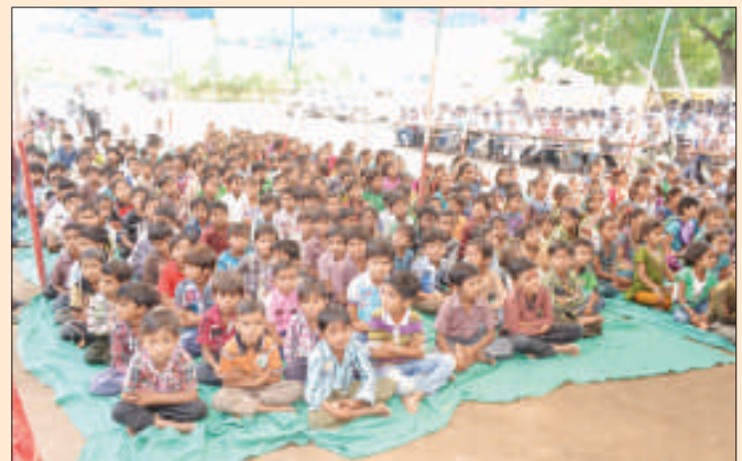
Glimpses of Legal Awareness Camp at Kherana Village