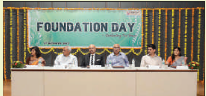
Dignitaries on dais during the Foundation Day celebration at IP-NU