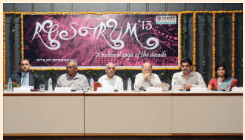
Dignitaries on dais during the Annual Cultural Festival 'Rostrum' at IP-NU