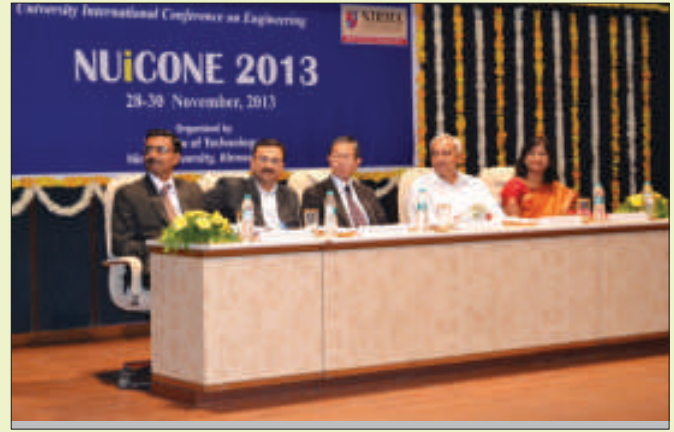
Dignitaries on the dais during the valedictory function of NUiCONE-2013, IT-NU