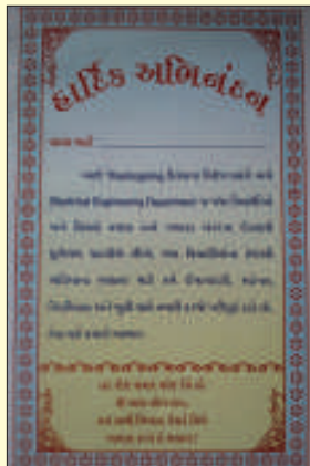
'Thanksgiving Letter' given to the helping staff members of the University

accomplished by appreciating the work and efforts dedicated by the helping staff in the university, which included the bus drivers, peons, conductor, security guards and sweepers.