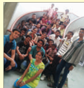
Student members of EESA with kids on the occasion of 'Big Brother' organized by IT-NU

Students' organization of IT - NU conducted a blood donation camp in collaboration with Red Cross Society on October 8, 2013.