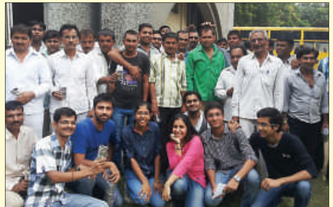
Student Members of EESA with the helping staff of the university on the occasion of 'Thanksgiving Day' organized by IT-NU