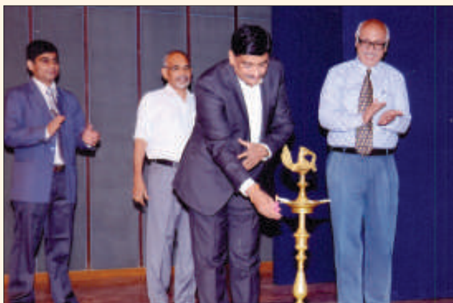
Chief Guest of Pravartan -2013- The HR Conclave lighting the lamp

'Pravartan 2013' – The HR Conclave was held on October 3, 2013. The theme of the conclave was 'HRM Function: Current Challenges and Opportunities'. The Sub Themes of the conclave were 'Cross Cultural Issues in Globalized World', 'Leading in Turbulent Times: an Agenda for HR Professionals', 'Role of HR in Corporate Social Responsibility' and 'HR and Organizational Change Initiatives'. The conclave