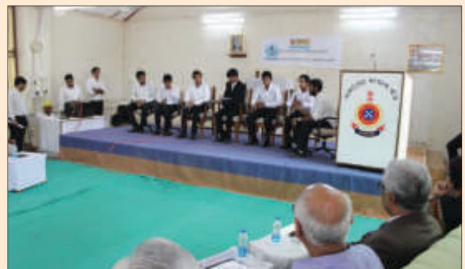
A glimpse of Legal Literacy Programme at Sabarmati Jail