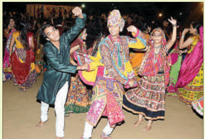
Students performing during Ras-Garba 2013

Ras-Garba (Rmamtat) 2013 of Nirma University was organized on October 19, 2013 at the University Ground. Faculty and Staff members along with students in large numbers attended the function.