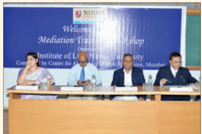
Dignitaries on the dais during the Mediation Training Workshop at IL-NU