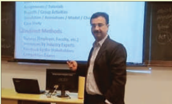
Director IT-NU, addressing the audience during the workshop