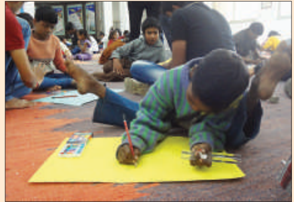
Children participating in the event ‘Paint your Dreams’

IM-NU in association with X-lliant organized the event-‘Paint Your Dreams’- Where every dream is precious, for the underprivileged children of the society. The event was organized on the November 24, 2013 on the University campus. The Cultural Committee at IM-NU in collaboration with Saral – Social Club of IM-NU conceptualized and gave shape to the event. A total of 175 children from various NGOs in Ahmedabad viz. Manav Sadhna, Apang Manav Mandal and Prayaas, the NGO of IIM Ahmedabad took part in the event.