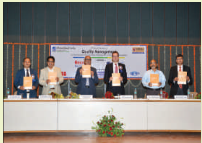
Dignitaries on the dais releasing the 'Compendium-The Collection of Deliberations' during American Society for Quality (ASQ) Seminar