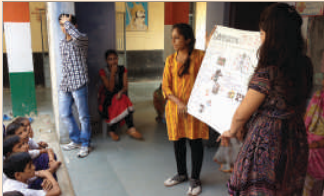
Health Awareness Camp at Tragad Primary School organized by IP-NU

IP-NU organized a Health Awareness Camp at Tragad Primary School on October 5, 2013 with support from Nirma University. The student volunteers gathered information, procured professional video-films and prepared posters to explain importance of good habits, healthy food, cleanliness, symptoms, prevention and care in tuberculosis and how to take medicines. Approximately 175 students attended the activity, and promised to follow good habits.