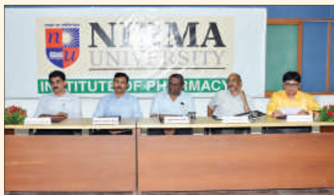
Dignitaries on dais during Orientation Programme of IP-NU