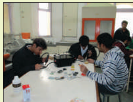
Workshop on Mobile Handset Repairing