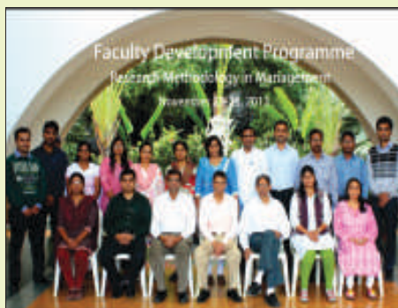
Faculty Development Programme on Research Methodology