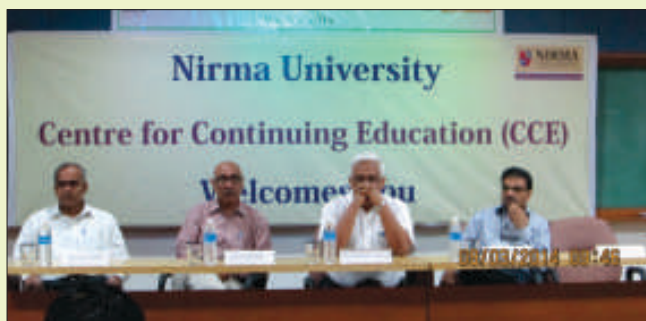
Current Trends in Molecular Biology Programme