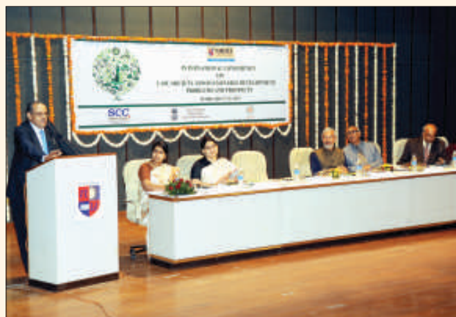
Dignitaries on the dais during the International Conference at IL- NU