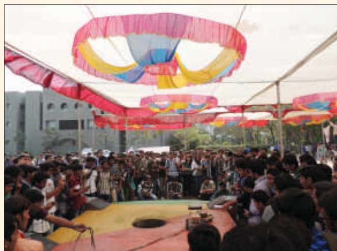
Enthusiastic participation of students at NU-Tech 2014 at IT-NU

Nirma University Technical Festival 2014 (NU-TECH '14), a National Level Techno-Management Colloquium was organized at IT-NU during February 14- 16, 2014. About 78 technical and non-technical events were conducted in the Tech Festival. More than 2000 participants from Gujarat as well as from all over India participated in the event.