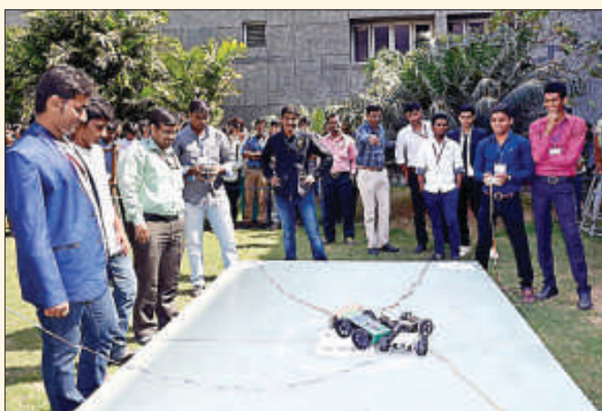
Students participating in the event on Robotics at Tech Fest- 2014 at IDS-NU