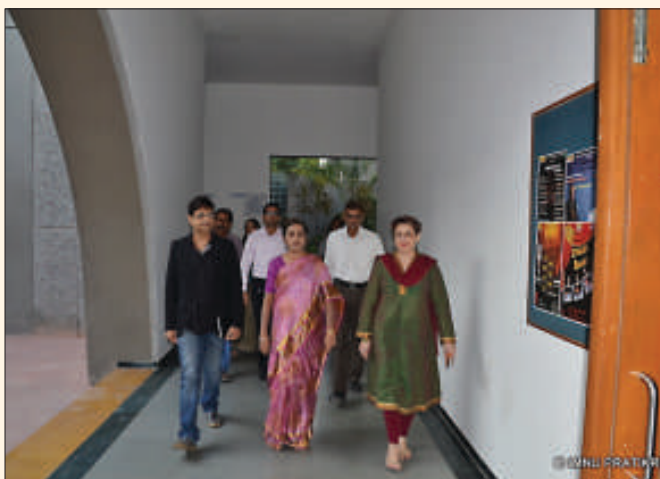
Dr Irshad Kamil at IM-NU along with faculty of the Institute

Dr Irshad Kamil, noted lyricist, poet and winner of Best Lyricist at the Filmfare Awards 2011 and 2012, visited IM-NU on December 8, 2013 and delivered a talk on 'Main Aur Mere Alfaaz' during the Management Fest of the institute.