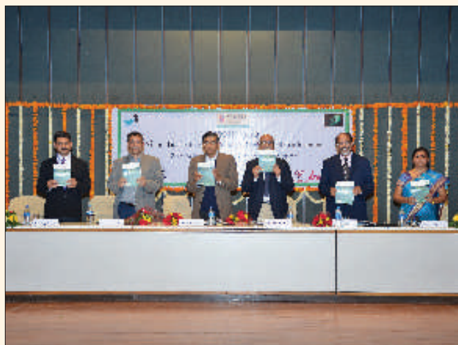
Dignitaries on the dais releasing Nirma Institute of Pharmacy Journal during the Second Nirma Institute of Pharmacy International Conference