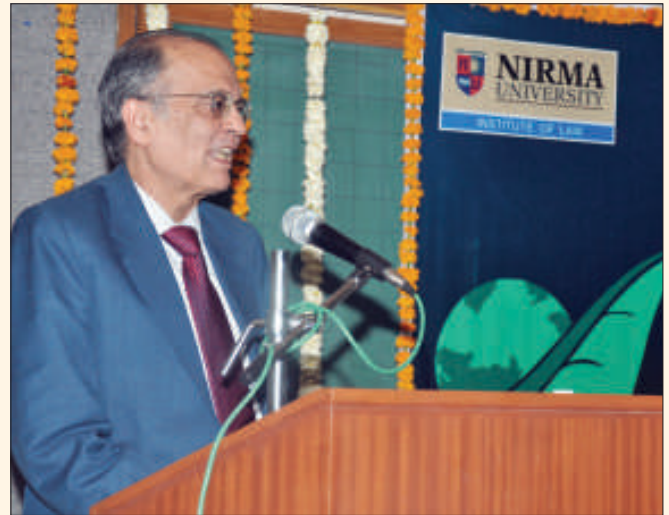
Hon'ble Mr. Justice C. K. Thakkar, Judge (Retd.) Supreme Court of India on February 21, 2014 at IL-NU