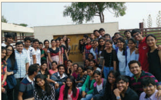
Students of IP-NU during Industrial Visit

Industrial visits to Sun Pharma R & D Centre at Vadodara and Piramal Discovery Centre at Ahmedabad were organized for M. Pharm students on January 4 and February 1, 2014. The students of B.Pharm visited Nirlife Ltd, Sachana on February 20-21, 2014.