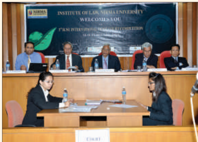
International Moot Court Competition at IL-NU