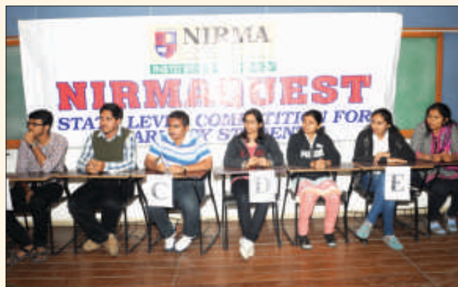
A Glimpse of participants in a competition organised during Nirma Quest 2014