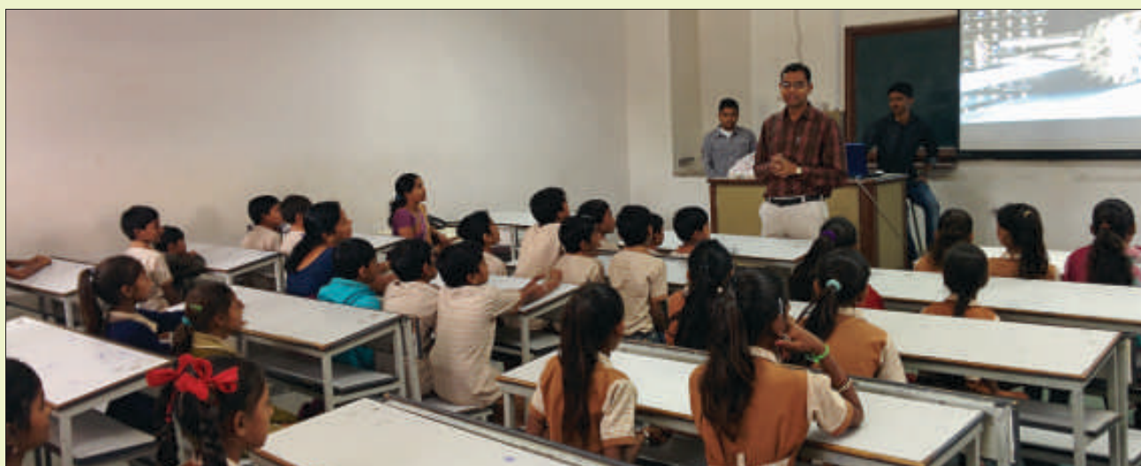
The Students of Chharodi Primary School at IT-NU for Robotics Awareness Programme

During the period of December 2013 to February 2014, students and faculty of IL-NU visited the clinic eleven times and counselled 114 clients and assisted six advocates to get free legal representation in dealing their respective cases through Gujarat State Legal Service Authority.