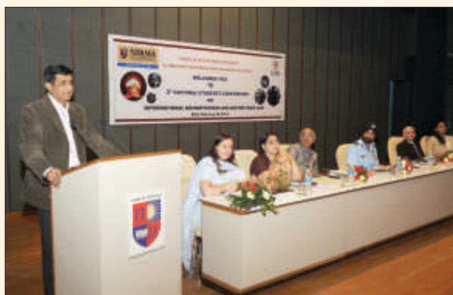
The Third National Students Conference at IL- NU