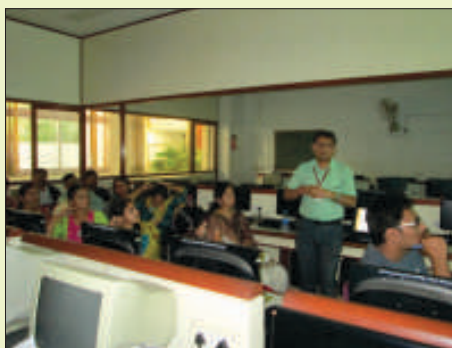
Hands on Experience of Computer Network Design