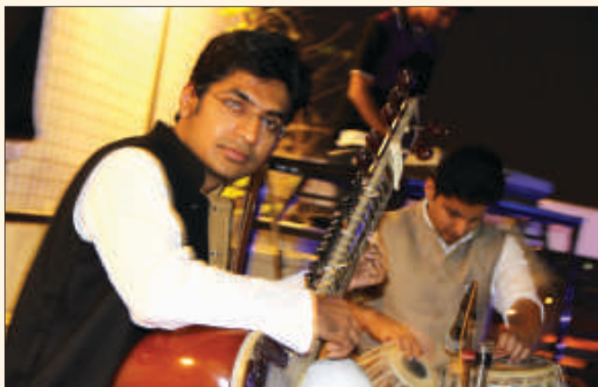
Students of IL-NU performing at Pentagram