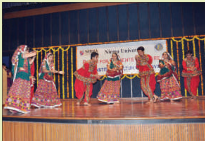
Glimpses of Inter Institute Cultural Fest at NU