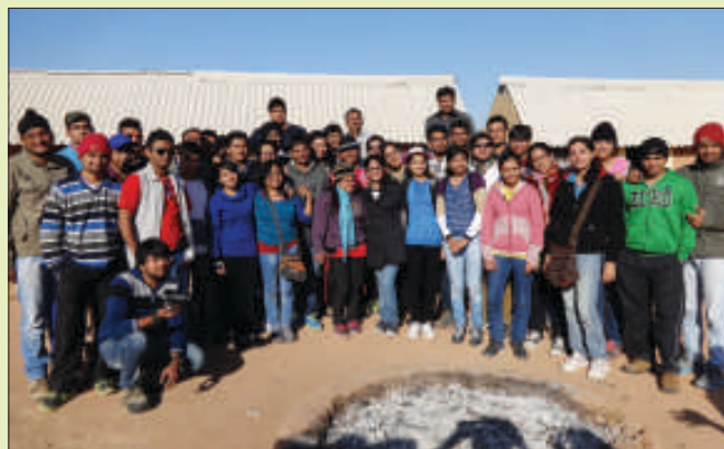
Students of NU during Desert Adventure Camp to Jaisalmer

Desert Adventure Camp to Jaisalmer was organized for the students of NU in two groups during January 17-20, 2014 and January 24-27 2014.