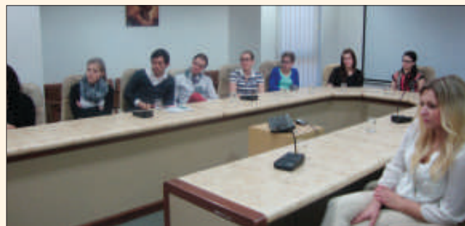
Faculty and students from HoF University of Applied Sciences, Germany at IM-NU