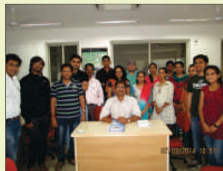
FDP on Performance Analysis of MIMO Wireless Communication