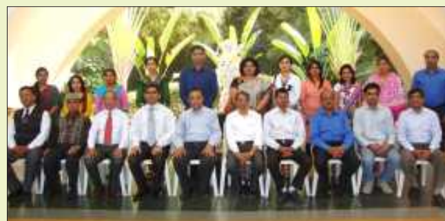
Case Teaching Workshop for Management Teachers