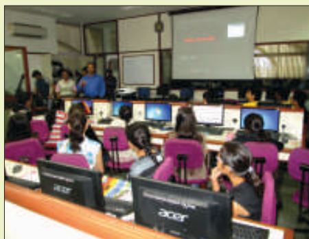
Mobile Application Development