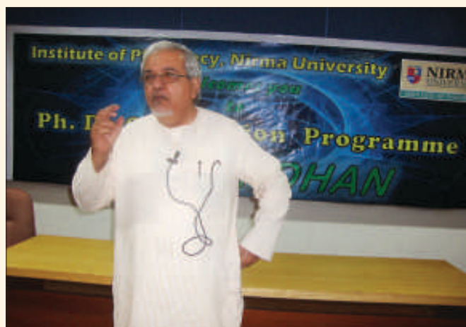
A glimpse of PhD Orientation Programme