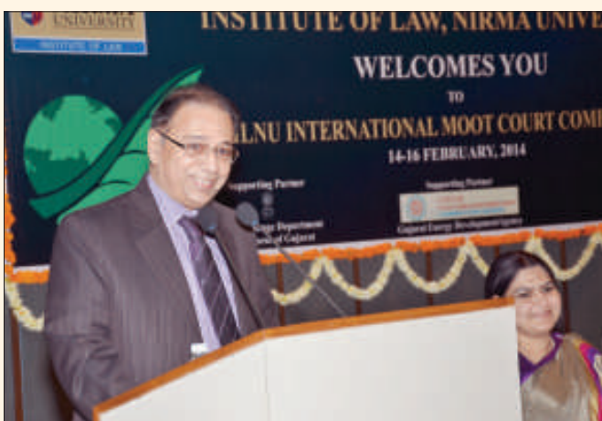
Hon'ble Mr. Justice K. S. Panicker Radhakrishnan, Judge Supreme Court of India at IL-NU on February 16, 2014