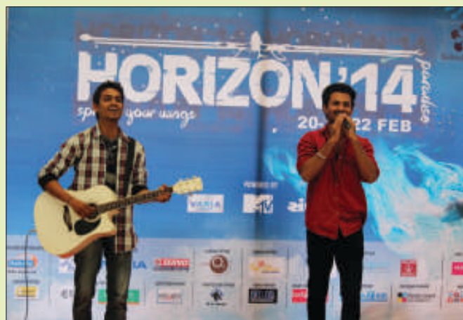
Horizon 2014 being celebrated with enthusiasm

RCNI of IT-NU organized Horizon 2014, a National Level Cultural Competition in the month of February 2014. About 55 inter collegiate competition such as literary, music, quizzes, debates, elocution, dramatics etc. were conducted. Approximately 3000 participants from more than 400 colleges participated in the cultural events.