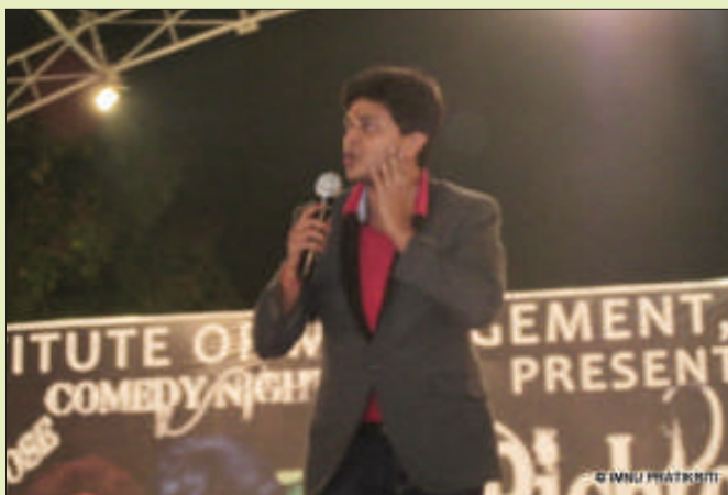
A student performing during Richter 10- The Annual Cultural Festival of IM-NU

The Annual Cultural Festival of IM-NU was held during December 6-8, 2013 which witnessed the extravaganza of Comedy Night, Cultural Night and Musical Night. Various events such as dance competitions, drama competitions, management games, etc were organized over the three days. More than 100 students from 14 B-schools across the country participated in the event.