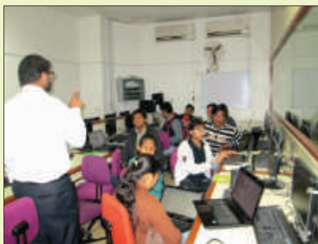
Ethical Hacking and Cyber Security Expert