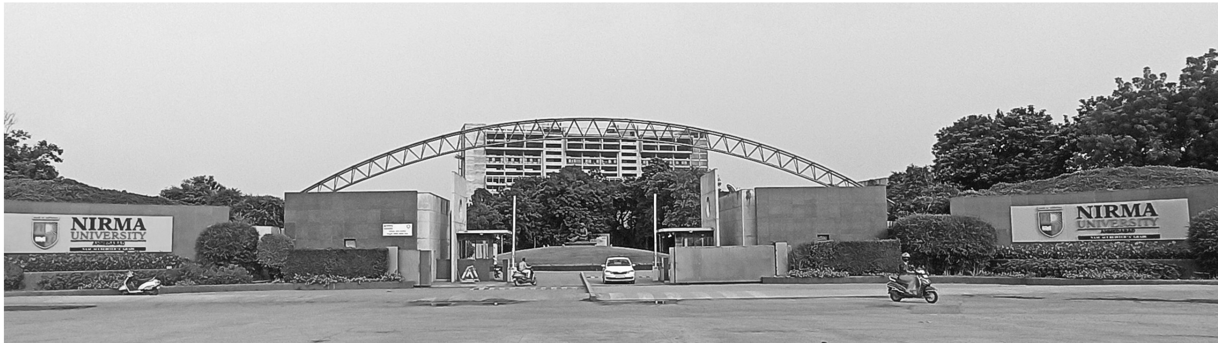
(Top) Nirma University front gate