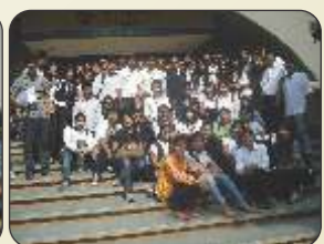
Resource persons with Semester VI students during Mediation Workshop