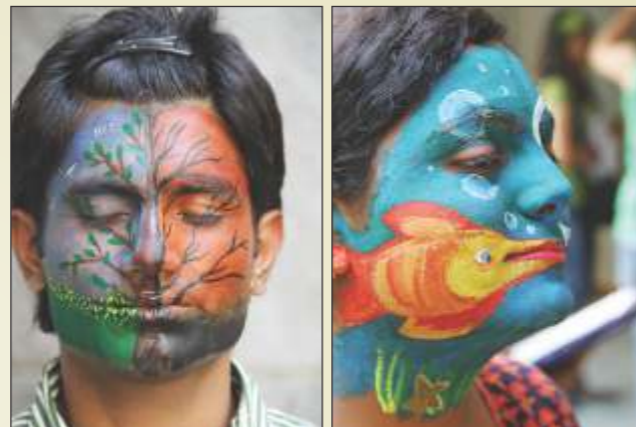
Face Painting Competition during the Earth Day Celebration