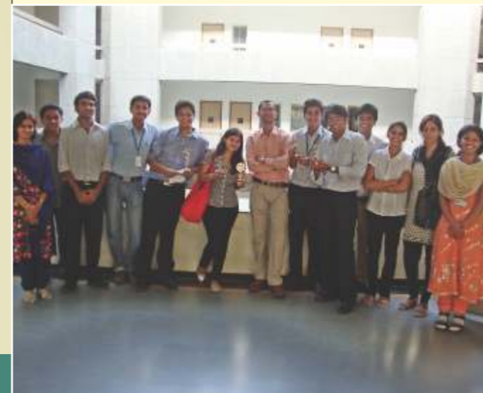
Winners of the Debate Competition with other participants and Faculties

The prizes were sponsored by Formica Groups.