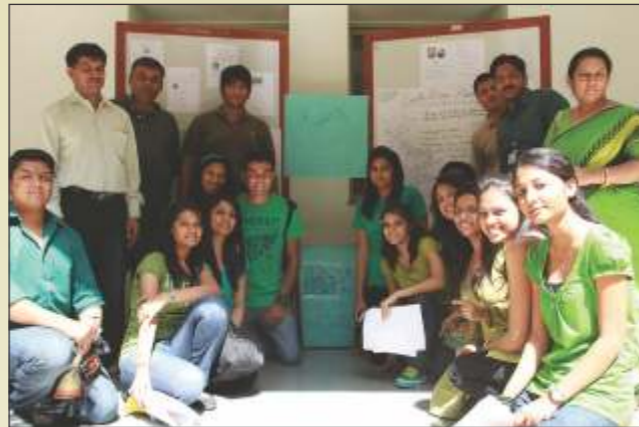
Faculties and students in Green on the Earth Day

The event started with a thought provoking discussion on the Naturalist Theory and its relevance in the present day context. Various events were undertaken to mark this Green day, and these included Collage Competition, Poster Making, T-Shirt Painting, Face Painting, Still Photography, Poetry, Model Making and Slogan Competition. The enthusiasm of the students was reflected in the turnout of the participants from the various semesters. Each exhibit of the event demonstrated how the Mother Earth had been degraded and how each and every one of us can perform our part and move towards a Cleaner, Greener Mother Earth.