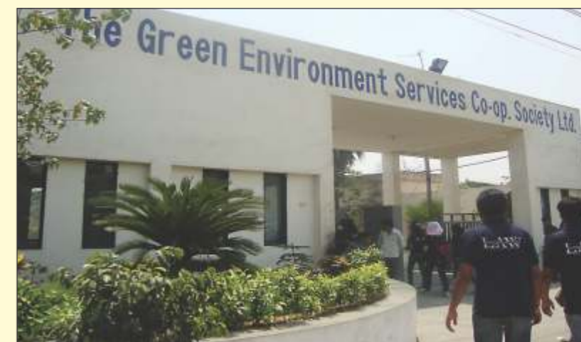
Students on the field visit