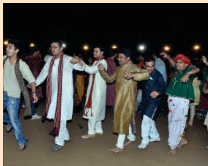
Faculties and Students participating in Ras Garba