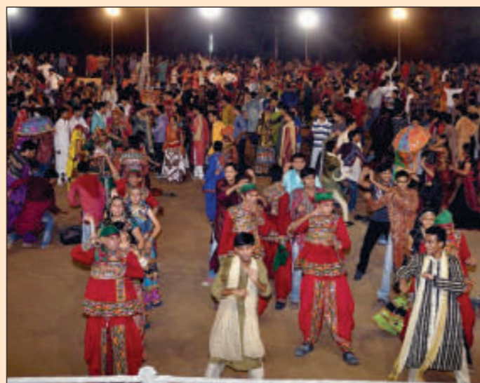
Students participated in Ras Garba enthusiastically.