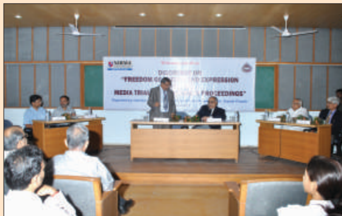
Panel Discussion on Freedom of Expression Vis-à-vis Media Trial and Contempt court Proceedings