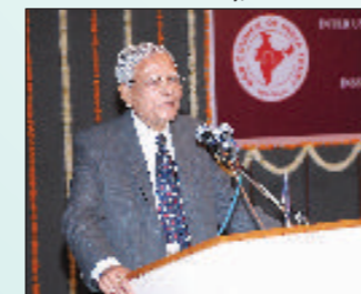
Hon'ble Justice Mr. M. B. Shah, Former Judge, Supreme Court of India, 19 th February, 2012