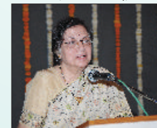
Hon'ble Mrs. Justice Sujata Manohar, Former Judge Supreme Court of India, 27 th January, 2012