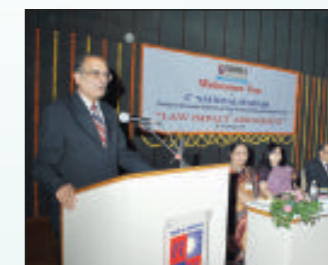
Hon'ble Mr. Justice C. K. Thakker, Former Judge Supreme Court of India, 27 th January, 2012