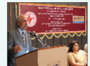
Hon'ble Justice Mr. B. N. Srikrishna, Former Judge, Supreme Court of India, 19 th February, 2012