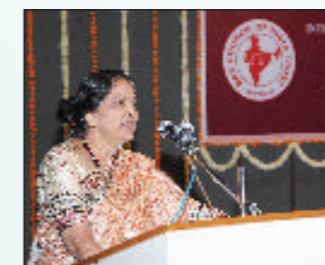
Hon'ble Ms. Justice Gyan Sudha Mishra, Judge Supreme Court of India, 19 th February, 2012