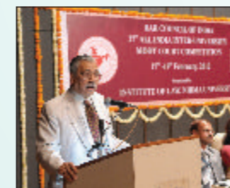
Hon'ble Mr. Justice A.M. Ahmadi, Former Chief Justice of India, 17 th February, 2012