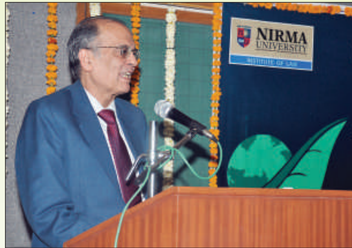
Hon'ble Mr. Justice, C. K. Thakkar, Judge (Retd.) Supreme Court of India, February 21, 2014, at ILNU.