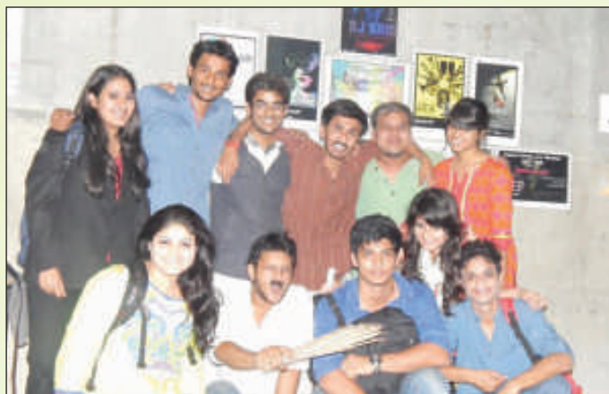
• Students' Drama Team won the first place in Drama Competition at PENTAGRAM, GNLU's Cultural festival, 27 February, 2014.