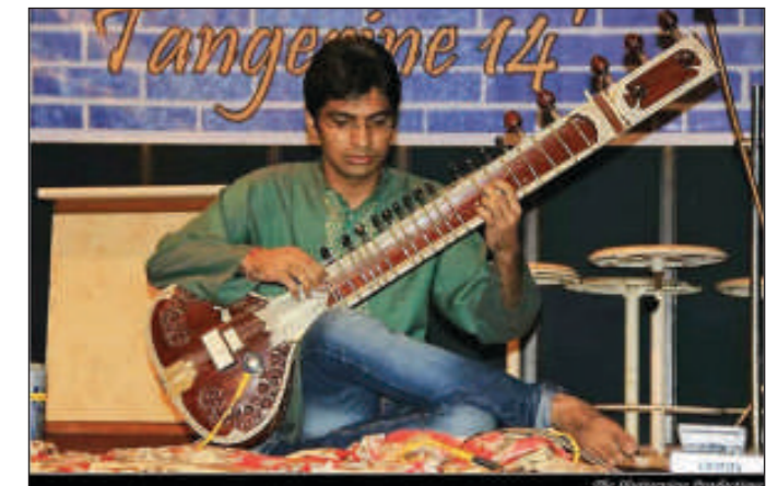
Tangerine- Musical Evening Performances