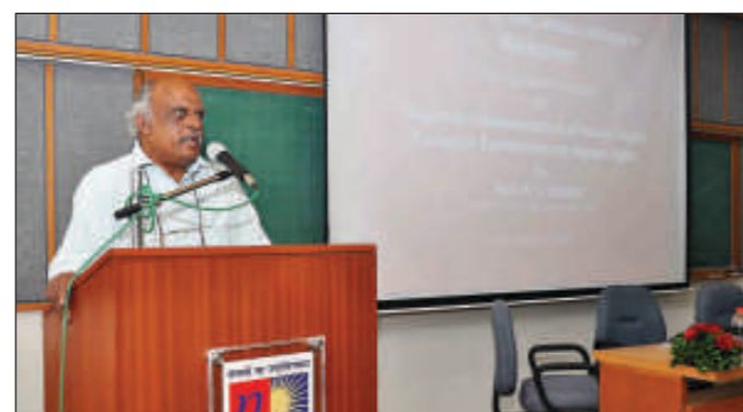
Prof N.S. Soman addressing students on European Commission of Human Rights