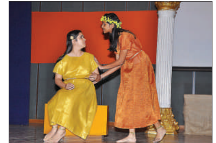
Classic Greek Play "Antigone" by Sophocles was staged by the 1st year students