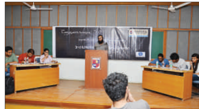
A Parliamentary Debate in session at ILNU during Connaissance 5.0