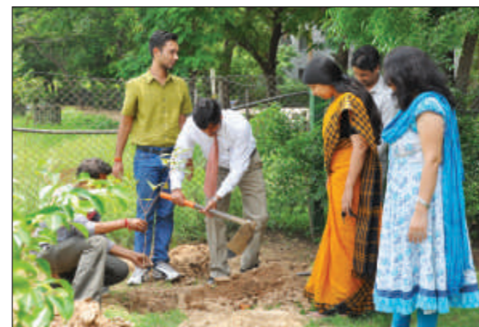
ILNU Faculty at the Tree Plantation Event organized by Centre for Environmental Law, ILNU

Other events were a performance of a play by Semester I students, a Tree Plantation Event organized by the Centre for Environmental Law, ILNU as well as a Blood Donation Camp organised by the Student Welfare Board, ILNU.