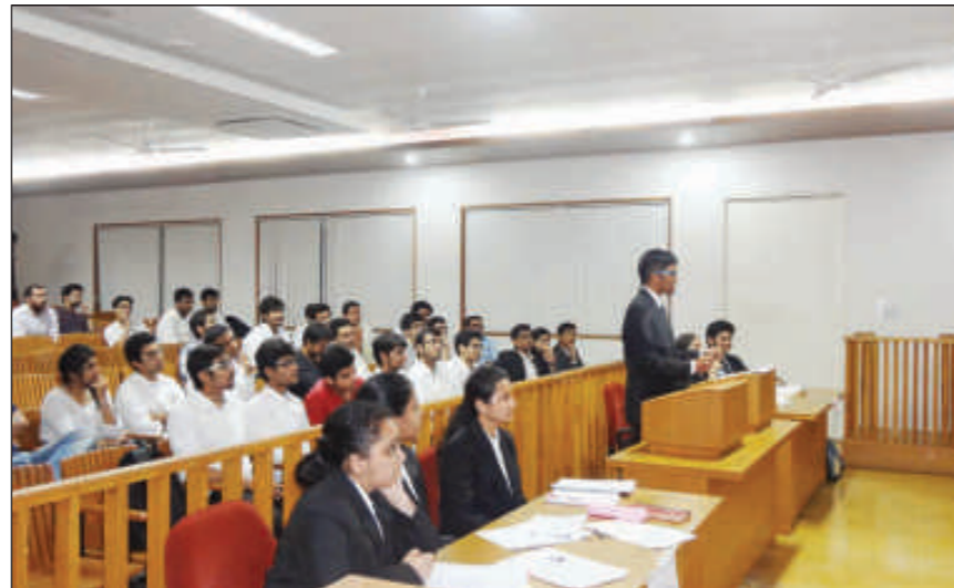
1 st Learner's Moot Court Competition for 1st Year Students