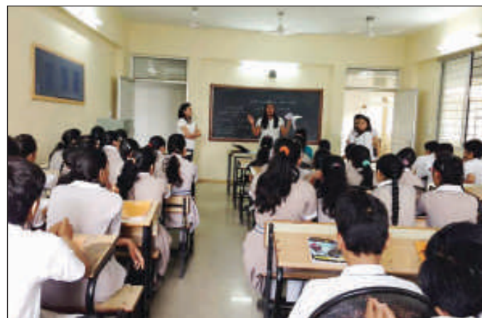
Gender Sensitization Workshop conducted by ILNU Students at various schools