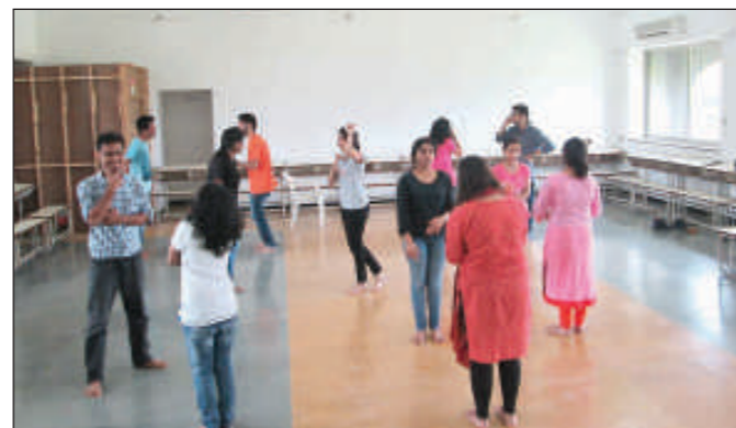
Dramatics Workshop in session at ILNU under CCE, Nirma University