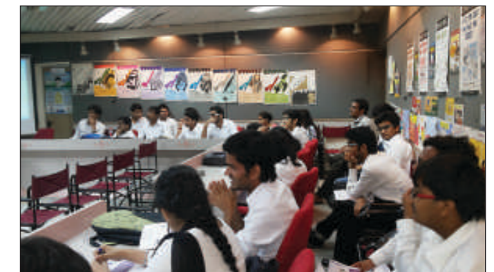
First Year Students at Consumer Education Research Centre, Ahmedabad