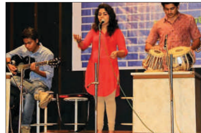
Tangerine- Musical Evening Performances