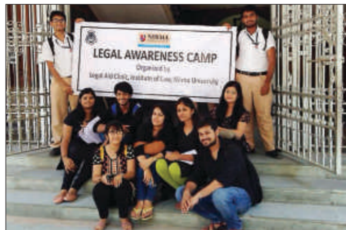
Legal Awareness Camps organized by ILNU students at various schools