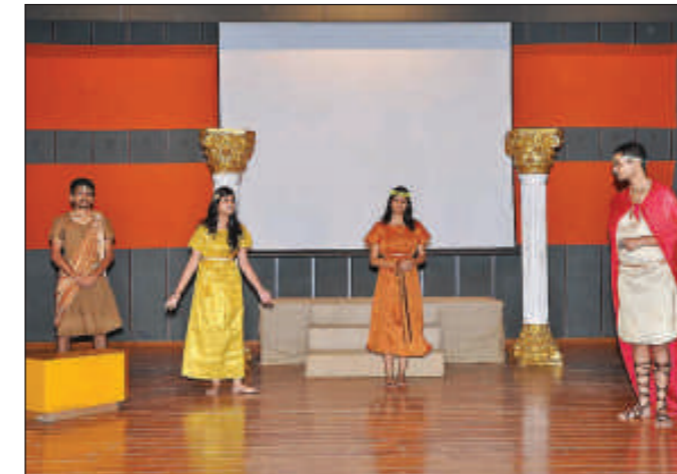
A scene from the play "Antigone"

The play depicted the true nature of a man and implores to adopt ethical principles that will help the students become socially responsible lawyers. It also helps the students grasp concepts taught in the classroom and also enhance analytical and rhetorical skills which are useful in decision-making.