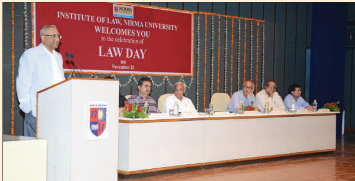
ILNU celebrating National Law Day

The Institute celebrated the 66th National Law Day on 26th November 2014. The occasion was embraced with the presence of Hon'ble Justice J. N. Bhatt, Chairman, Gujarat State Human Rights Commission, Former Chief Justice, Gujarat High Court and Patna High Court. Students of the Institute conducted various activities like skits, quiz during the day.