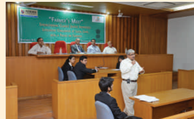
Farmers' Meet in session at the Climate Change Conference, ILNU

The conference had 3 technical sessions, 3 plenary sessions and a Farmers' Meet along with round table meet where theme paper of the Conference was deliberated upon.