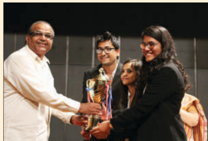
Students Felicitation function for Winning prestigious BCI and 2nd Vivekananda Moot Court Competition