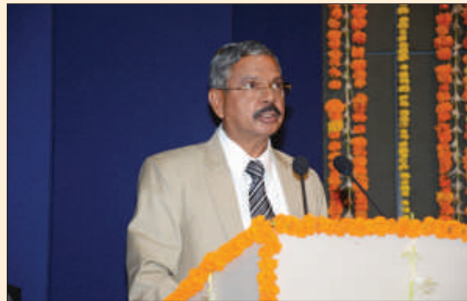
Hon'ble Chief Justice of India H.L.Dattu addressing the ILNU Conference

The Hon'ble Chief Justice of India, H.L Dattu, coming from agriculturist background, stated that Agriculture is an integral part of who we are as a society and as a nation. He emphasized that we should be convinced by scientific reasons than believe on empty rhetoric and called for accepting an approach which is sustainable enough to reduce the climatic pressure and also to safeguard the interest of small and marginalized farmers. Hon'ble Justice guided the government on its developmental schemes for land acquisition and ensuring adequate compensation to the farmers. This Conference was attended by more than 150 farmers from Gujarat and the surrounding States.