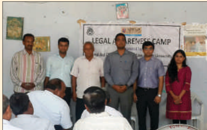
Legal Aid Committee, ILNU celebrates National Legal Literacy Day at Koba Village, Gandhinagar