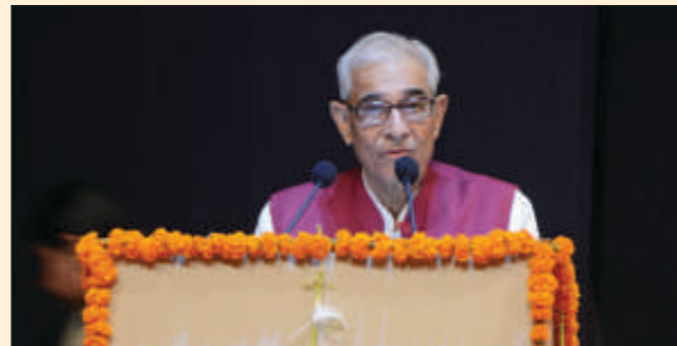
His Excellency the Governor of Gujarat, Shri Om Prakash Kohli's address at the ILNU Conference