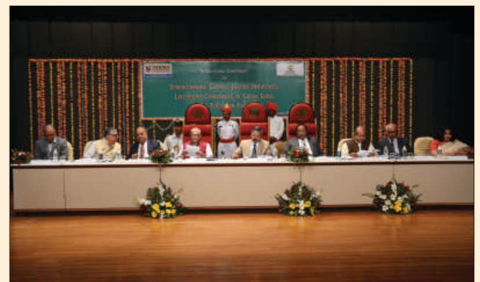
Dignitaries on the dais during the inaugural session

The Conference was inaugurated in the esteemed presence of the Hon'ble Chief Justice of India, Justice H. L. Dattu and the Governor of the State of Gujarat, His Excellency Shri. O P Kohli. The inaugural function was attended by various sitting and retired judges of Supreme Court and High Court along with other eminent dignitaries such as Justice V M Sahai, Hon'ble Acting Chief Justice of Gujarat High Court, and Justice B P Singh, Former Judge, Supreme Court of India & President of NCCSD, to name a few.