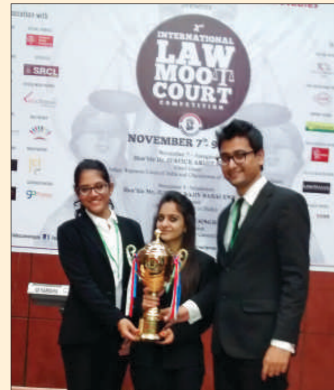
Students with Trophy of 2nd Vivekananda Institute of Professional Studies International Moot Court Competition, 2014