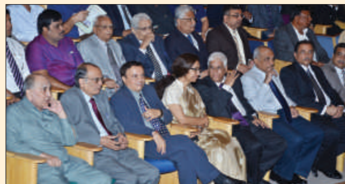
Distinguished Hon'ble Judges at Hon'ble Chief Justice of India's address during the International Conference on Strengthening Climate Justice Initiatives with a Focus on Farmers

His Excellency the Governor of Gujarat, Shri Om Prakash Kohli while addressing the gathering said that if we look at the modern world we can see that during the last few decades the world has made tremendous progress but this development has caused serious environmental damages impairing the quality of life not only of our generations but of future generations also .The concept of sustainable development was discussed in detail. A book on "Climate Smart Agriculture-The Indian Perspective" was also launched at the function which consisted experiences of several farmers and scientists.