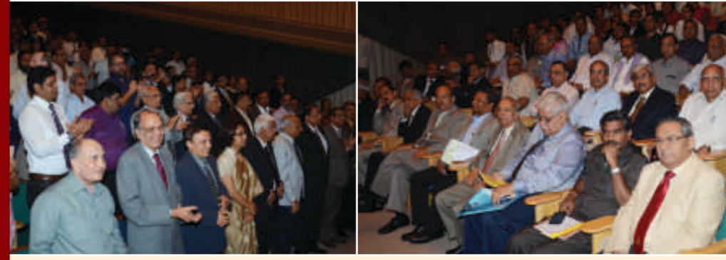
Dignitaries during Conference

The Conference was organized to initiate a dialogue on the theme and to critically analyze the contribution of government policies, legal framework, technology and other initiatives by academicians, students, lawmakers, farmers and other stakeholders with a view to bring Climate Justice against the challenges faced by farmers at local level.