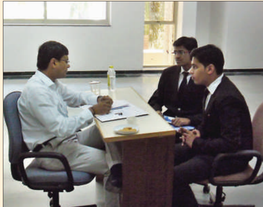
Centre for ADR, ILNU, conducted intra rounds for client counselling competition.