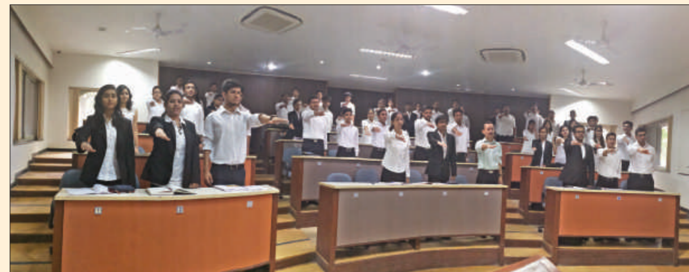
ILNU Students, Faculty and staff taking the Rashtriya Ekta Diwas Pledge to spread the message of unity, safety and security of the nation.

On October 31, 2014, the Institute celebrated the day to mark the birth anniversary of Sardar Vallabhbhai Patel. As a mark of honor for his contribution in unifying the nation, the Government of India decided to observe "Rashtriya Ekta Divas" (National Unity Day) to preserve the unity, safety and security of the nation. Institute of Law, Nirma University, in observance of this day, organized a few events in the campus. A Rashtriya Ekta Diwas pledge was administered by all the students, faculty and staff members. Everybody solemnly undertook to preserve the integrity, unity and security of the nation, with the same vision and action as that of Sardar Patel.