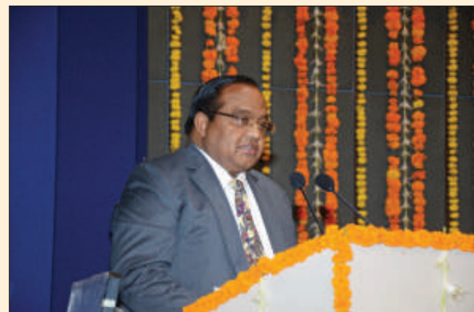
Hon'ble Acting Chief Justice of Gujarat High Court, Justice V.M.Sahai speaking at the conference.

The Hon'ble Chief Justice of India, H.L Dattu, coming from agriculturist background, stated that Agriculture is an integral part of who we are as a society and as a nation. He emphasized that we should be convinced by scientific reasons than believe on empty rhetoric and called for accepting an approach which is sustainable enough to reduce the climatic pressure and also to safeguard the interest of small and marginalized farmers. Hon'ble Justice guided the government on its developmental schemes for land acquisition and ensuring adequate compensation to the farmers. This Conference was attended by more than 150 farmers from Gujarat and the surrounding States.