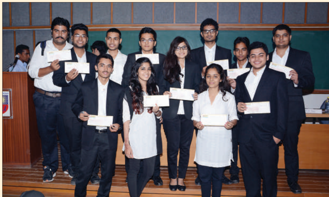
Students who received scholarship who are top rankers in CLAT 2014