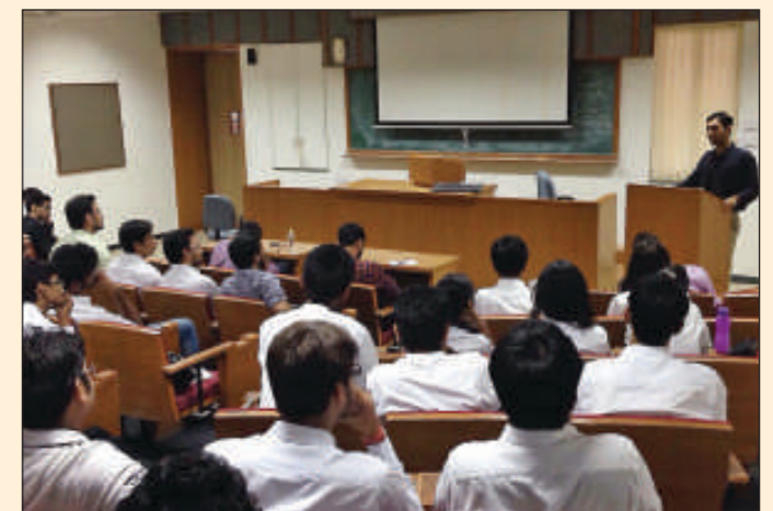
Department of Political Science, ILNU, organized symposium on occasion of Jawaharlal Nehru's 125th birth anniversary