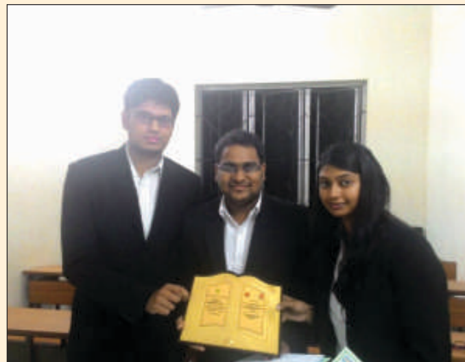
Students with the Trophy of Best Memorial Award at the 8th Pro Bono Enviro National Moot Court Competition, 2014

worthy as they secured the best memorial award among law schools from all across the country on an emerging subject.