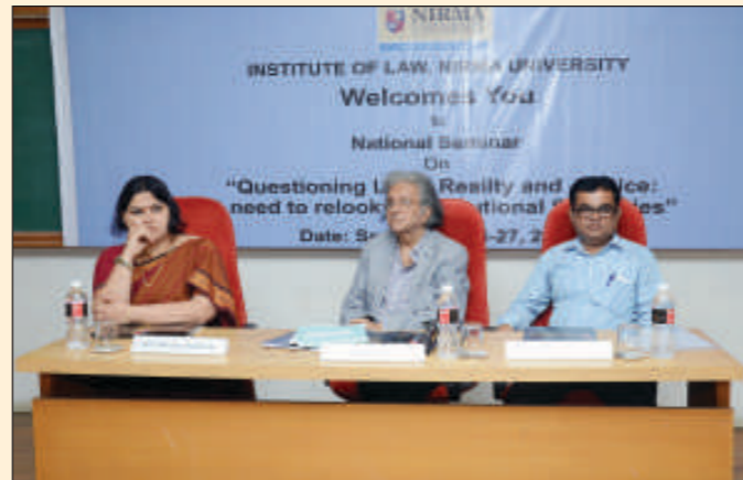
Dr. Upendra Baxi at the inaugural session of National Seminar

The major aim of the seminar was to interrogate and deliberate upon some very fundamental questions on the thinking and learning of law. Apart from providing a platform for an inter-disciplinary discussion on Law, the seminar also served as a medium to understand the apprehensions amongst social scientists regarding the theorizing of Law. Major questions of epistemological and ontological nature were also raised. The seminar was attended by esteemed scholars and academicians, including former Vice-Chancellors, Former Chief Justice of High Courts, Civil Rights Activists and Government Servants.