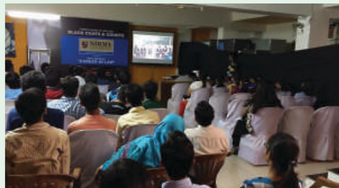
Seminar at Bhopal