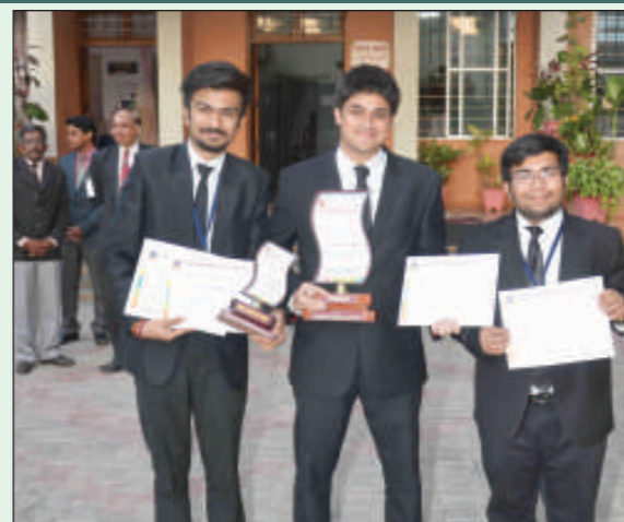
Winning team with 5th MK Nambyar MCC 15 trophy