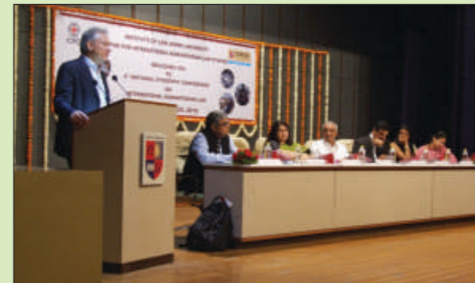
Prof. (Dr.) Vesselin Popovski at speech during the inaugural function of IHL Conference 2015

The objective of the Conference is to allow the budding lawyers and legal professionals to not only engage in understanding the legal and practical intricacies of International Humanitarian Law but also to explore the potential ways forward. The conference saw the participation of 46 participants from 13 universities across 8 states.