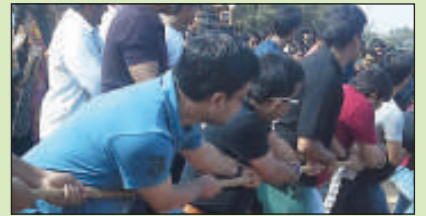
Tug of War by ILNU Faculty and rest of NU Staff members

ILNU has won Inter-Institute football Cup, 2015 by defeating Institute of Technology in the final match.