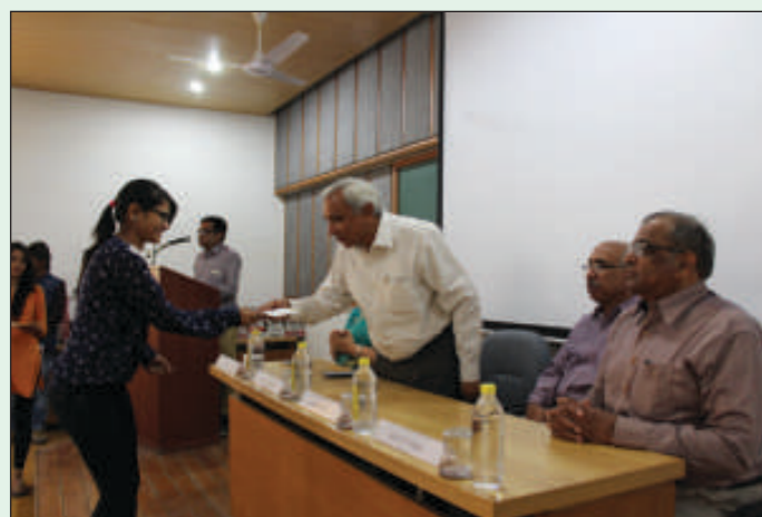
ILNU distributing Scholarship