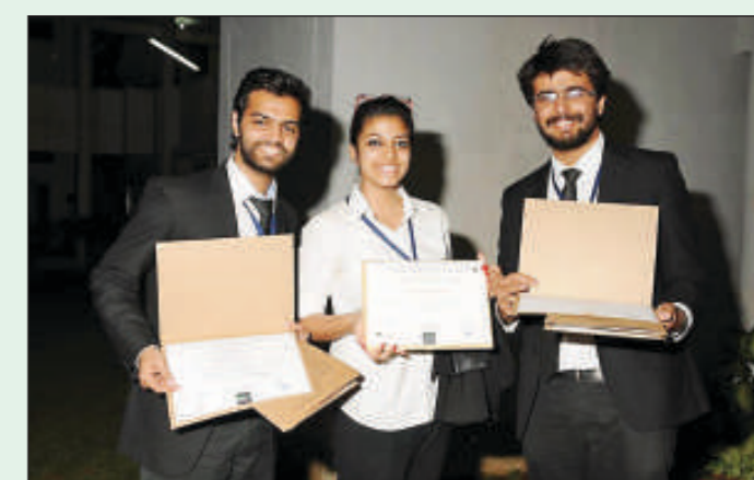
Students with Surana & Surana certificate.