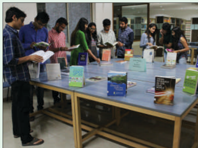
Faculty & students at Book Exhibition in ILNU Library

As a part of the activities initiated by Library Activity Committee of ILNU, a book exhibition on Research Methodology with the theme "Why Should I learn Research Methodology" has been organized on March 21st 2015. The exhibition included wide range of books and journals from all the libraries of Nirma University.