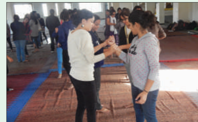
Students learning defense techniques during workshops

Institute of Law, Nirma University has organised a four day self-defence workshop from 13th January 2015 to 20th January 2015. The workshop was conducted with the help of Rushiraj Krate Kunfu Federation, Ahmedabad. Girl students from all the semesters participated in the workshop. The workshop was organised keeping in view the growing importance of physical fitness, exercise and self-defence in today's time. The workshop was planned and conducted by the experts of Martial Arts on the same lines and was divided into different sessions of physical exercises, defence techniques which can be used in times of need and inspirational videos. The response given by the students was satisfactory and the institute is also planning to conduct another workshop on similar lines for its Boy students.