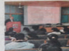
Ganesh N Devy talked on colonialism and crime

It was preceded by a lecture on 'colonialism and