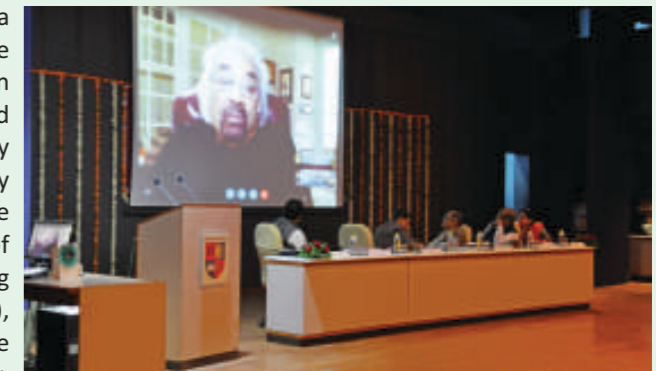
Mr. Sam Pitroda at speech through video conferencing during the inaugural function of National Seminar 2015.