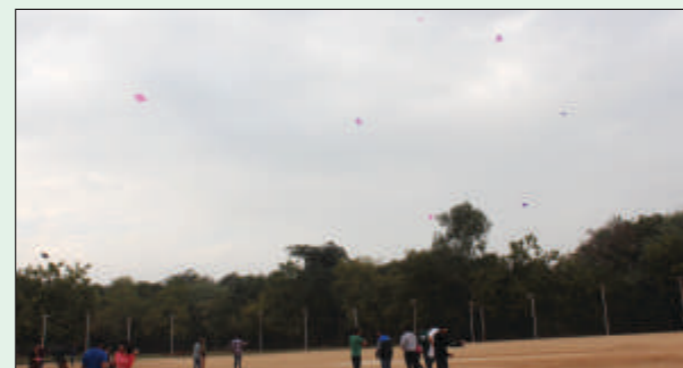
Students flying kites during Scintilla '15.

On 21st January 2015, Kite Festival, one of the most popular sports and festival in India and DJ were organized in the Dome Ground. A fun filled activity was conducted to promote the culture of Kite Flying in our College in which most of the students of our College participated. Gujarat being the home of International Kite Festival, so organizing it was aimed at bringing familiarity among students about this Festival. The symbolism of this festival is to show the awakening of the Gods from their deep sleep and the portals of heaven are thrown open!