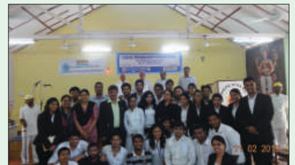
Students, faculty members university officials and prison authorities, along with the prisoners during the legal awareness programme at Sabarmati Jail