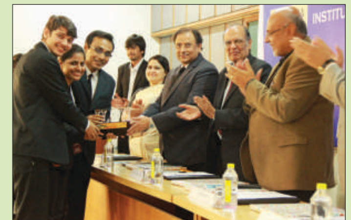
Champions team with the Winners' Trophy of 5th All India National Moot Court Competition 2015.