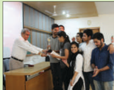
Students are felicitating during function.