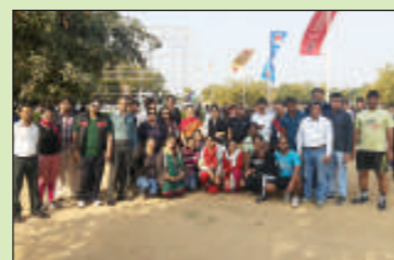
Students at Annual Sports meet 2015