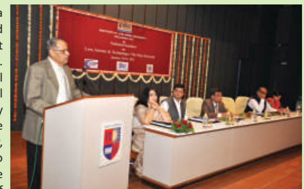
Prof. N. R. Madhava Menon at speech during the inaugural function of National Seminar 2015.