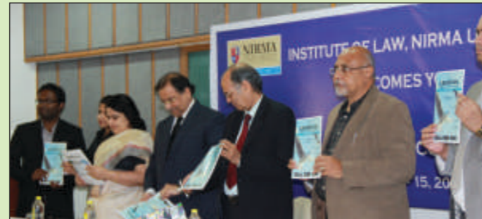
Launching ceremony of "Libertatem", the first world wide e-Magazine

The dignitaries appreciated the research and mootng skills of the prospective law students and advised to enter into this legal profession which is considered as noble profession. This day has also been special for the Institute as "Libertatem", the first worldwide e-Magazine was launched on this special occasion.