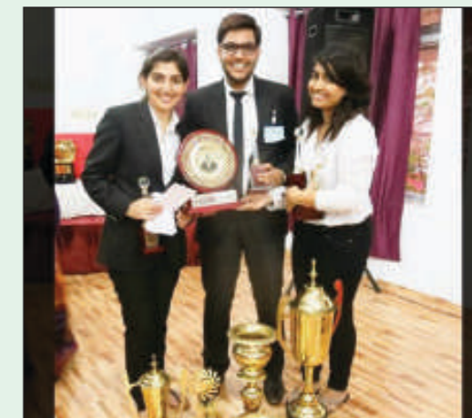
Students with trophies being Runners Up in 10th VR Krishna Iyer AIMCC