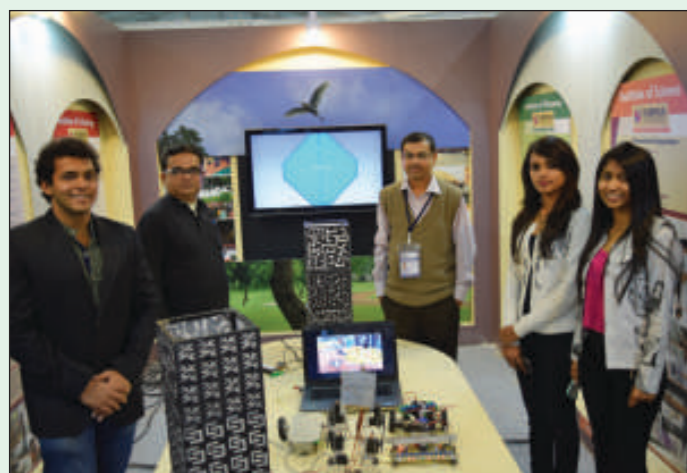
ILNU Faculty members and students at the Exhibition Hall