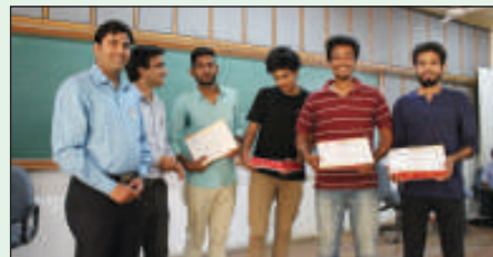
Students are felicitating during function

To appreciate the performances of the students who represented the Institute in various moot courts and debate competitions, the Institute felicitated the respective students on 13th February 2015 and congratulated them for their excelled performances.