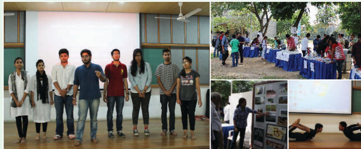
Enriching skills Exhibition