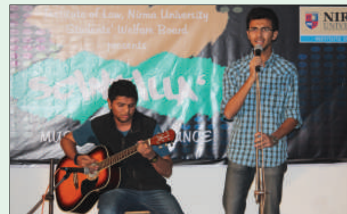
Students performance during Scintilla '15.