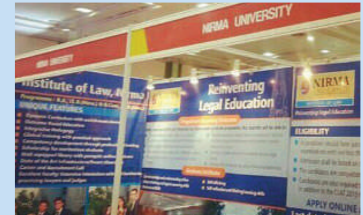
Educational Fair in Chennai and Ahmedabad.

As part of making awareness and importance of the Five-Year Integrated Law Degree Programme at the Institute of Law, Nirma University, the Institute participated in the Educational Fair in Chennai, Tamil Nadu on April 11-12, 2015 and in Ahmedabad on April 18-19, 2015. The Event was organized by the Times Education Boutique, A Times of India initiative.