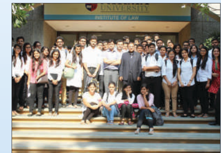
Participants of the workshop