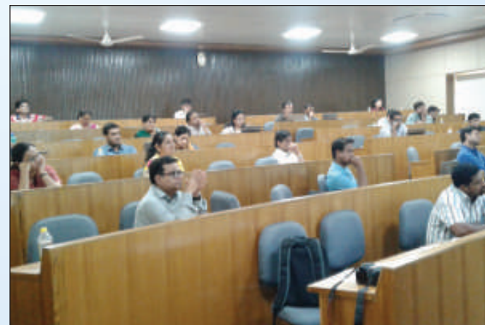
Faculty members attending Faculty Refresher programme 2015