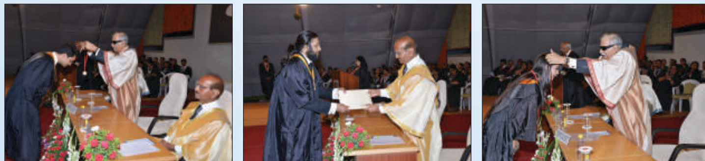
Students receiving degree/awards during the convocation