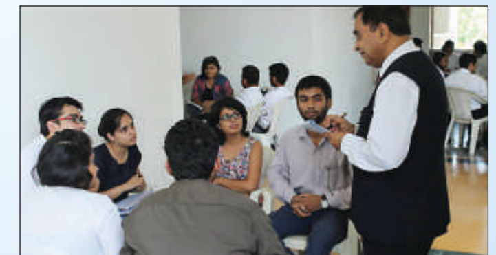
Trainer explaining the mediation role play