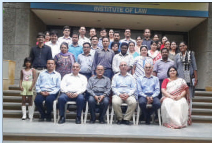
FRP participants with the Chief Guest and other dignitaries