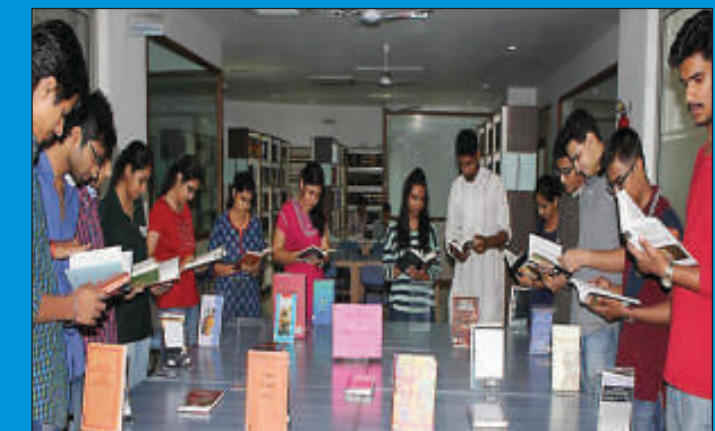
Book Display in the Library on April 4, 2015