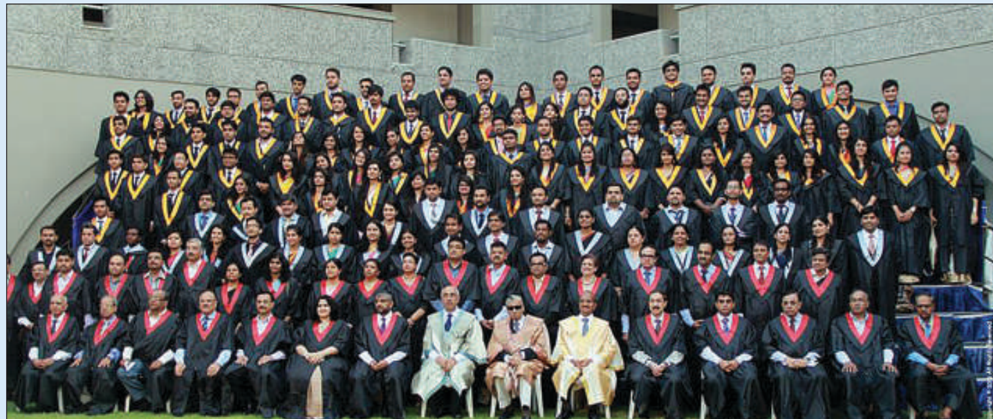
ILNU Batch 2010 with Chief Guest, President and other dignitaries