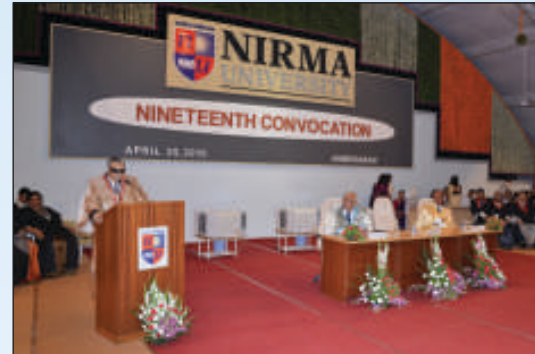
Hon'ble Mr. Justice Ahmadi delivering speech