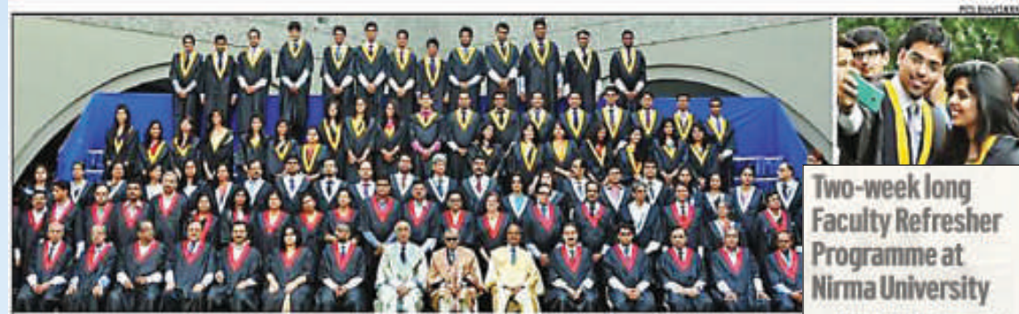
Two-week long Faculty Refresher Programme at Nirma University