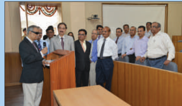
Hon'ble Mr. Justice A. M. Ahmadi during inauguration of Smart Classroom

The Smart Classroom built at the Institute is part of enhancing social learning of students and to promote mobile and blended learning. This smart classroom is not only for the benefit of students but also to facilitate virtual sessions which helps to manage competencies, learning parts and enables teacher to conduct online test. Hon'ble Mr. Justice A.M.Ahmadi, Former Chief Justice of India inaugurated the Smart Class room on April 25, 2015.