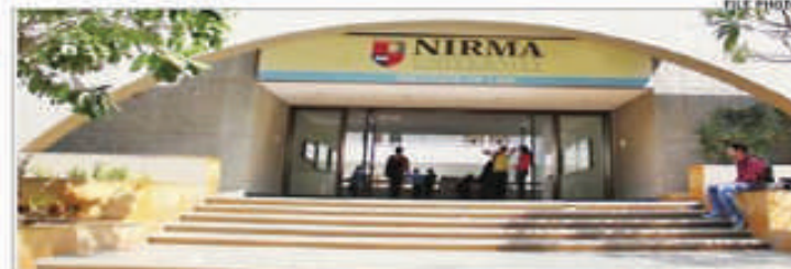
About 1,600 teaching and non-teaching staff will take part in the audit

Likely to complete in six months, the audit will have four stages that will include preparation, survey, focus group discussions and action plan. From class one to four, about 1,600 employees will be surveyed as part of the initiative. A questionnaire containing 94 questions will be cir-