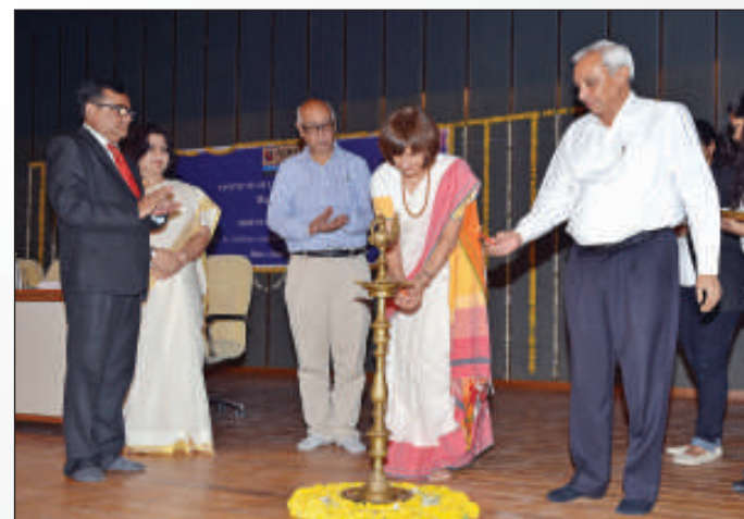
Inaugural function of Orientation Programme