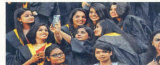
Graduating Nirma students gather memories

Around 500 were conferred degrees by Karsanbhai Patel, the founder of Nirma group and the president of the varsity. Of these, 18 students were felicitated with gold medals.