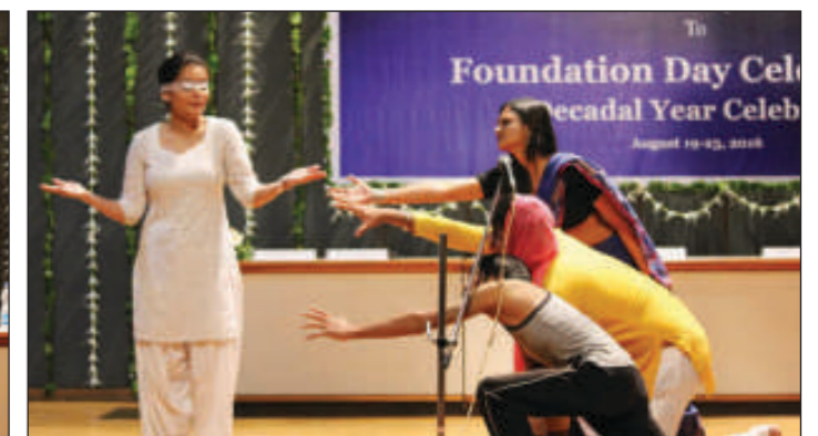
Students performs drama during the foundation day celebration