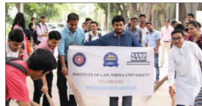
ILNU staff members and students cleaning the campus as part of Swachch Bharat Abhiyan

The rally started from the Institute of Law and went round covering the circumference of the University campus including various Institutes. The main motive of the rally was to create awareness about the need for clean surroundings and environment and to participate in "SHRAM DAN".