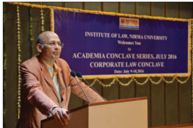
Dr. Abhishek Manu Singhvi addressing the audience