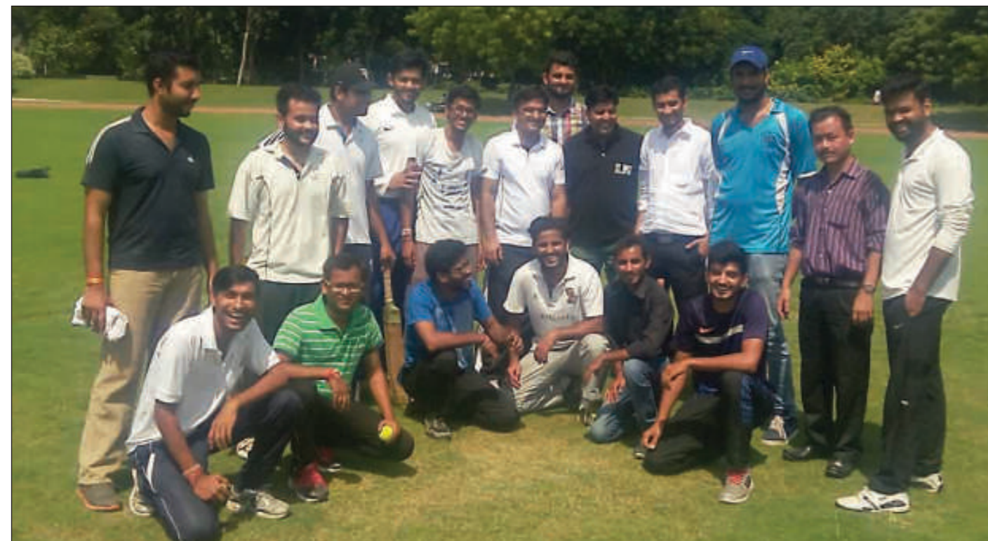
Faculty and Students during the Cricket Match