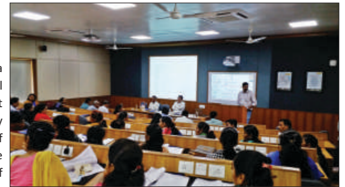
Experts and participants during the training programme

The Centre for Child Rights Advocacy, Institute of Law, Nirma University, in association with GSCPS, CCRP, UNICEF, Social Defence Department and Social Justice & Empowerment Department, Government of Gujarat, conducted a One-Day training programme on Effective Implementation of Prohibition of Child Marriage Act, 2006. The training was conducted for the Prohibition of Child Marriage Officers of the Government of Gujarat in the Institute on July 8, 2016.