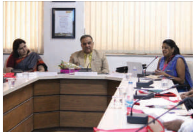
Experts and participants in the Teachers training programme on IHL3

Centre for International Humanitarian Law and Human Rights Law in collaboration with the International Committee of the Red Cross (ICRC) organized a three day teachers training programme on International Humanitarian Law from August 30 to September 1, 2016. The training programme was intended for law teachers who are engaged in teaching law in all LL.B. programmes and LL.M. international law programmes, human rights, humanitarian law and refugee law in law Colleges, law faculty/departments of the universities and law schools of the Gujarat Region. The programme saw the participation of 20 Law Professors from across Gujarat. The training programme was inaugurated by Hon'ble Justice Bhagwati Prasad, Chairperson, State Human Rights Commission, Gujarat and the training sessions were headed by Dr. Anuradha Saibaba, Legal Advisor and Dr. Sunod M. Jacob, Legal Advisor ICRC, Regional Delegation, Delhi.