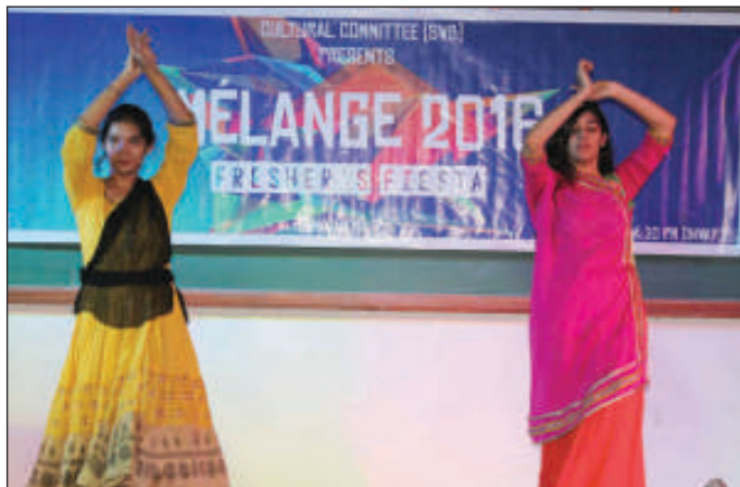
Students Performance in Melange 2016