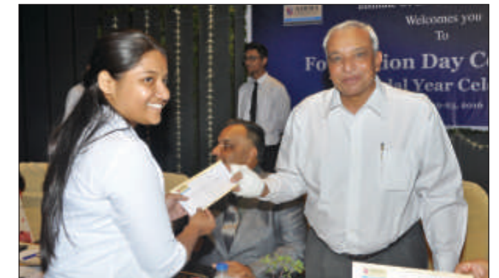
Students receiving the Scholarship