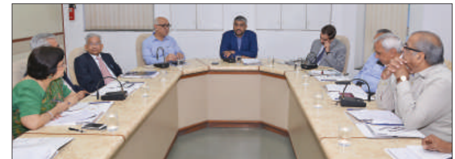
Advisory Council meeting