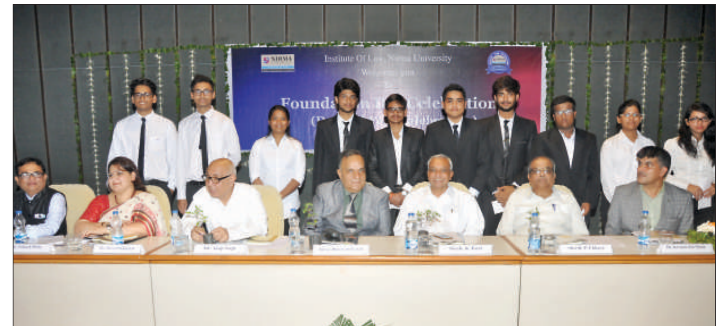
Scholarship students with the dignitaries on dais