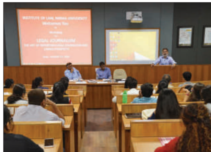
Invited speakers on dais during the workshop