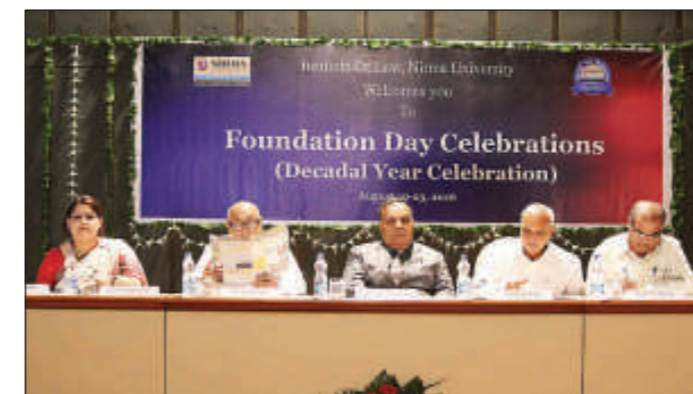
Dignitaries on dais during the foundation day celebration

On this occasion, scholarships were distributed to the top 10 students admitted in 2016 on the basis of their merit in CLAT 2016.