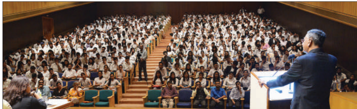
Audience at the Constitutional Law Conclave