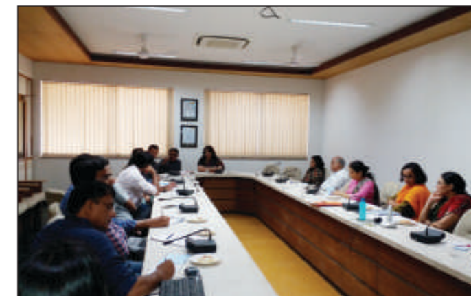
Faculty members interacting with the parents during PTM meeting

As part of course on course of NGO & Entrepreneurial Lab and Environment Law, the students of Semester VII visited Pharma Sez, Sarkhej-Bavla Highway, Matoda, Ta. Sanand, Dist: Ahmedabad on 06/09/2016 for observing public hearing conducted by Gujarat Pollution Control Board and interaction with women representatives of Sanand Mahila Vikas Sangathan, NGO, Sanand. The field visit was carried out with the help of Parayavaran Mitra, NGO, Thaltej