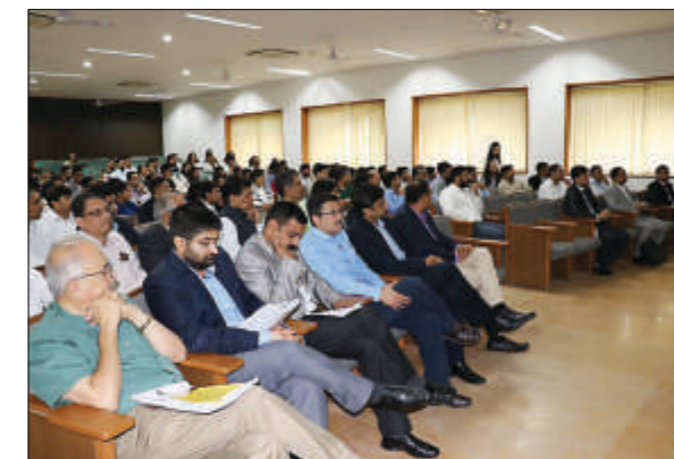
Participants during the Conference