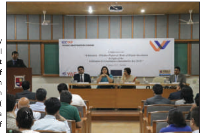
Inaugural session of One Day Conference on Arbitration as a preferred mode of Dispute Resolution