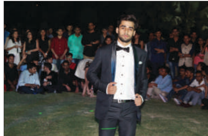
Students performs at Freshers Party