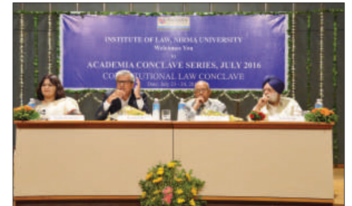
Dignitaries on dais during the conclave