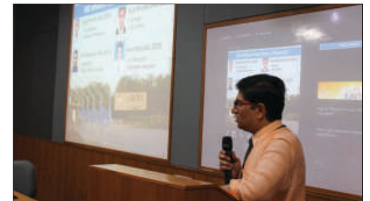
UPSC awareness programme in progress