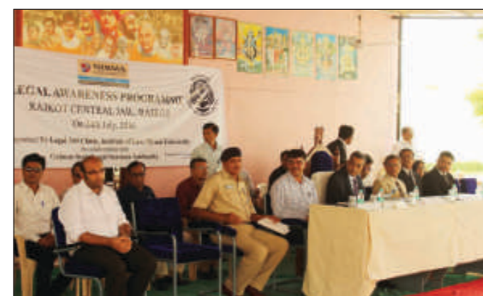
Dignitaries of dais during the legal awareness programme camp at Rajkot Central Jail.