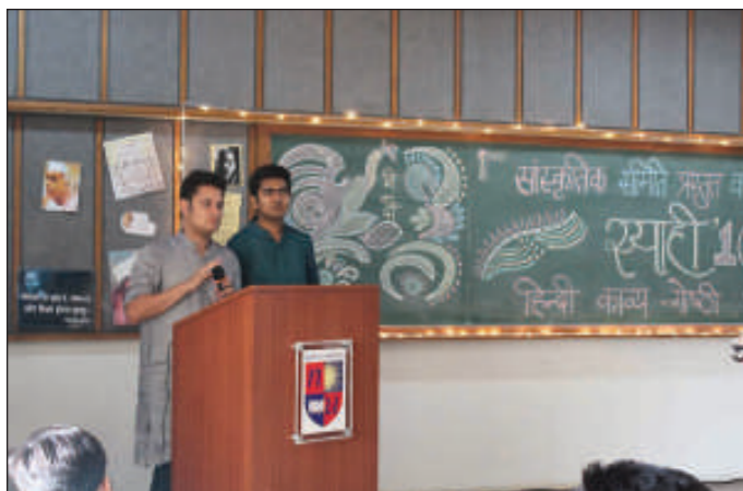
Celebration of Hindi Diwas

The Institute celebrated Hindi Diwas, 'Syahi' on 14th September 2016 where students were dressed in ethnic wear depicting their traditional values. The students showcased their poetry skills and dance performances on this occasion.