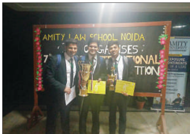
Students with winning trophy

Amity University, Noida from 26th to 28th October, 2017. The team also bagged the award for Best Memorial at the competition and made ILNU proud.