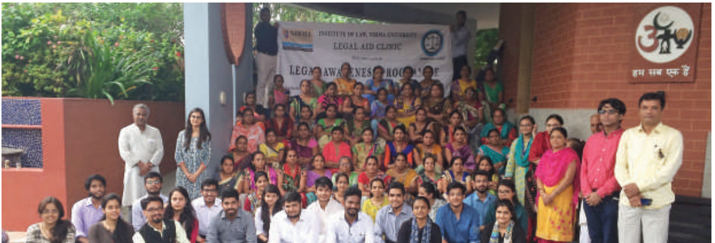
Legal Aid Camp at Village Lilapur