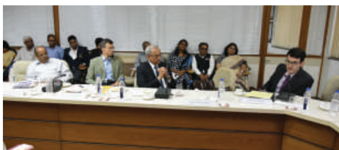
Experts at the Round Table Conference during the NCJE 17