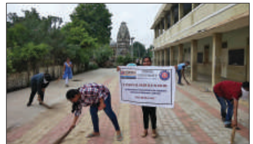
NSS Swachchhata Pakhwara at Jamiyatpura