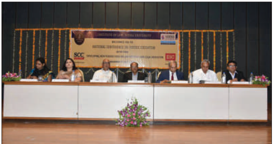
Dignitaries on the dais during the inaugural function.