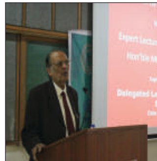
Hon'ble Justice C. K. Thakker