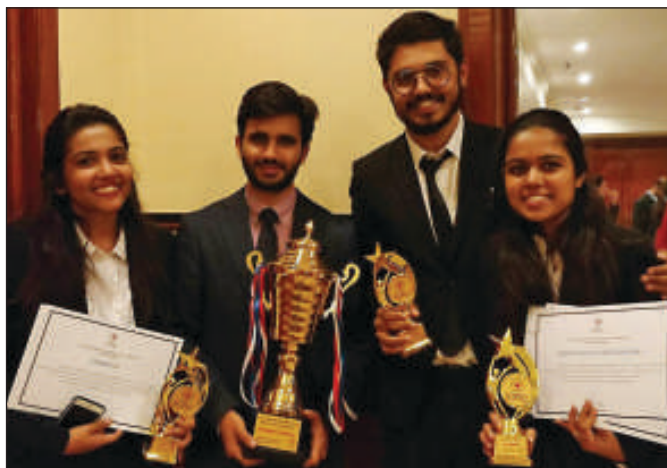
Students with winning trophy