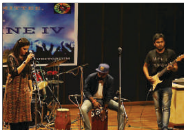
Students perform during Tangerine

ILNU hosted Patriotic Song Competition in association with Rotaract Club of Nirma Institutes (RCNI) on 11th August 2017, Friday. Theme of this competition is 'Deshraag'. Faculty/Staff members and Students participated from all institutes under Nirma University. Winners and Runner-Ups were awarded Trophy and Certificate in both categories.