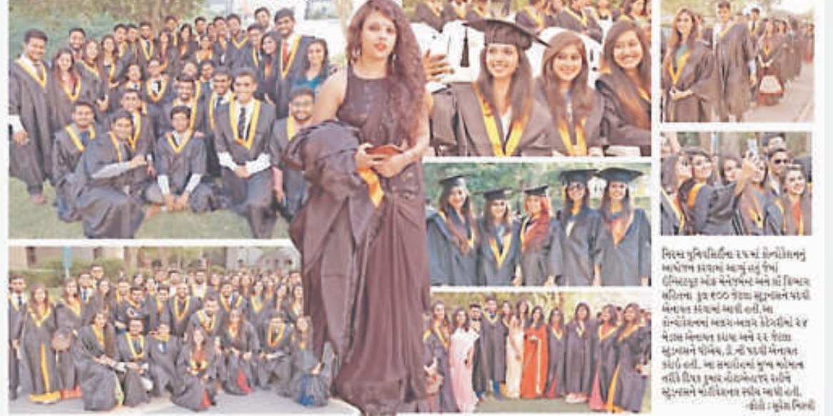
નિરમા યુનિવર્સિટીનાં ૨૫મા કોન્વોકેશનનું આયોજન કરવામાં આવ્યું હતું જેમાં ઈન્સ્ટિટ્યુટ ઓફ પોલિમર ટેકનોલોજી અને ઈન્સ્ટિટ્યુટ ઓફ ઈન્ફોર્મેશન ટેકનોલોજીનાં સ્ટુડન્ટ્સે ૭ દિવસીય નેશનલ સર્વિસ સેક્ટર (NSS) કેમ્પનું આયોજન કરવામાં આવ્યું હતું. આ કેમ્પમાં સ્ટુડન્ટ્સે સ્વયંસેવાકાર્યોમાં અભિયાન અંતર્ગત ટોર્ચ લેટ કોલેનિંગ, સોલ કોલેનિંગ, સેનિટાઇઝેશન, કચરા કચરા પરીચાલનાં કાર્યોમાં સ્વયંસેવા અભિયાનમાં સક્રિય રૂલમાં રહ્યા.