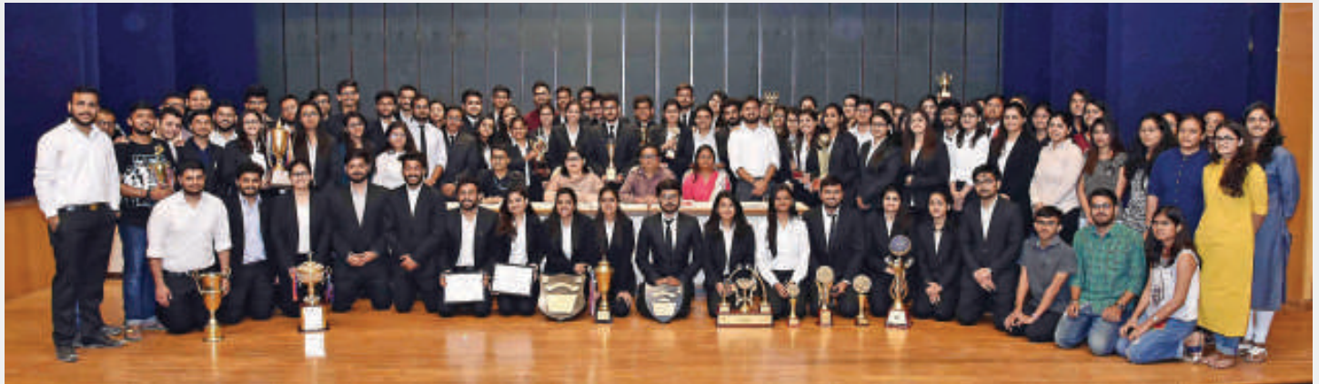
Students with the Director and Faculty Moot Coordinators

The Institute organized a grand moot felicitation ceremony on April 4, 2018 to commemorate the winning and successful participation of students representing the Institute in various moot court competitions/mock events. In the ceremony, the Director congratulated all the winners/participants for their achievements in the event.