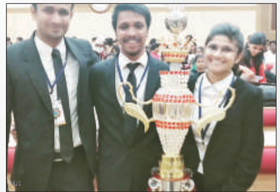
Team with Nani Palkhiwala Trophy