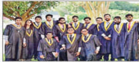
604 students were conferred degrees by the viceroy

Talking to students on a technologically enabled world, Hota said, "While the world is getting more and more technologically connected, many of us seem to be feeling more mentally disconnected from others and from ourselves. The ubiquity of always connected mobile devices is leading to societal exhaustion. If you look around, people walking around on the street, people at