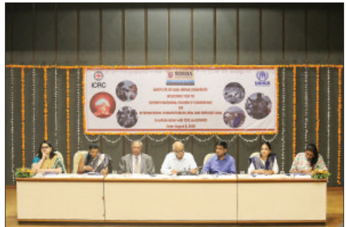
Dignitaries on the dais during IHL Conference