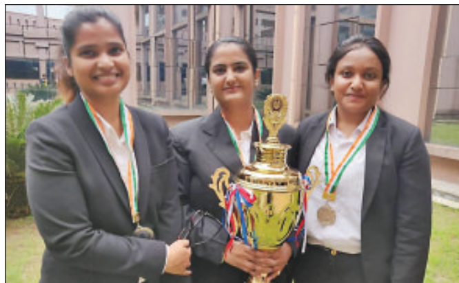
Students with RGSiPL trophy