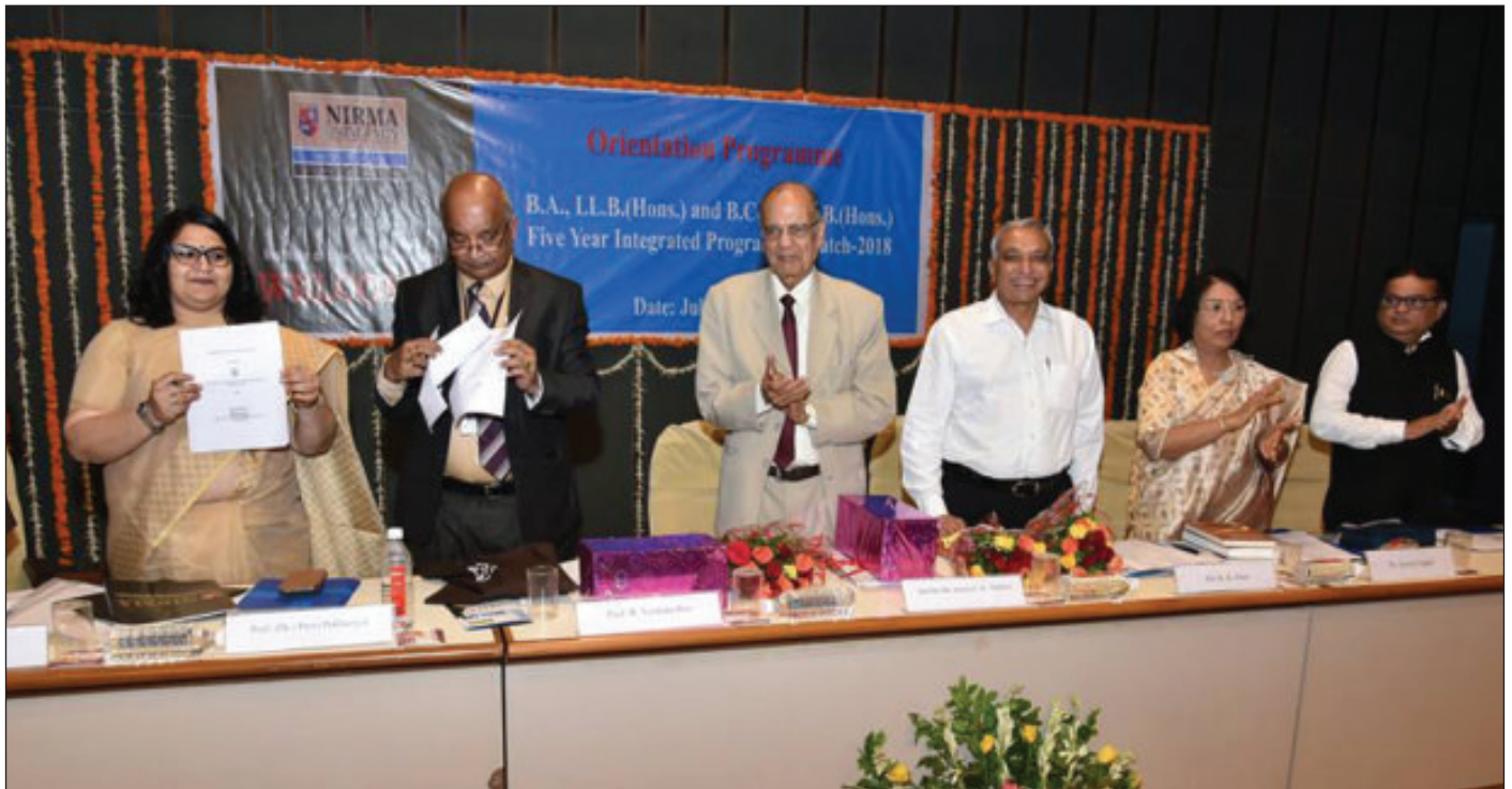
MoU with NLSIU

A Memorandum of Understanding was signed between National Law School of India University (NLSIU), Bangalore and Institute of Law, Nirma University on 12 th July, 2018. The MoU will encompass exchange of students and members of faculty as well as other academic activities- research and publications. They will also develop joint training and research Programmes in a collaborative spirit.