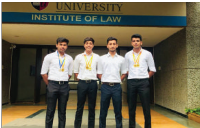
Victorious NCC Cadets with medal