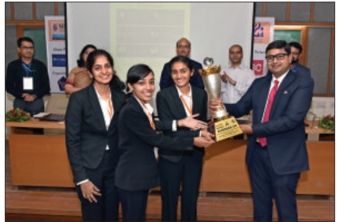
ILNU 2018 Moot Court