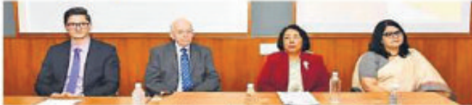
નિરમા ઇન્સ્ટિટ્યુટ ઓફ લોમાં 'ઇન્ટરનેશનલ કોમર્સ આર્બિટ્રેશન: કન્વેન્શનલ' ઉપર પર-સ્ટાફ સિલ્વલો વર્કશોપનું આયોજન.