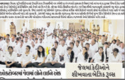
ગોકરોળમાં જેલમાં લોને લઈને ટોક જેલમાં કેદીઓને શીખવાતા એલિક ગુલ્શ

નિરમા યુનિ.ની કોલેજના 70 વિદ્યાર્થીઓની ટીમનું લીગલ એઈડ કમિશન