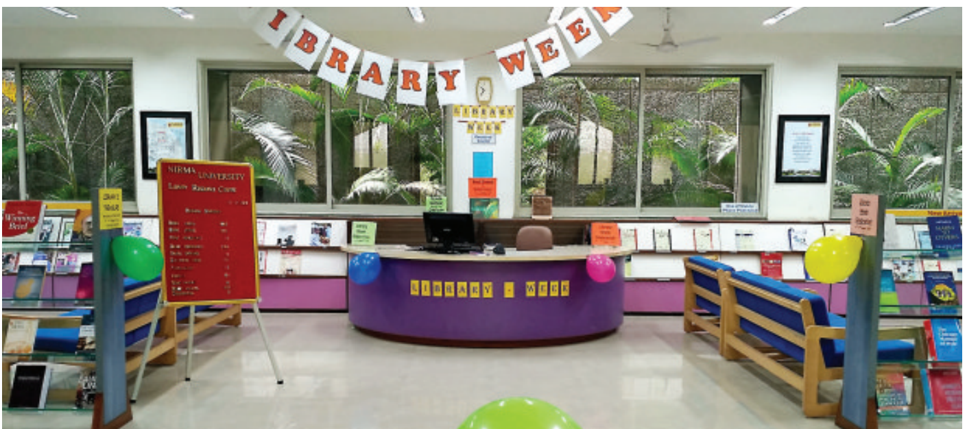
ILNU Library week celebration