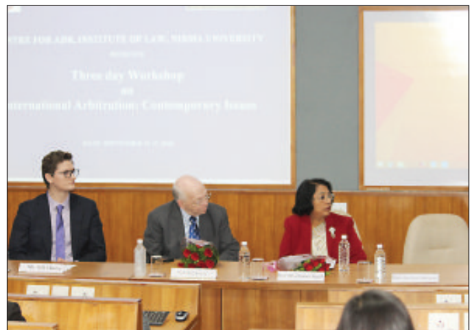
Dignitaries on dais during Arbitration workshop