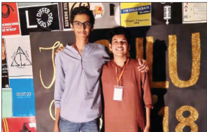
GNLU Debate winners with trophy