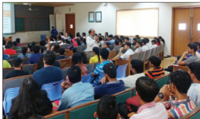
NSS Orientation to First Year Students

On 22/09/2018, NSS team of ILNU had visited the Jaimpura Village to analyse what the NSS ILNU team can do for betterment of Villagers. The team had visited the village hospital, Aanganwadi program and the School of village. The team also met with the employee of the Viillage Panchayat so that NSS, ILNU can understand their policy and give support to their programme. This visit was fruitful to make a plan for future assignment of NSS, ILNU.