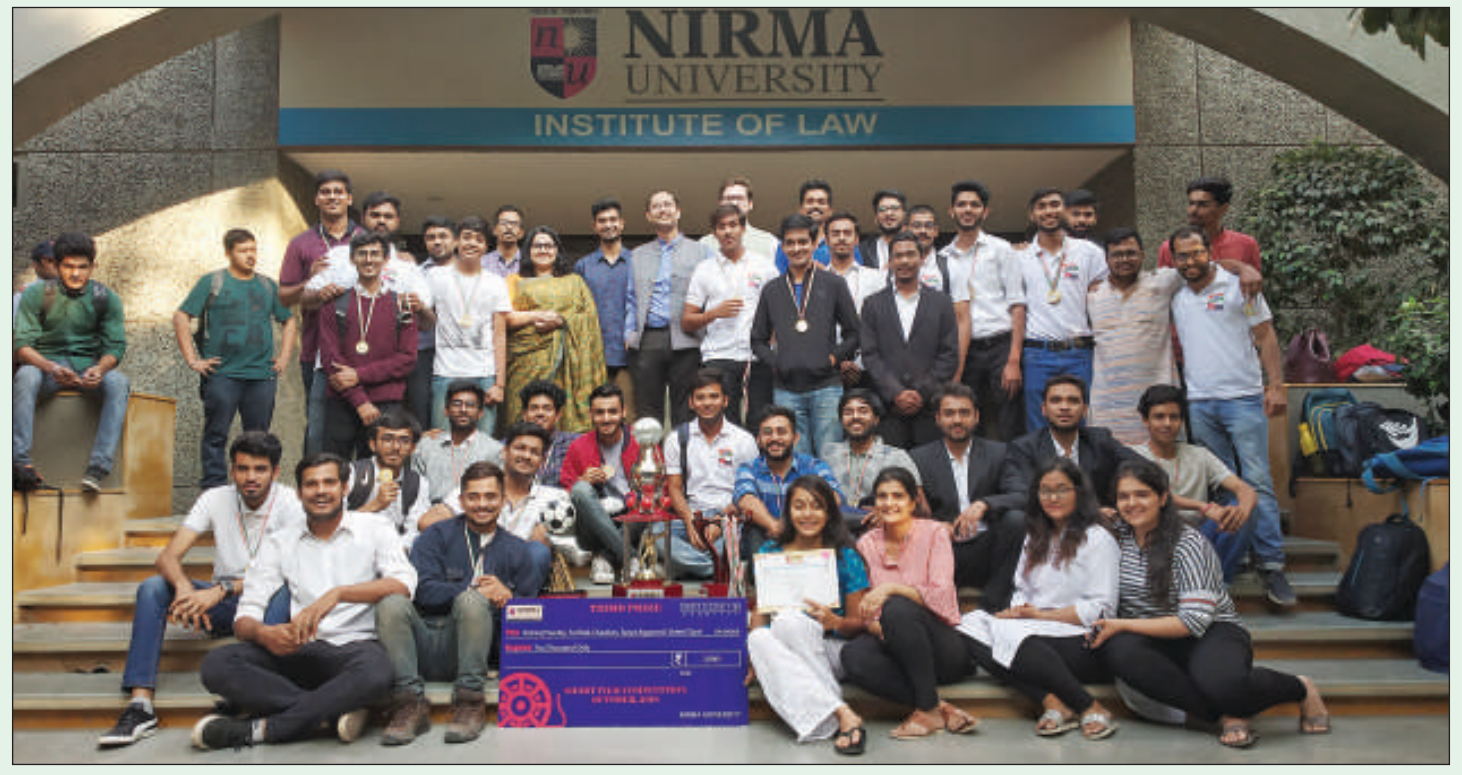
ILNU sports achievers