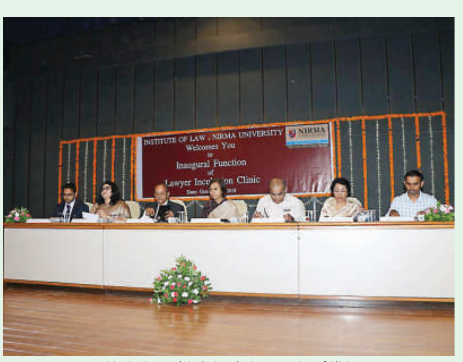
Dignitaries on dais during the inauguration of Clinic