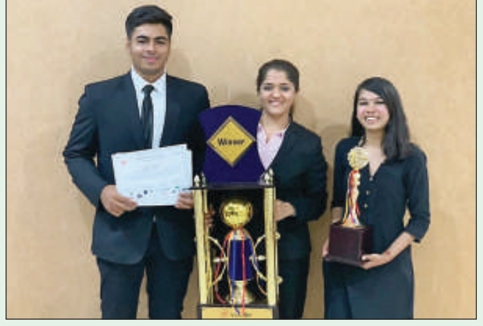
NLIU-INADR Moot Winning team with trophy

2018 in Pravin Gandhi College of Law, Mumbai.