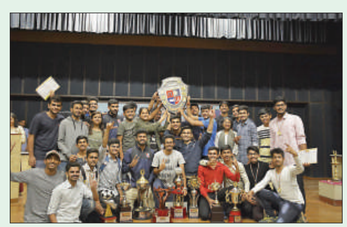
Student achievers in Extra Curricular activities