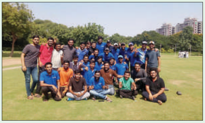
ILNU Cricket Team

The Cricket Team of the Institute won the Inter Institute Cricket Tournament, 2018, organized by Nirma University. The team of ILNU defeated the defending champions Institute of Technology, Nirma University, in the finals to clinch the victory.