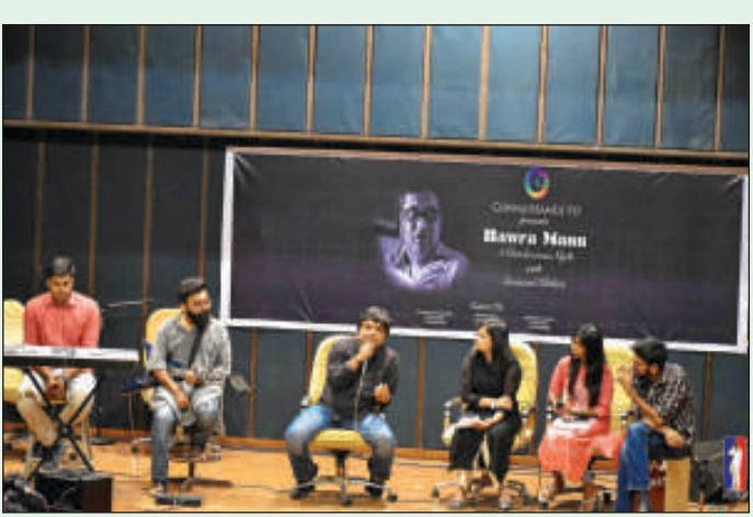
Performance by Swanand Kirkire