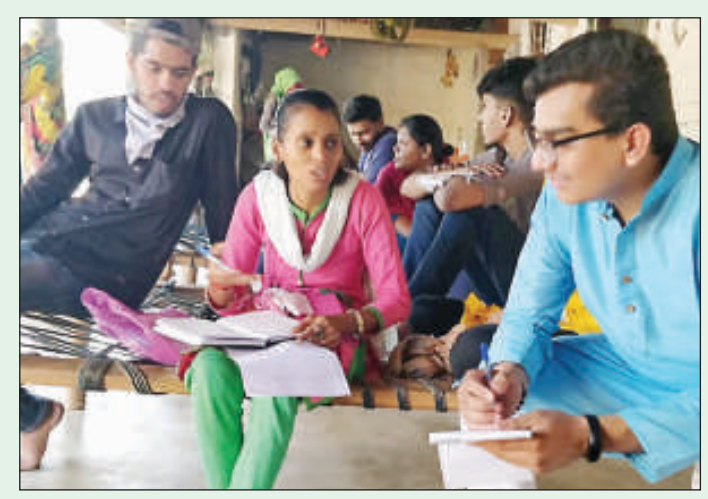
Students interacting with the villagers in Meghraj Town