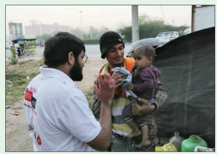
Mission Sangharsh students interacting with local inhabitants

Mission Sangharsh, started its new initiative by the name of 'Philanthropic Friday', in lieu of which donations were carried out in front of the ILNU gate from students and the collections were donated to the nearby local inhabitants by the volunteers on December 21, 2018.