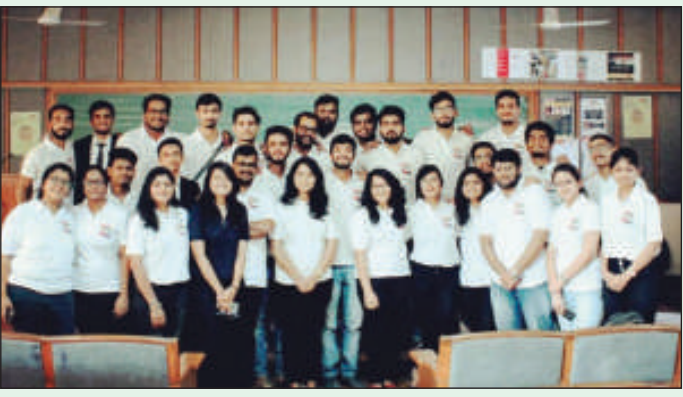
Mission Sangharsh group photo

Mission Sangharsh, started its new initiative by the name of 'Philanthropic Friday', in lieu of which donations were carried out in front of the ILNU gate from students and the collections were donated to the nearby local inhabitants by the volunteers on December 21, 2018.