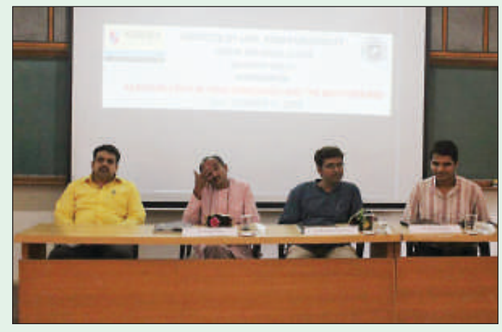
Dignitaries on the dais during the workshop