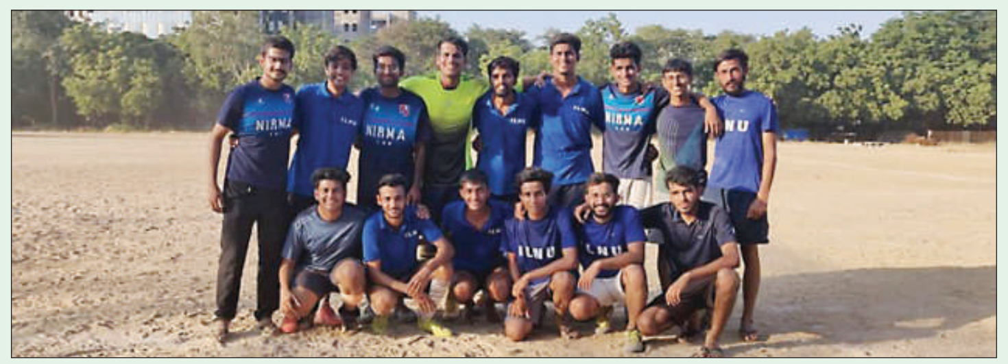
ILNU Football team

The ILNU Football Team, won the Inter Institute Football Tournament as a part of the Sports Festival, 2018, Nirma University. The team beat the football team from Institute of Technology, Nirma University by a margin of 2-1 to secure a win in the finals.