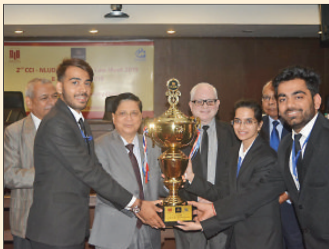
Team with CCI-NLUD Moot Winners trophy