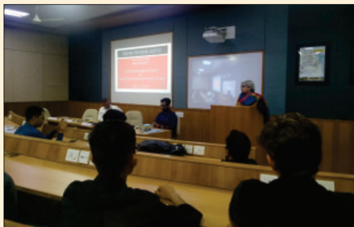
Dignitaries on the dais during panel discussion