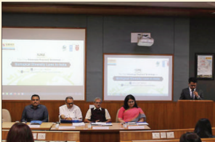
Dignitaries on the dais during Bio-diversity training

The Institute of Law, Nirma University, in association with United Nation Development Programme and National Law School of India University (NLSIU), Bangalore conducted a two day advanced regional workshop on Biological Diversity Laws in India on March 29 & 30, 2019.