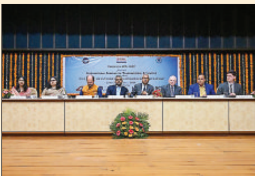
Dignitaries on the dais during inaugural session