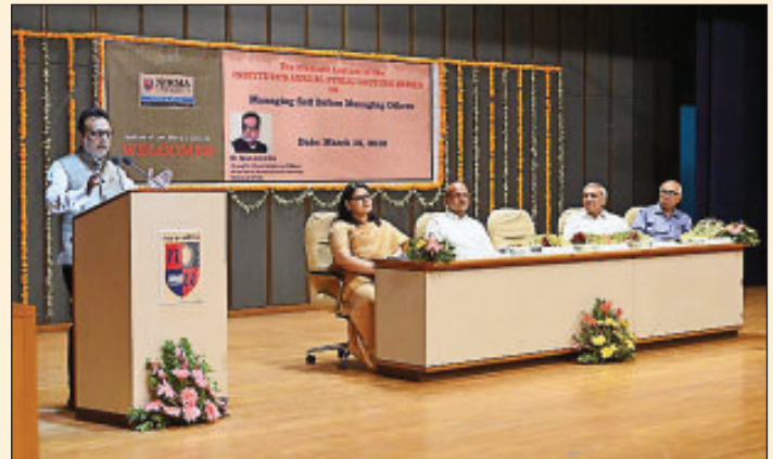
Dr Hasmukh Adhia addressing the audience