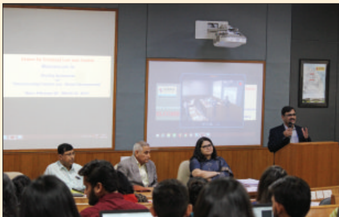
Dignitaries on the dais during the symposium

The Centre of Criminal Law and Justice under the Institute of Law organized a two day symposium on Deconstructing Criminal Law on February, 28 and March 01, 2019, in the light of the recent developments in criminal law. The symposium analyzed two prominent judgments of the Supreme Court of India- on decriminalization of the law of adultery (Joseph Shine v Union of India) and reading down Section 377 of the Indian Penal Code, 1860 which prohibited homosexuality even in a private space (Navtej Singh Johar v Union of India). The Chief Guest of the inaugural session of the symposium was Prof (Dr) B.B. Pande, Visiting Professor, University of Cardiff, Wales, UK.