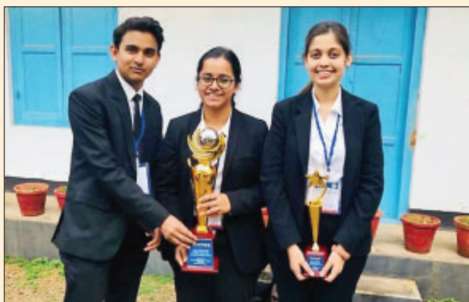
The winners of the CLEA Moot, 2019