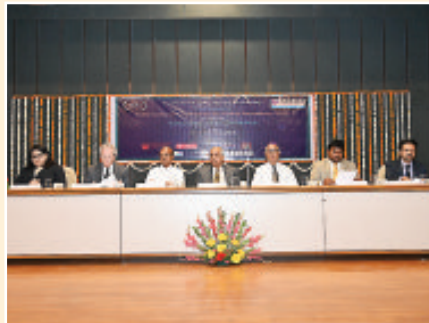
Dignitaries on dais during the inauguration of Conference