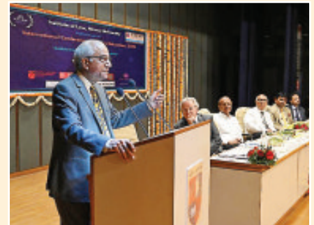
Hon'ble Justice BN Srikrishna addressing the audience