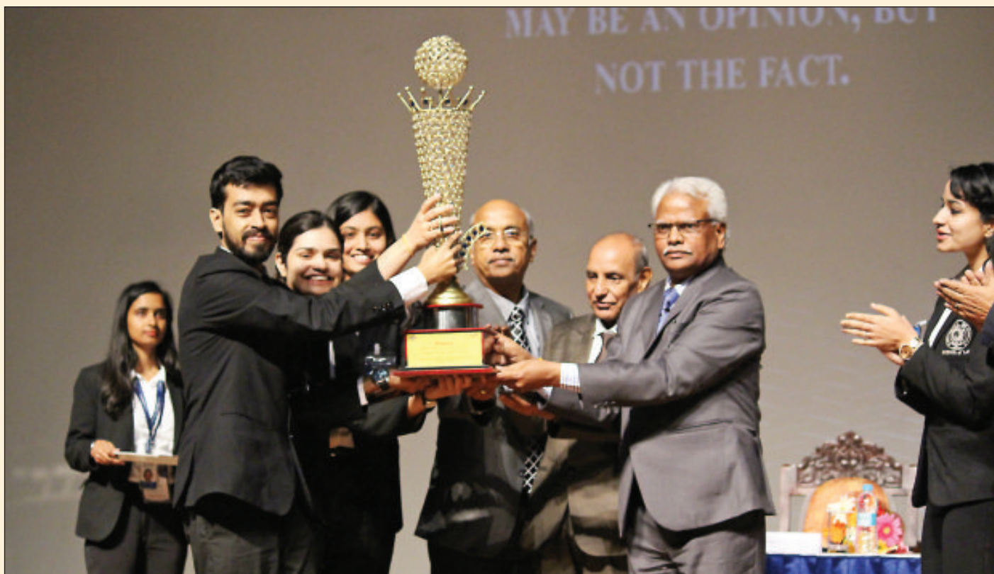
SLCU Winning Team with Trophy