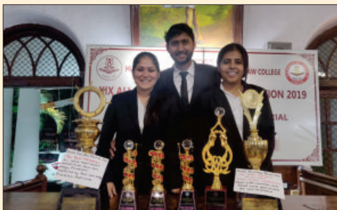
Team with XIX All India Moot Winners trophy