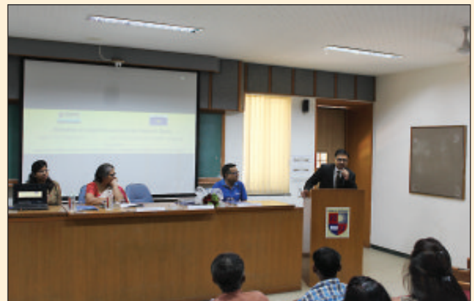
Dignitaries on the dais during the inaugural function