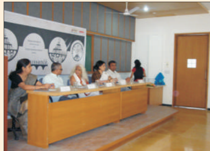
Valedictory function of Connaissance

The Cambridge Style Debate held on 8 th and 9 th October. The Quiz was held on 8 th October. Spelling Bee and Jam both were held on 9 th October. 8 th and 9 th , October 2010 were the two zestful days where colleges from all over Gujarat participated in our Annual academic fest. It was indeed a great success. It not only gave the opportunity to the other colleges to participate and showcase their talents but also set a new platform for the Law students to indulge in hosting such events at such a large scale.