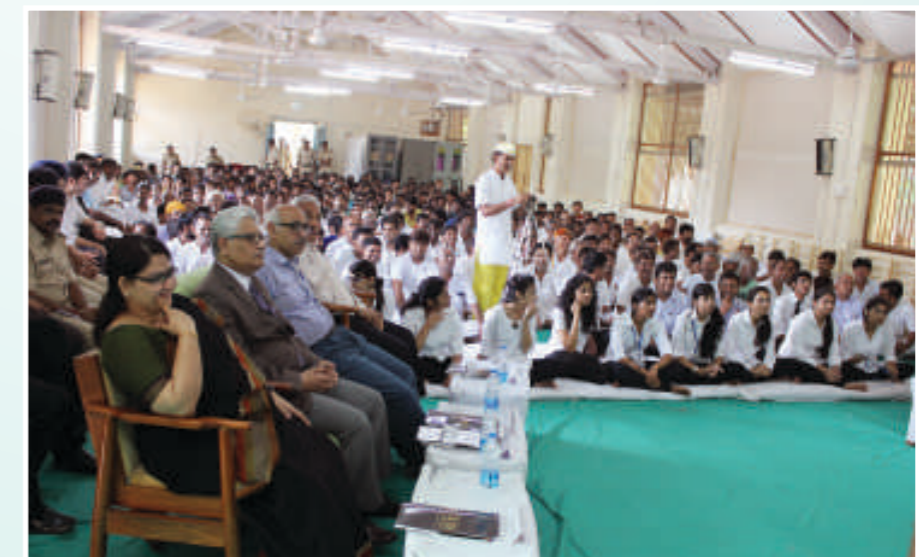
Dignitaries present during Inauguration Programme