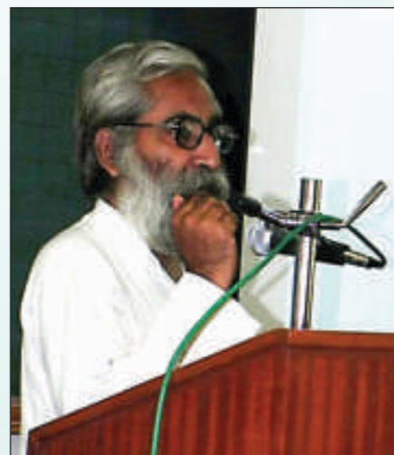
'The strengthening of democracy at the grass root level': Guest Lecture by Dr. Sandeep Pandey (Ramon Magsaysay Award Winner)