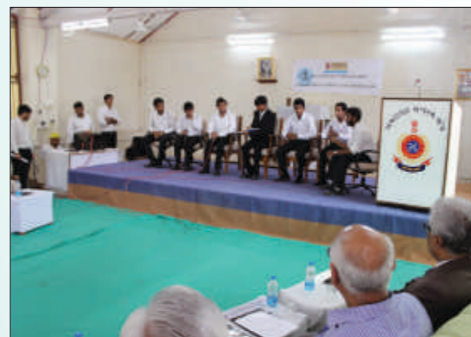
Legal literacy camp at Sabarmati Jail, Ahmedabad

In this camp, ILNU students spread awareness about the rights, duties and various government-welfare schemes available for the benefits of prisoners, their children and families. The students performed skits in local and easy-to-understand language for the benefit of the prisoners. The aim was also to spread the message about the benefits of juvenility among prisoners who were not juvenile at the time of commission of offence, but now are covered by Juvenile Justice Act of 2000.