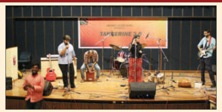
Students performs during the musical event 'Tangerine'

The Samvaad session on "Female Foeticide" was followed by movie screening "Matrubhoomi" on December 20th, 2016.