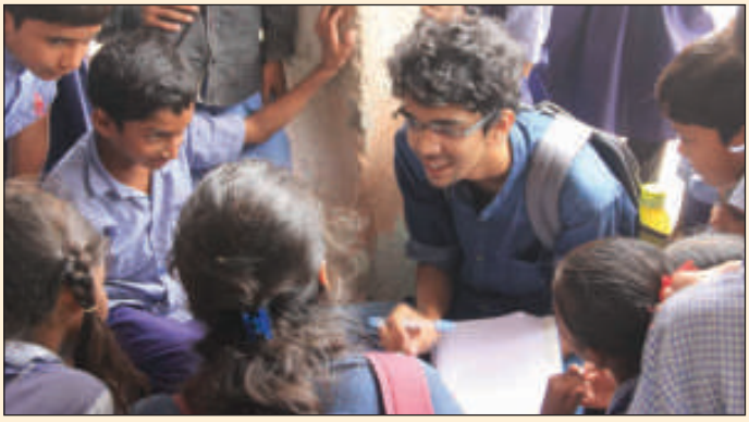
NSS volunteers orienting the students of the middle school about Swacchh Bharat Scheme and benefits and needs of Cleanliness