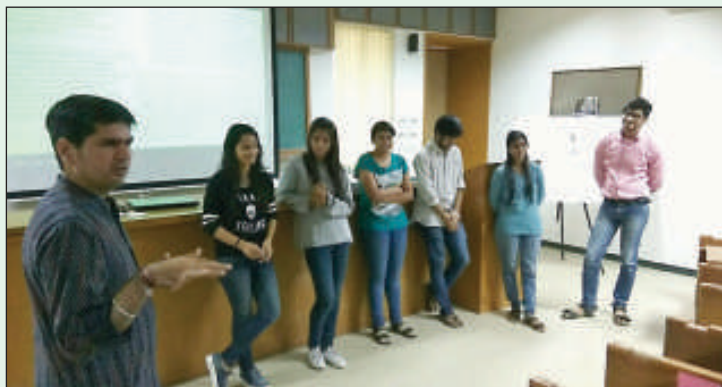
I Policy workshop