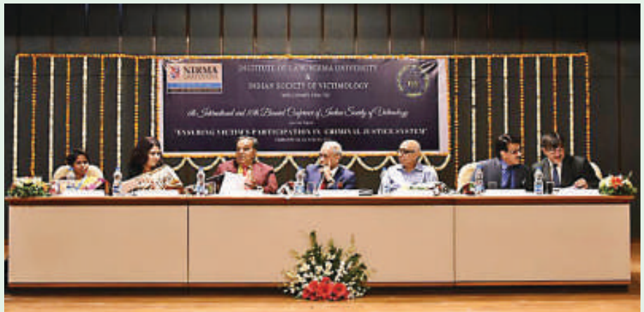
Dignitaries on dais