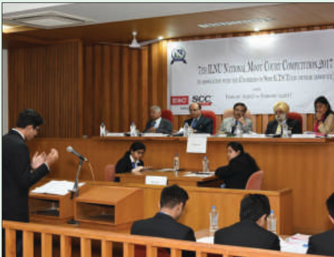
Dignitaries on dais during the final round

Institute of Law, Nirma University organized its flagship event, the 7th ILNU National Moot Court Competition, 2017 in association with the Chambers of Shri K.T.S Tulsi from February 10-12, 2017. Forty-seven law colleges across the country participated in this competition. The team of NLIU Bhopal became the winners of this competition and team of NLU Kochi was bagged the Runners up trophy