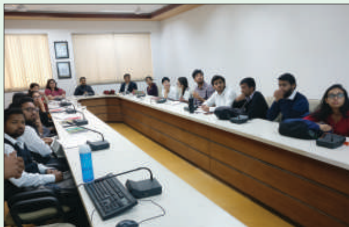
IP Clinic Round table discussion