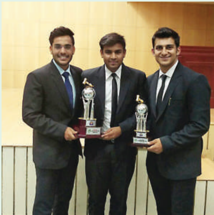
Students with 16 th Amity Moot Runners up Trophy