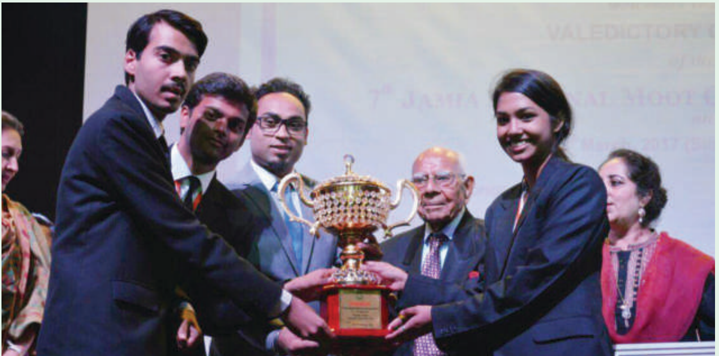
ILNU Jamia Moot Team receives Winners Trophy