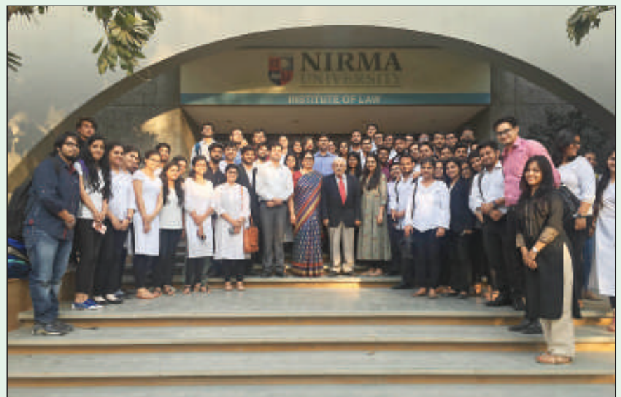
The Mediation training experts with the participants

The emphasis of the workshop was on practical exercises by way of role play, simulation exercises wherein students took up practical problems and acted as mediators, clients and advocates to resolve disputes related to various areas.