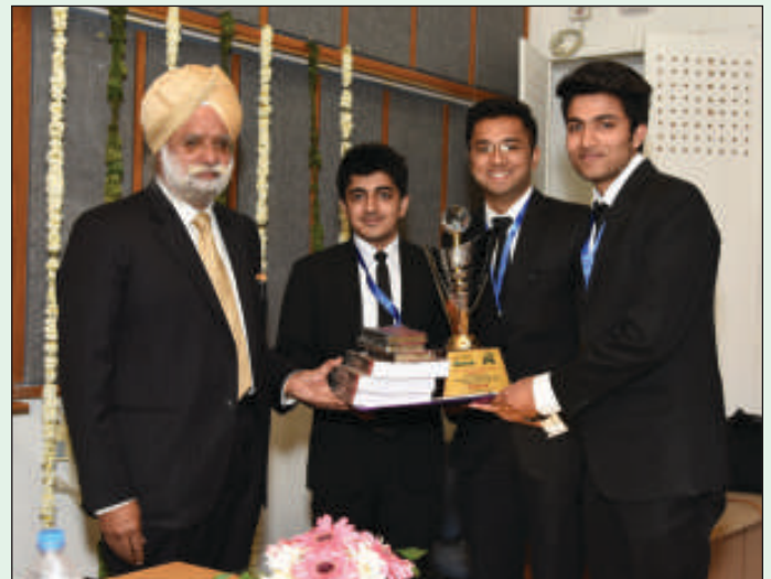
Winning Team with the trophy