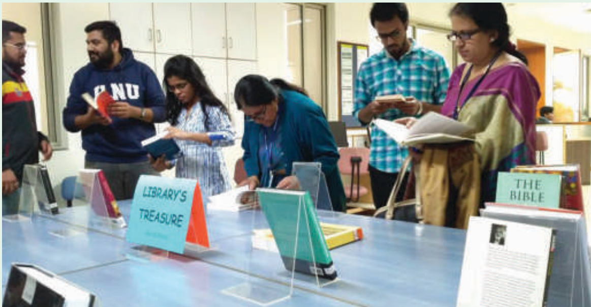
The Books Display on "Law & Religion" (Library Treasure) held on January 28, 2017 at the Library