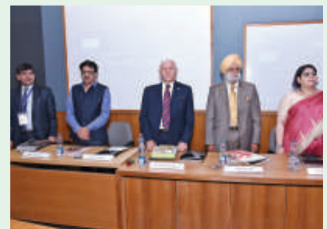
Valedictory session -victimology