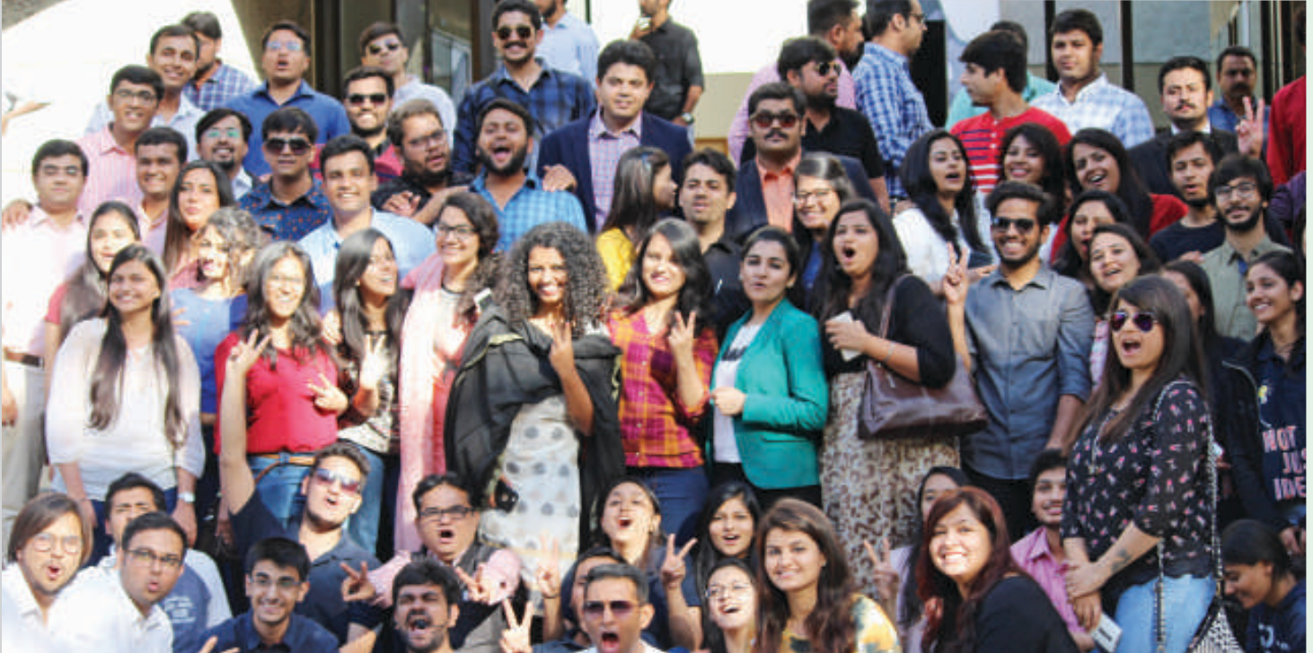
ILNU Alumni members

The Alumni meet – Home Coming 2017 was organized at the Institute on February 5, 2017. ILNU Alumnis actively participated in the programme. All the alumni members spent the whole day at the ILNU and various activities such as Open Mic Session, Mock Classes, Cricket Match + Games, Drum circle, Music were organized during the day which was followed by cultural event.