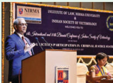
Hon'ble Mr. Justice Mohan Pieris addressing the audience at the Inaugural function