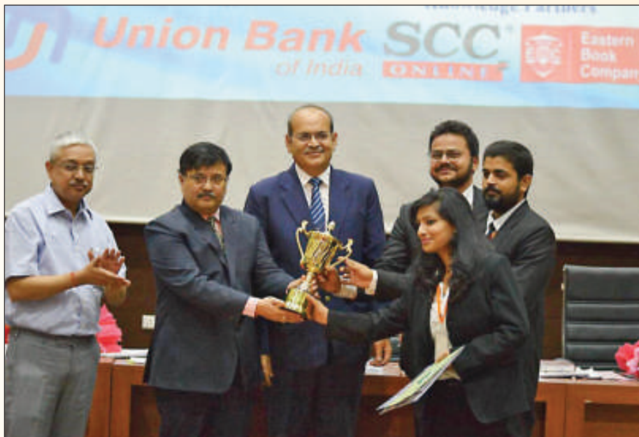
The team receiving the 2nd NUSRL Trial Advocacy Runners-Up Trophy and the Best Researcher trophy