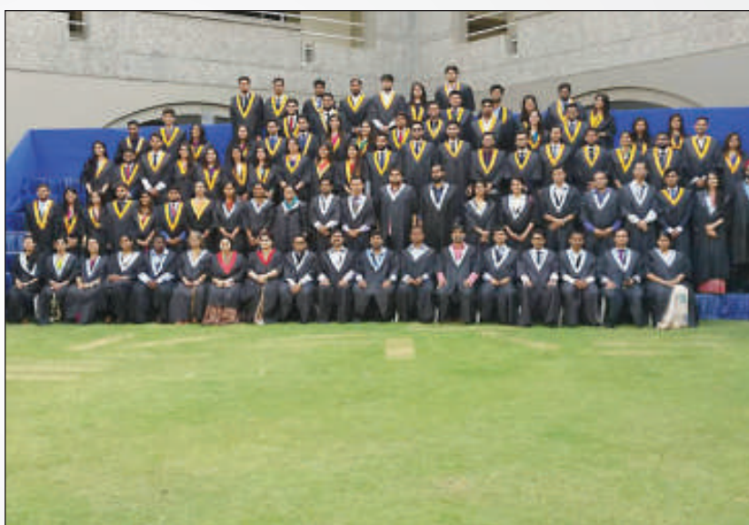
Group photograph of Graduating Batch 2017

A total of 107 students of BA LLB (Hons), 65 students of B.Com LLB (Hons) and 46 students of BBA LL.B (Hons) received their degree at this Convocation. Parents and invited guests attended the Convocation. The following medals were awarded to the students for their overall scholastic performances, and Honours specialized areas in their respective course/subject.