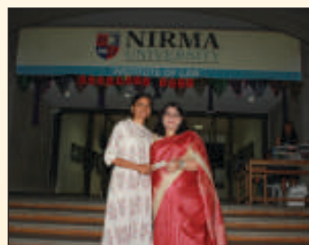
Students being felicitated