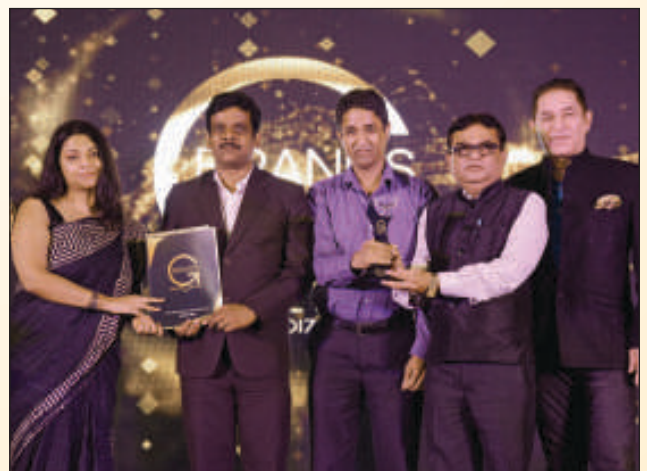
IL-NU receiving the award at the ceremony held in Mumbai

Institute of Law, Nirma University received the 'Best Law Education Institute' under Goodwill Brands Awards in the category of best legal education in the country in a Symposium -Thought of Leadership-Champions Change-hosted by Herald Global. The event was organized by ERTC Media on July 19, 2017 at Hotel Sahara One in Mumbai.