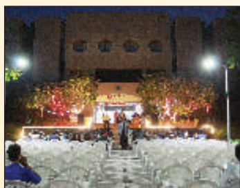
IL-NU during Farewell function

The Institute organized the farewell function for the outgoing batch of 2012 on March 22, 2017. All the students attended the function. The Director congratulated all the students for their achievements at IL-NU and appreciated them for their contributions and support for the development of the Institute. All the students were felicitated in the function with a Certificate of Appreciation and a memento. Further, a special mention of the students who had performed their duties of different student activity club was made. The function was followed by dinner.