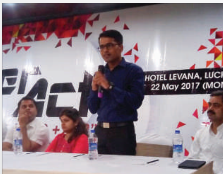
Interactive session in Lucknow