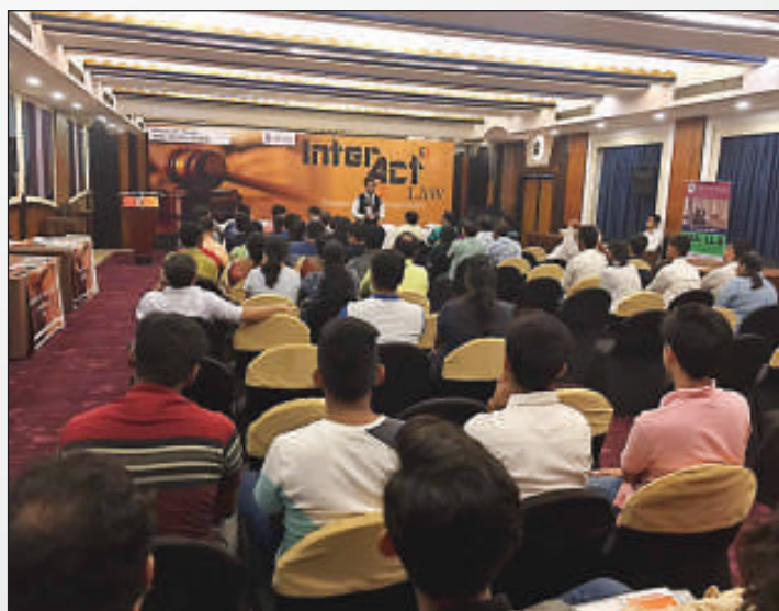
Interactive session in Kolkata