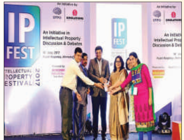
Director, IL-NU receiving the IP Hall of the Fame Award