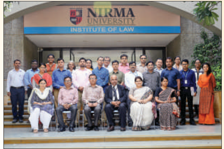
FRP 17 Participants with the Chief Guest