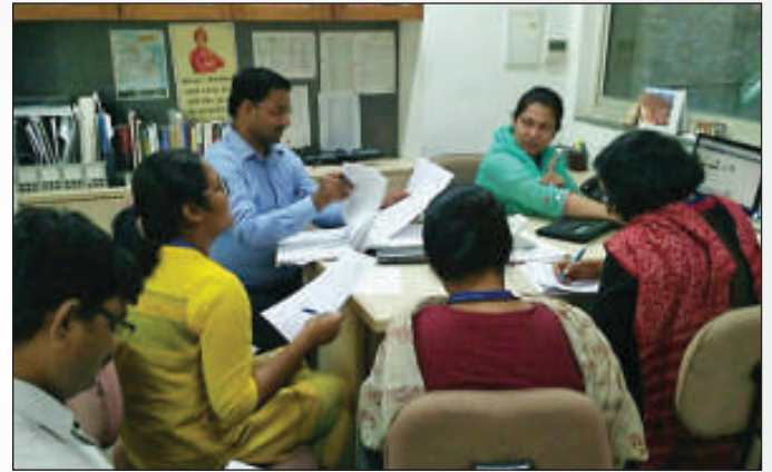
Faculty members participating induction programme at IL-NU Library

During the Faculty Induction Programme, the participants were briefed about maximizing the use of Library Resources & Services for Teaching & Research on June 15.