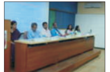
Talk Show on, "Corporate Governance and Business Ethics".