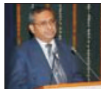
Hon'ble Justice Shri Ravi Tripathi.