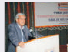
Shri Dushyant Dave