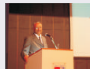
Justice J.N Bhatt