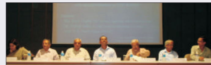
Panel Discussion on Use Of ICT in Governance of India: Ideas for a renewed nation.

The discussion focused on the plan of action of these UIAI and NIHA agencies, Strategic importance of these two projects in good governance of India, and the difficulties that these two agencies will be facing.