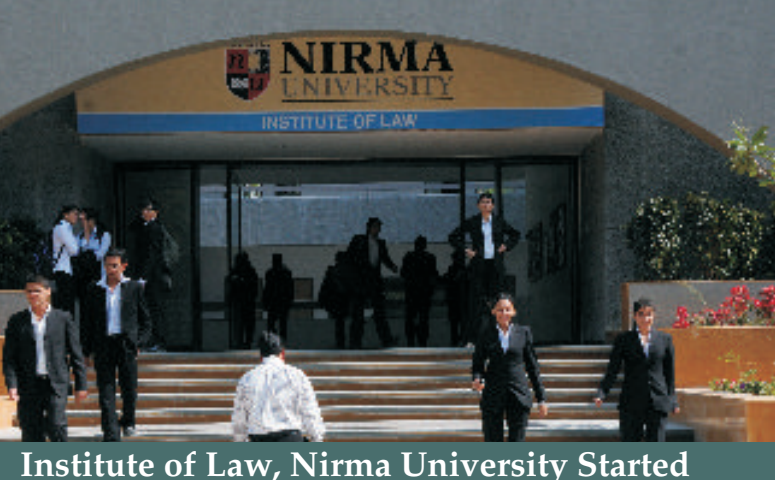
Functioning in its own Building from 15th January, 2010.