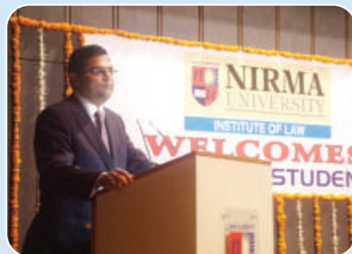
Shri Devang Nanavati, Advocatae, Gujarat High Court delivering a lecture