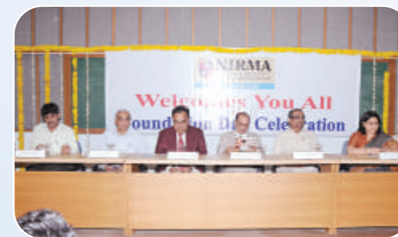
Shri K.K. Patel Hon'ble Justice Bhagwati Prasad, Judge High Court of Gujarat, Hon'ble Justice C. K. Thakkar former Judge Supreme Court, Shri D.P. Chhaya, Dr. Purvi Pokhariyal Foundation day at 18th August 2010

On 18th August 2010, Institute of Law Celebrated its Foundation day by inaugurating the newly constructed MOOT COURT HALL. On this day various activities were organized like Legal Literacy on Right to Information, Blood donation Camp, Tree plantation, Antakshri competition, Collage and Poster Competition on the theme, "Women Empowerment" Dumbsherads. Students enthusiastically participated in all the activities. On this day outstanding students were felicitated Felicitation. The Chief Guest of the function was Hon'ble Justice Bhagwati Prasad, Judge High Court of Gujarat. The function was presided over by Hon'ble Justice C. K. Thakkar, former Judge Supreme Court of India. Other dignitaries who graced the occasion were Mr. B. N. Karia, Member-Secretary, Gujarat State Legal Services Authorities, Shri K. K. Patel, Chief Executive Officer of Nirma University, and Shri. D. P. Chhaya, Executive Registrar