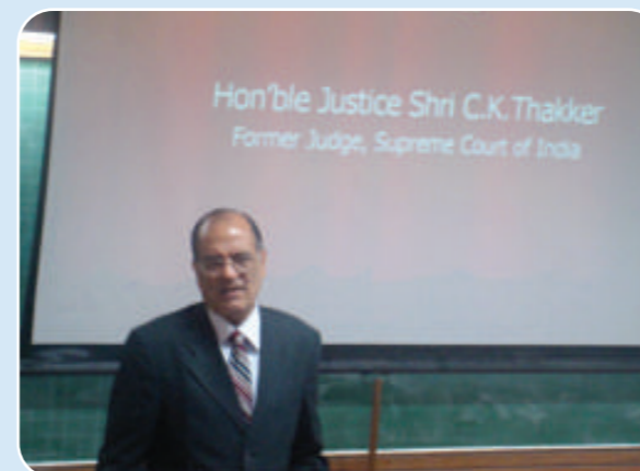
Hon'ble Justice C. K. Thakkar [Former Judge Supreme Court of India] orienting students for Interpretation of Statutes