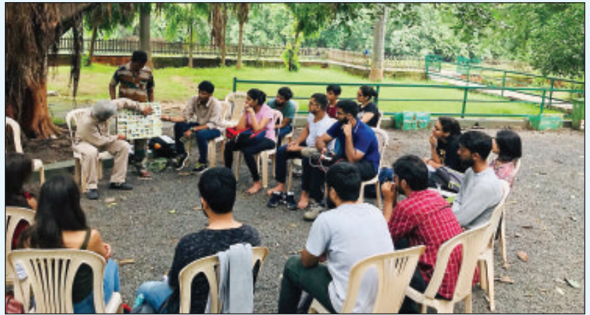
Study tour to Polo forest

The students of Biodiversity Law went on a study tour to Polo Forest on September 10, 2019. The tour was aiming to sensitize the students of the biological resources and the rules and regulations that are providing necessary safeguards.