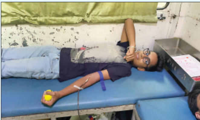
Blood donation drive

As part of Foundation Day celebration, the NSS Unit, in association with the Legal Aid Clinic Committee a Blood Donation camp was organized on August 19, 2019 on the campus. About 59 students donated blood during the camp. In association with the Legal Aid Committee, the NSS Unit also organized a plantation drive on the same day on the campus. About 28 saplings were planted on the campus.