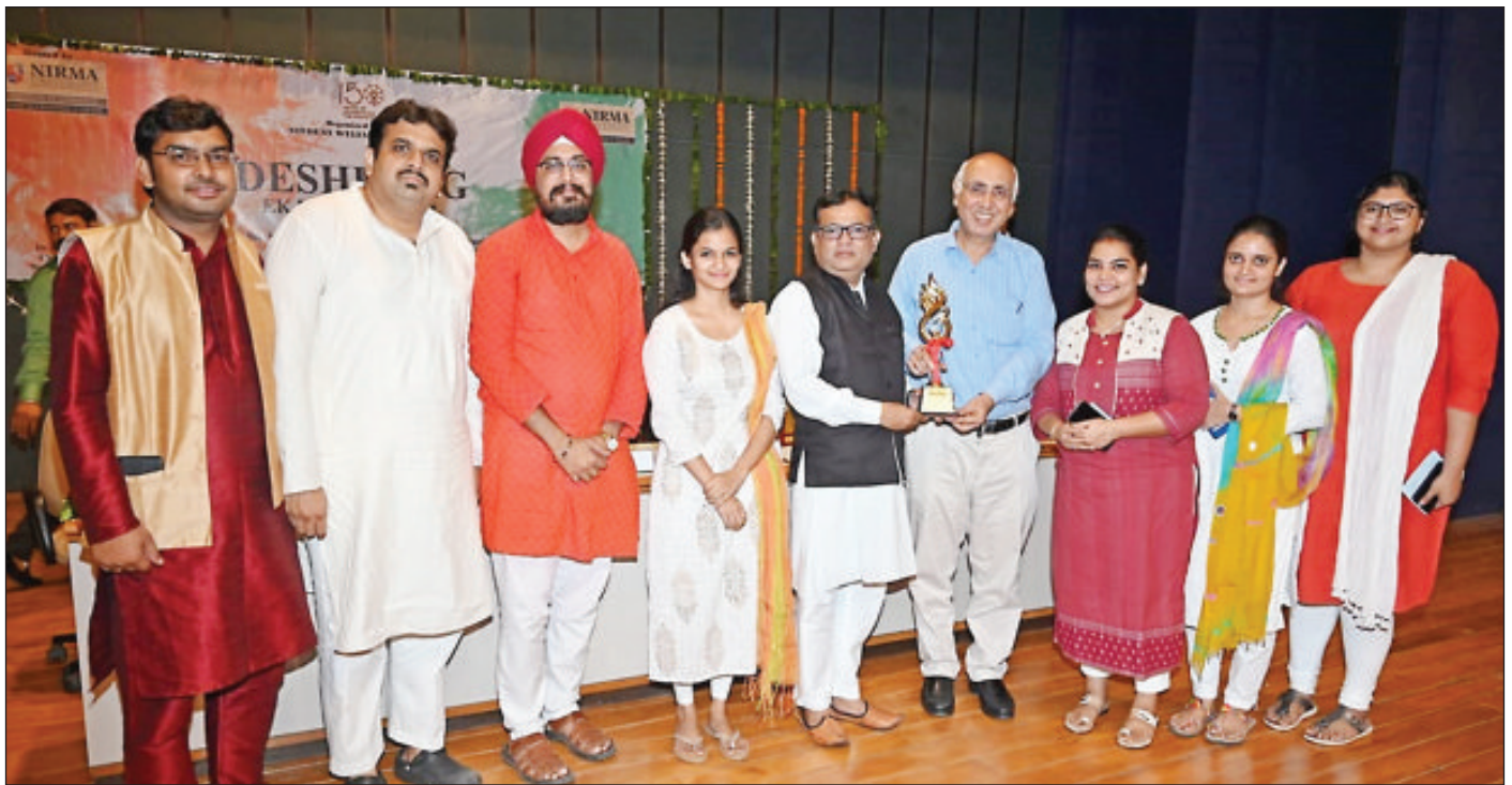
ILNU Team with Runner's Up trophy

A team comprising faculty and staff members at ILNU won the Runner's Up Trophy of the Deshraag – Patriotic Song Competition organized by the Students Welfare Board, Nirma University on August 09, 2019.