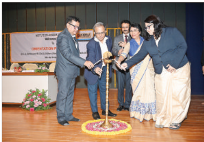
Inauguration The Orientation Programme