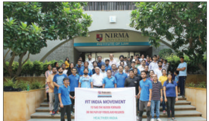
ILNU team - Fit India Movement

As part of Government of India's innovative movement 'Fit India Movement'- to take the Nation forward on the path of Fitness and Wellness-Healthier India, the NSS Unit of ILNU organized a 'Walk 10,000 step on the campus' programme on August 29, 2019. The event was basically to generate awareness regarding sports and yoga among the youth. The volunteers watched the telecast and Prime Minister's speech.