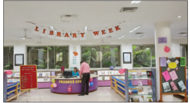
Celebration of Library Week

Library Week was celebrated from August 13 to 17, 2019. As part of this celebration, a Quiz Programme titled ‘Blind Date with Book’ was organized. Winners of "Library Week Celebration - Quizzing on our Library".