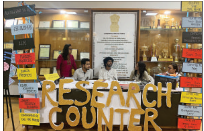
SRC Research Counter

(September 09 -12, 2019) Research Counter was set up in the institute that introduced the world of Research and Policy to students by SRC. It served as a counter for research portals, tools and centres. It also introduced students to fellowships like LAMP, Gandhi etc..