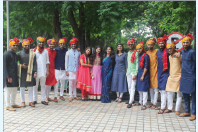
Students on Hindi Diwas

The Institute of Law celebrated Hindi Diwas on September 16, 2019, acknowledging the rich and diverse Indian culture, and the importance of a language in any culture. The main aim of celebrating this day was to acknowledge the national language of the country. All the students were dressed in Indian Traditional clothes. An event "Syaahi" was organised, wherein the students were given a platform to showcase their talents and to express themselves through their poems in Hindi. The celebration was a tribute to the national language, rich culture and tradition.