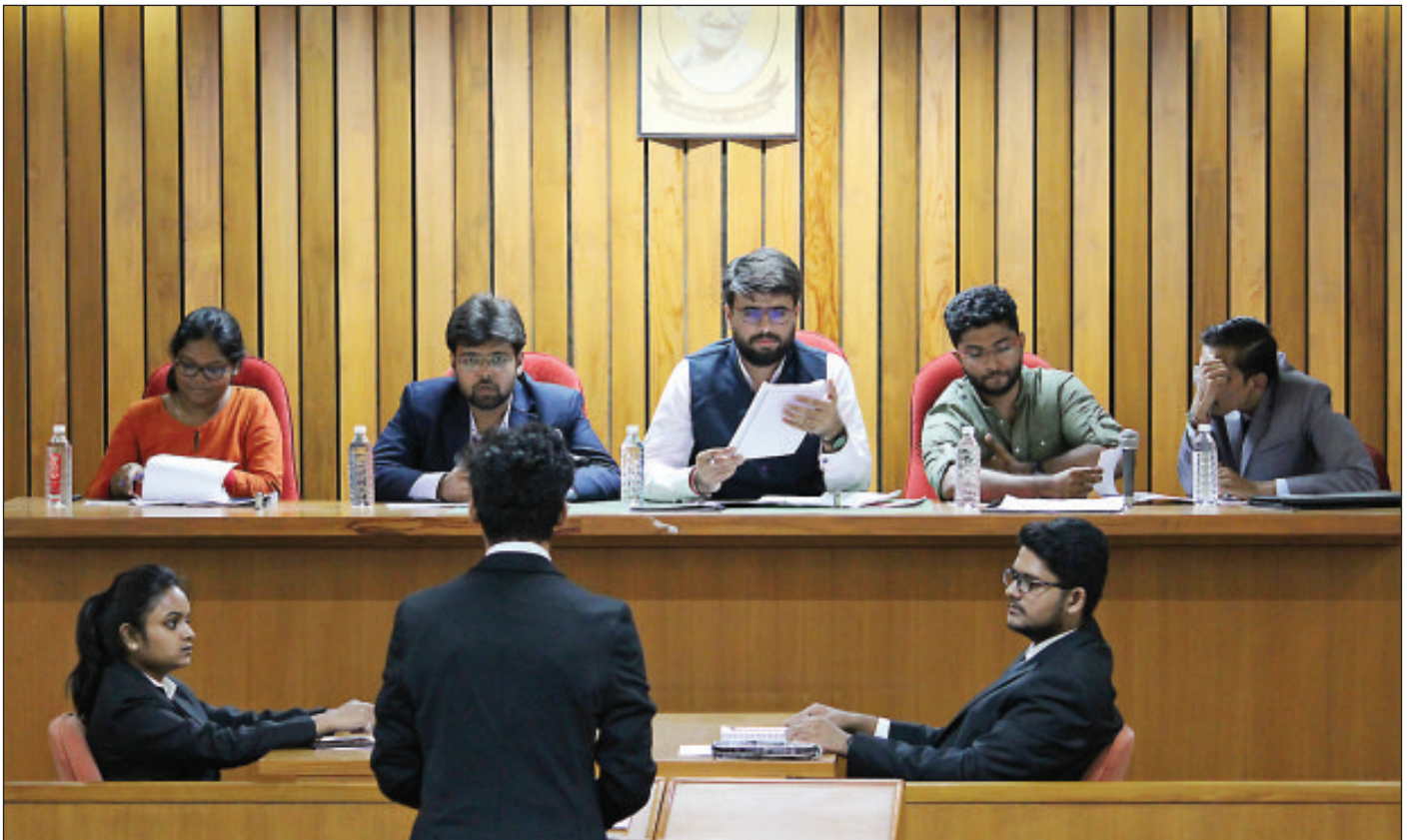
Judges at the Learner's Moot Competition

The Learner's Moot Court Competition was organised on September 21-22, 2019 at the Institute of Law. This competition was conducted for the students admitted for the first year Batch 2019.