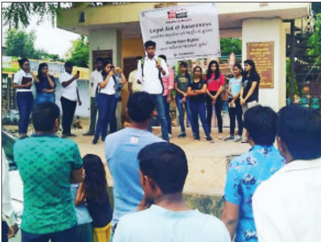
Legal Awareness camp

A Legal Awareness Camp in village Charodi near Nirma University, under its new campaign namely, "Know your Rights" was conducted by Team Mission SanghARSH. A Team of 14 members visited the village on September 22, 2019. The team spoke and made the people aware about the new traffic rules which have been implemented recently by the government. The people were made aware about the new traffic rules, revised penalties, and the required documents which they should keep with them. Along with that, the safety measures which every person should take and things that they should avoid like rash driving, drink and drive etc. were also discussed