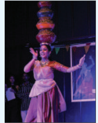
Performance by student