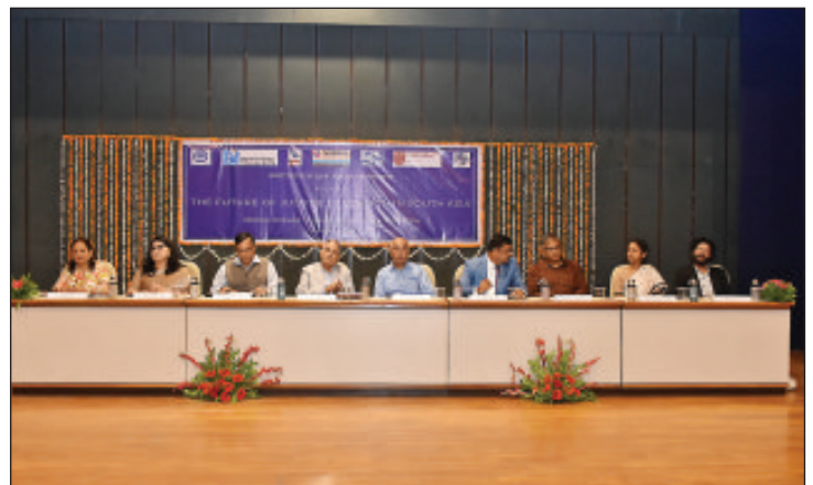
Dignitaries on the Dias during the inaugural function

The Institute of Law, Nirma University in collaboration with the Azim Premji University, Bengaluru, National Law University, Odisha, Gujarat National Law University, Gandhinagar and National Law School of India University, Bengaluru organized a two day regional conclave on the future of Justice Education in South Asia from November 8 & 9, 2019. The program was attended by academicians from various law colleges in the South Asian countries. This conclave emphasis on the lack of an adequate collaborative platform and the paucity of the high quality research at the Indian and the south Asian regional levels for educators and practitioners involved in justice education and the promotion of Human Rights.