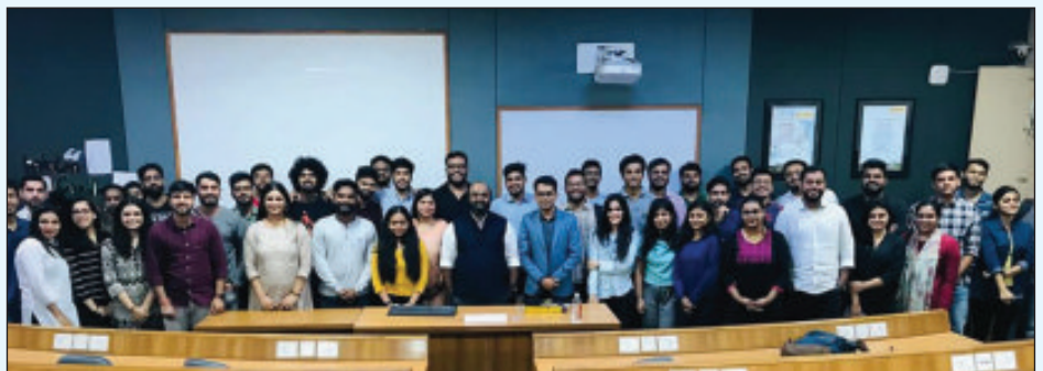
Students with the dignitaries during the Seminar