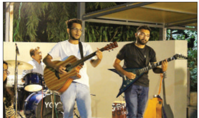
Tangerine, Musical event

The Music Committee, ILNU in collaboration with NSS Unit and Karnavati University organised its flagship event "Tangerine 6.0" on November 28, 2019. The program was held at City Pulse Cinema, Gandhinagar. The event witnessed a series of performance of 20 songs. The audience enjoyed the evening.