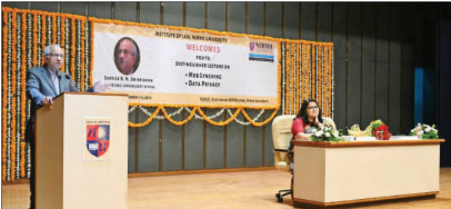
Hon'ble Justice B N Srikrishna