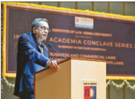
Hon'ble Mr. Justice M. R. Shah