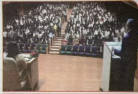
LECTURE – INSTITUTE OF LAW, NIRMA UNIVERSITY