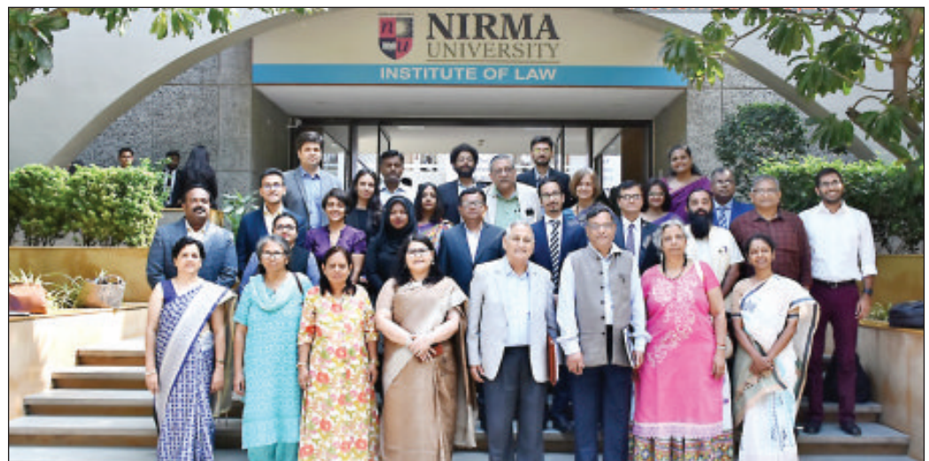
GAJE Group Photo