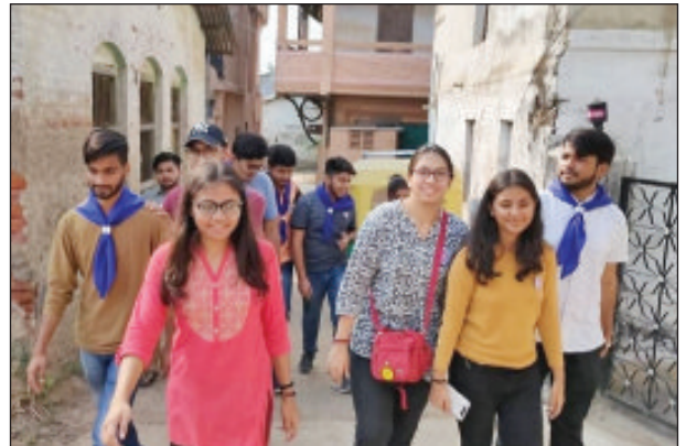
NSS team visit to Valad

NSS Unit of ILNU made its preliminary visit to the adopted village Valad on November 16, 2019. The volunteers met the Sarpanch of the village with the aim to know about the demographics of the village. The volunteers also visited the Primary School, Panchayat Bhavan, Temples, Mosque, Police Station, Aanganwadi, Arogya Kendra.