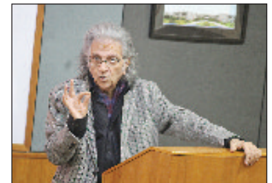
Prof. Upendra Baxi

At the outset, Prof. Baxi discussed about the distinction between Constitutional morality, Post constitutional morality and Public morality. He focused on meaning of Constitutional Morality, Public morality against Constitutional Morality and various Objections to Constitutional Morality. Prof. Baxi quoted Dr B R Ambedkar and stressed on the need to make people believe in the values enshrined in the Preamble of the Constitution. He urged for using Constitutional morality as a yardstick for judging social and political developments.