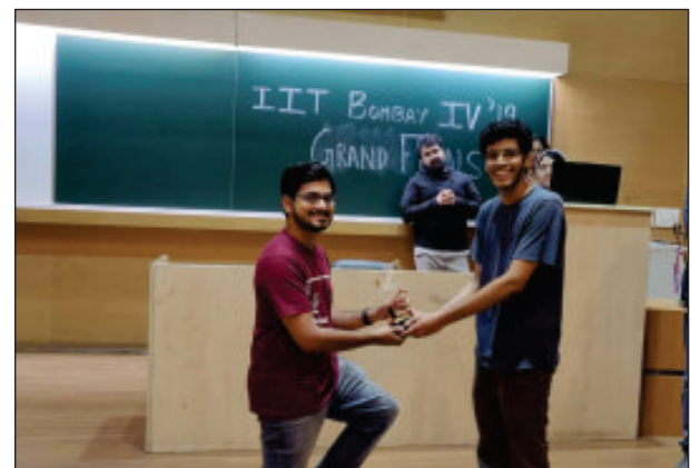
IIT Mumbai Debate