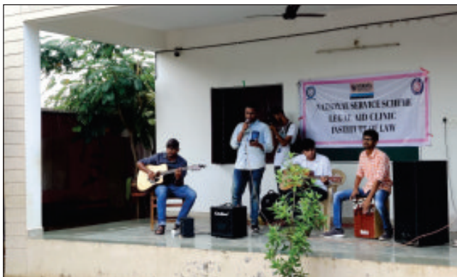
Aashayein, musical evening

The Music Committee of Institute of Law, Nirma University, in collaboration with the NSS, organized Aashayein, a musical evening for the orphaned children at Gokul Ashramshala, Vasant Nagar, Ognaj, Ahmedabad on October 5, 2019. The members of the committee performed for the children and the children danced along the tunes of the Bollywood music. The event also witnessed some of the children displaying their musical talent.