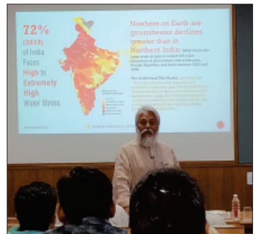
Mr. Rajendra Singh addressing the students

The Centre for Environmental Law in collaboration with ILNU Unit of National Service Scheme of Institute of Law organised a workshop on the topic "Revival of Indian Rivers – Reviving a Lost Culture" on October 20, 2019. The key note speaker for the event was Mr Rajendra Singh, who is a Magsaysay Awardee and winner of Stockholm Water Prize – 2015, is an Indian Water Conservationist and Environmentalist. He is also known as 'Waterman of India'. He is working immensely for the revival and rejuvenating of the water bodies for the last three and a half decades. Mr. Rajendra Singh presented a need to establish a connection between indigenous knowledge and practices and the present legal regime and governmental practices in order to avoid drought and flood like situations in India.