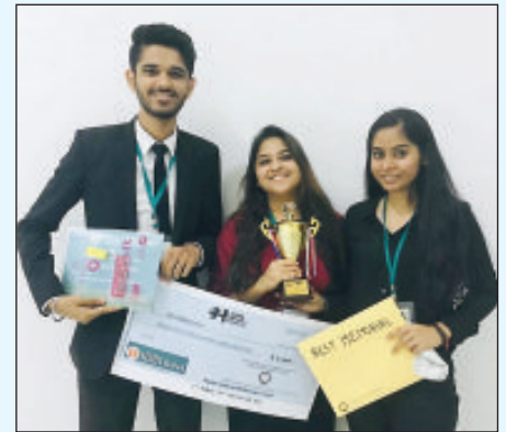
HNLU Moot Team

from Institute of Law were adjudged as Runners -up in 8th NLIU Corporate Moot Court Competition 2019. The competition was organised by National Law Institute University, Bhopal from December 6 -8, 2019.