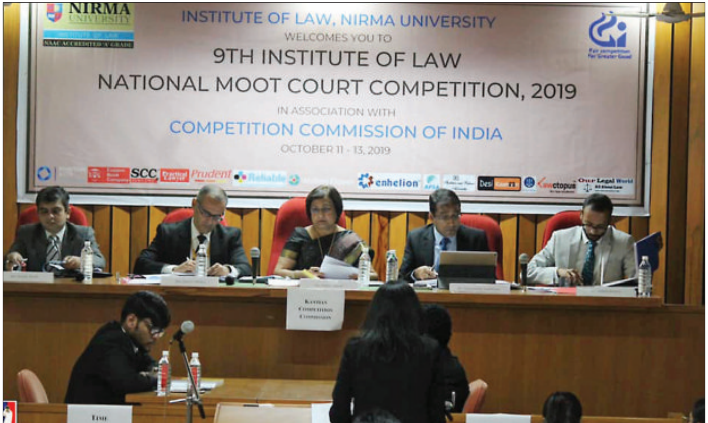
Judges on dais at moot court final round