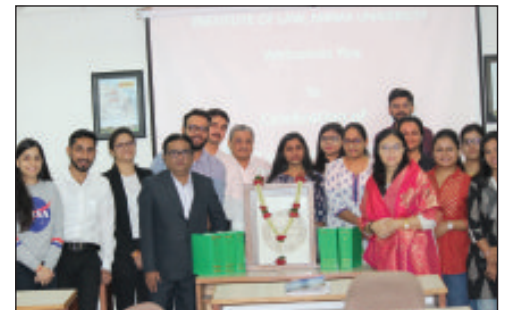
Faculty and students with the Constitution of India original book