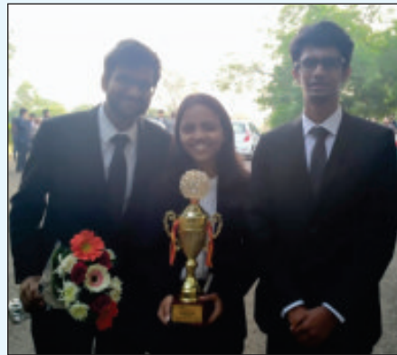
NLIU Corporate moot team