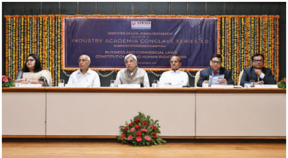
Dignitaries on the Dais during inaugural function

To commemorate Nani Palkiwala Centenary Celebrations, Institute of Law, Nirma University organized a two day academia conclave from November 16-17, 2019 on the theme "Towards a new area of academia- legal industry collaboration". It was organized with an aim to blur the boundaries between the disciplines that we study and to encourage an amalgamation of different ideas and perspective that cut across discipline. The conclave was divided into two phases- Business & Commercial Law Conclave and Constitutional & Human Rights Conclave. The chief guest for the conclave was Mr. Sunil Arora, the Chief Election Commissioner of India. He gave the inaugural address for the event on the theme - One nation, One Election in India. He took this conclave as an opportunity to announce that the institute IIDM is establishing an interdisciplinary course.