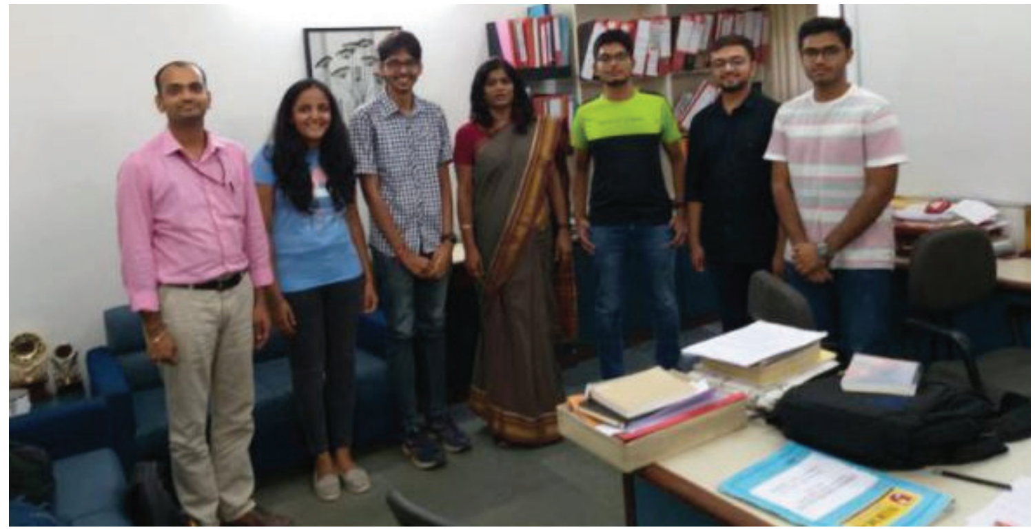
This year 7 students have completed summer training in universities placed in USA in the field of image classification, 3D mapping, video processing etc. The department is proud to have such students for their interest that took them to the global platform.