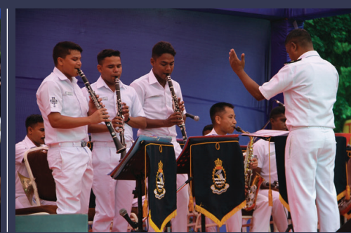
Visit of Exhibition of Indian Navy and NSG by Hon. Governorshri of Gujarat