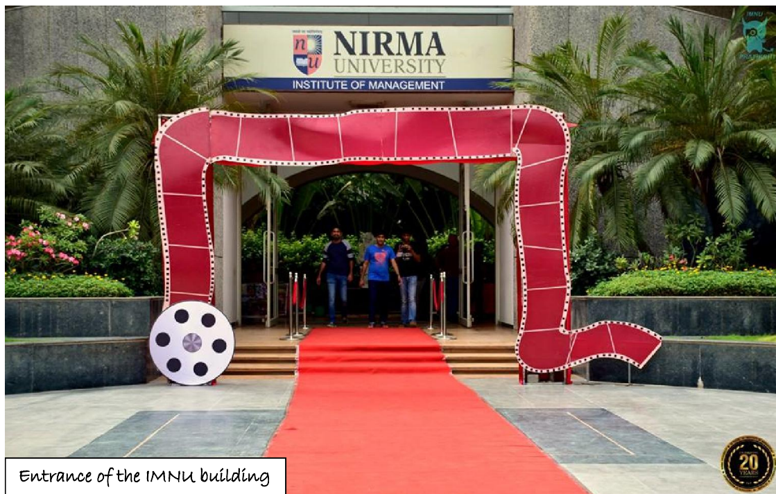
Entrance of the IMNU building

With the theme of this year's Alumni Day being "The Red carpet".