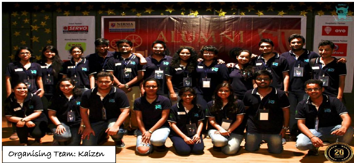
Organising Team: Kaizen