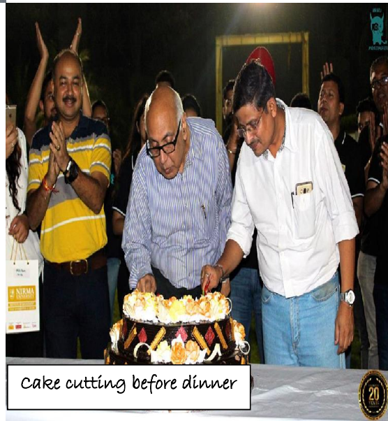
Cake cutting before dinner

This marked the end of the Alumni Day 2016 and they all got back to their daily schedule of professional life once again.