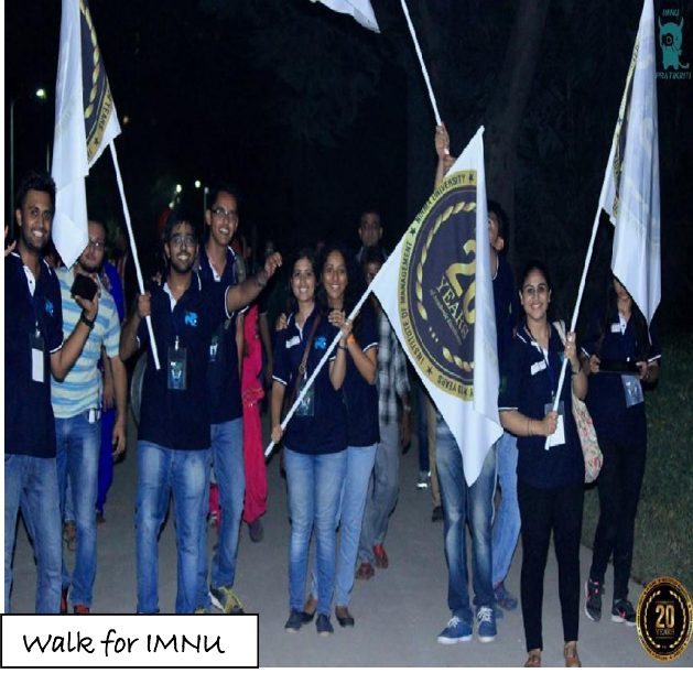
Walk for IMNU

It was a day full of activities for the alumnus and many were seen being nostalgic and emotional about the day ending. All the alumnus interacted with each other at night and then proceeded to their hostel rooms for a good night's sleep.