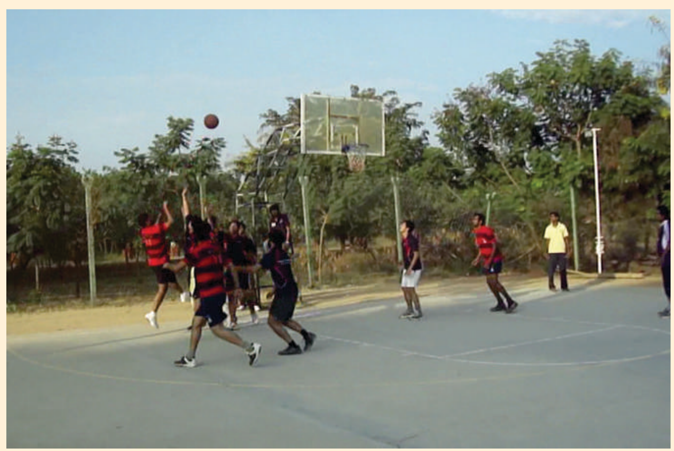
Aiming for success: Parakram 2011

Parakram 2011, the two day National level sports extravaganza was organized by Institute of Management, Nirma University on February 13, 2011. Teams from Bschools across, included IIM-I, MICA, IRMA, SPM Gandhinagar and AES Ahmedabad. Each B-school had a squad of 30 players who participated across various team games, viz. cricket, football, volleyball, basketball and throw ball and individual games, viz. tennis, table tennis, badminton, athletics and chess. Officials from the Sports Authority of India (SAI) were referees for all of the events. Large crowds came to support their respective colleges and all the matches were full of excitement and high adrenaline. The spectators were treated with some breathtaking performances and eventually IMNU came out on top, followed by MICA and IIM-I in the final points tally.