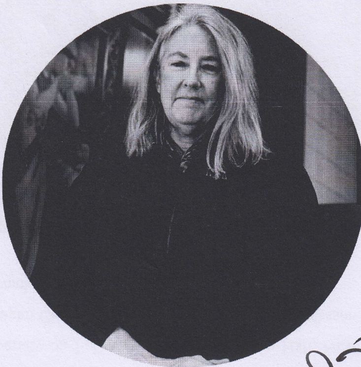
Judge Mel Flanagan