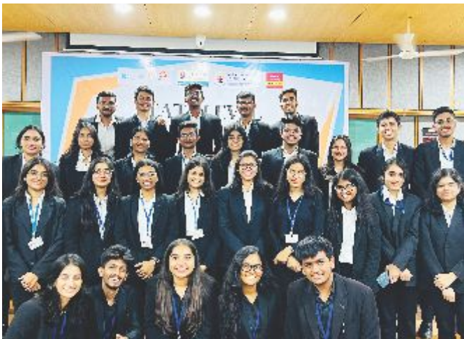
State Level Pro-Bono Meet