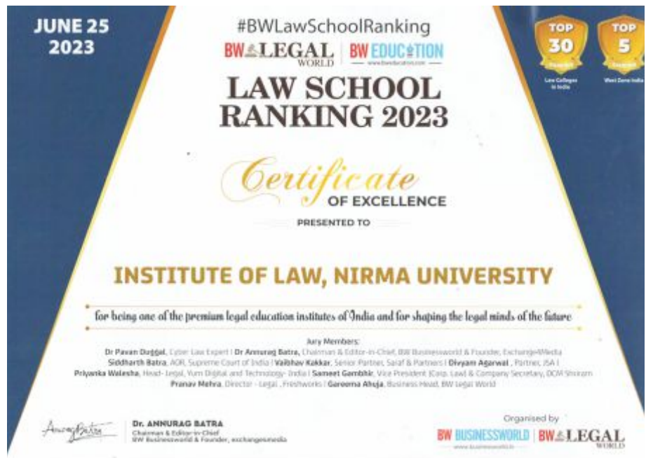
Business World Law School Ranking

The Institute of Law, Nirma University (ILNU) has been awarded the trophy for being one of the top 30 law colleges in India West Zone (overall ranking 24, India Top 5 in Business World Law School Ranking under Law School Ranking 2023). The institute received a 'Certificate of Excellence' for being one of the premier legal education institutes of India for shaping the legal minds of the future.