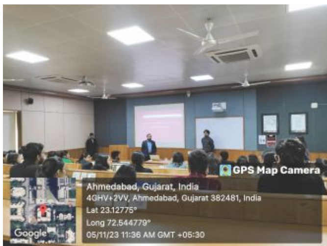
Expert Talk on Corporate Law by CRC