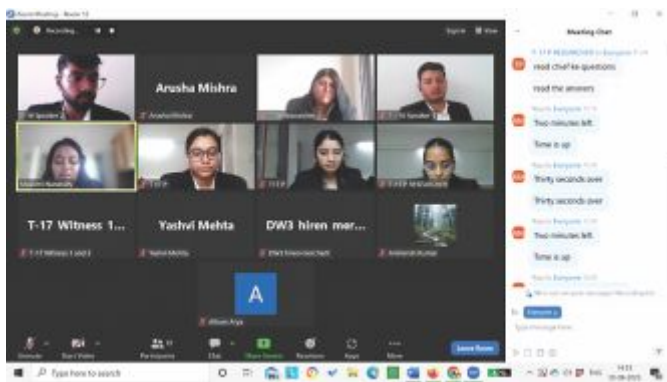
Open Challengers Mock Trial