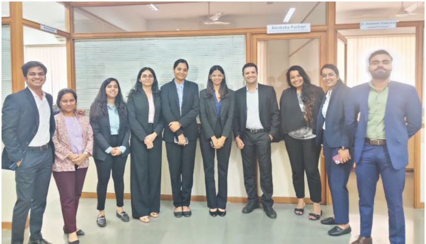
Campus Recruitment Drive