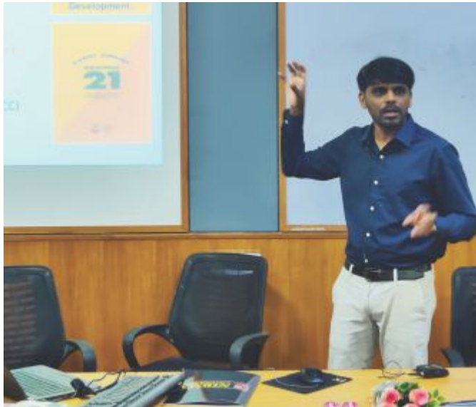
Expert Session on Bio-diversity