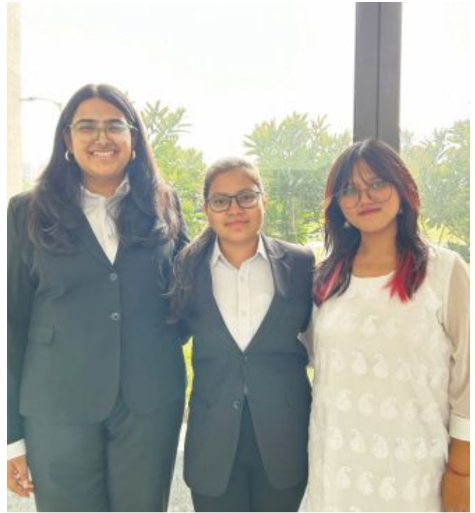
QED Parliamentary Debate