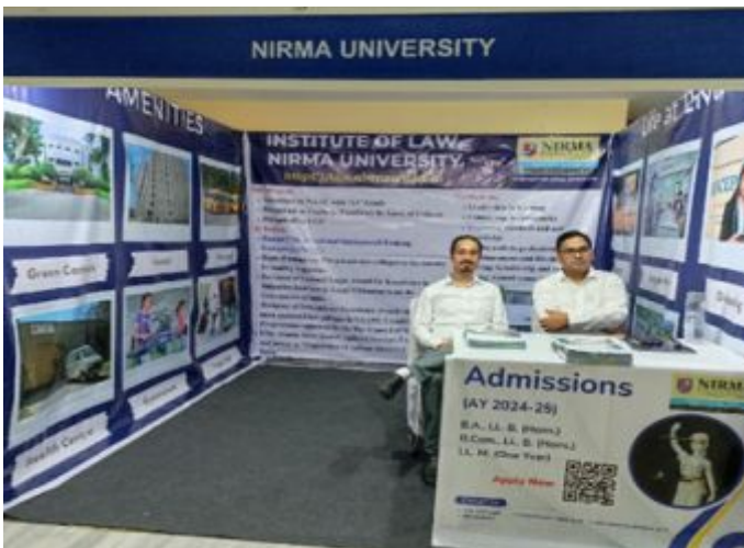
CLAT Preparation Educational Conclave at Jaipur and Gurugram