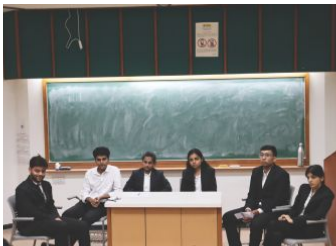
Learner's ADR Competition

The Alternative Dispute Resolution Committee at ILNU organized the 3rd edition of Learner's ADR competition for the first-year students on October 28, 2023. The competition offered the students an opportunity to hone their advocacy skills within the mediation process. Participants received constructive feedback and guidance from the judge's panel.