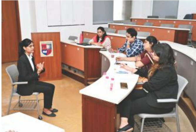
Professional and Academic Competency Test

PACT Program was held by the Campus Recruitment Cell on October 7, 2023. The test program had 10 panels in total and