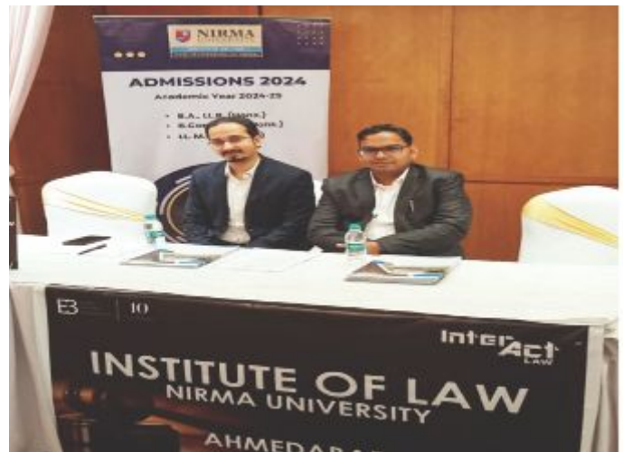
Educational Conclave at Patna