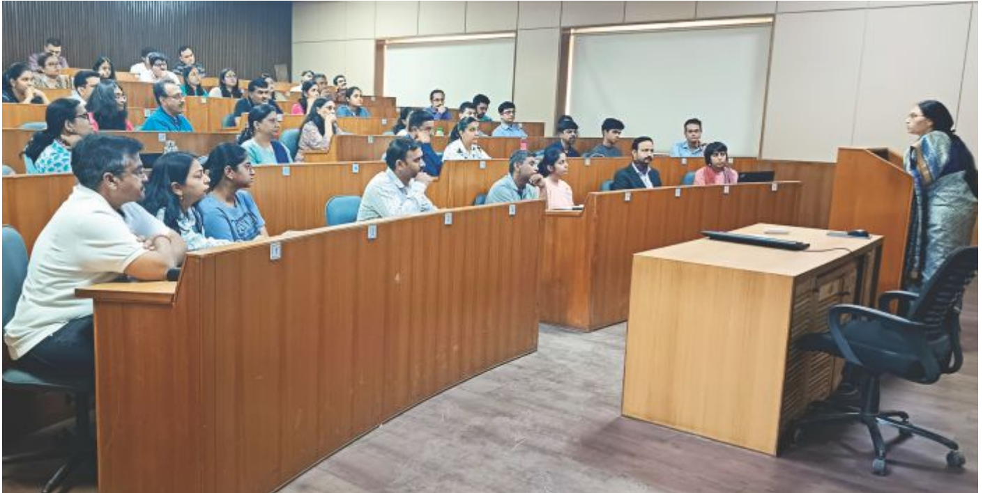
Parent Teacher's Meet at ILNU