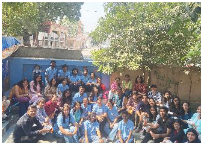
Visit to Lapkaman Village by NSS Unit at ILNU

NSS Unit at ILNU organized a One-Day visit to its adopted Lapkaman village on October 30, 2023. The main objective of the event was to introduce the new volunteers to the residents of the village and help them strike a connection with them. Also, a survey was carried out in relation to Bank frauds rampant in the area and people were made aware about preventing financial fraud. A few classes of Hindi Reading and Basic English were also organized along with games for the children of the village.