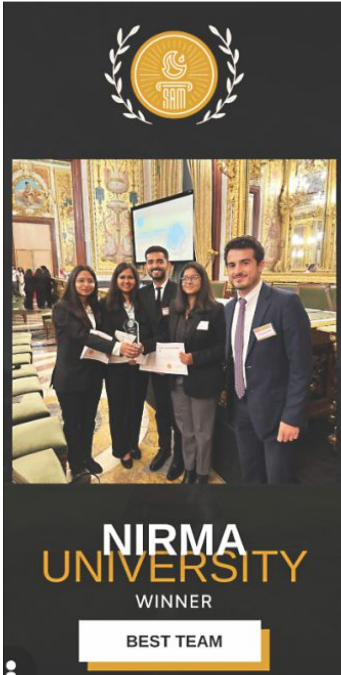
Arbitration Moot Court Competition 2023