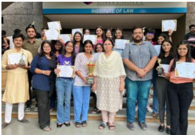
ILNU Wins MUN by MU & LRI

ILNU won the Best College Trophy at MUN by Marwadi University (Rajkot) and the LRI (Vadodara) held from November 4-5, 2023. Many students were awarded for their outstanding performances and bagged the titles of Best Delegate, High Commendation, Special Mention, Verbal Mention, Best Delegate, etc.