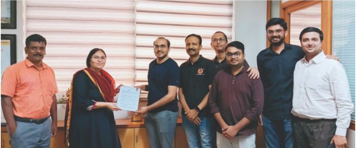
ILNU MoU with M/s. UNADA Lexi legal AI India Pvt

The Institute of Law, Nirma University signed a Memorandum of Understanding (MoU) with M/s. UNADA Lexilegal AI India Pvt. Ltd. (Under Corporation). The primary objective is to provide training for students in leveraging AI for both academic and professional assignments within the legal domain. This collaborative effort extends to testing, reviewing, and the ongoing enhancement of AI software products. Additionally, the partnership aims to facilitate product launches, fostering a dynamic exchange between academia and industry.