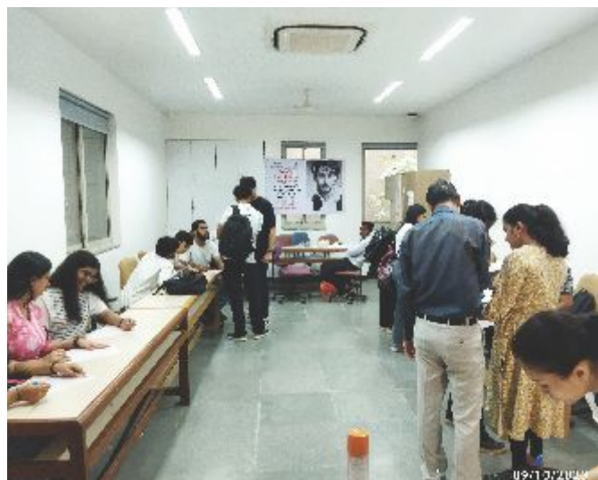
Thalassemia test at ILNU

A Thalassemia Test was conducted for the first-year students in association with Indian Red Cross Society, Gujarat State. It was conducted in two phases on October 9 and 20 2023 wherein 85 and 174 units were collected successfully.