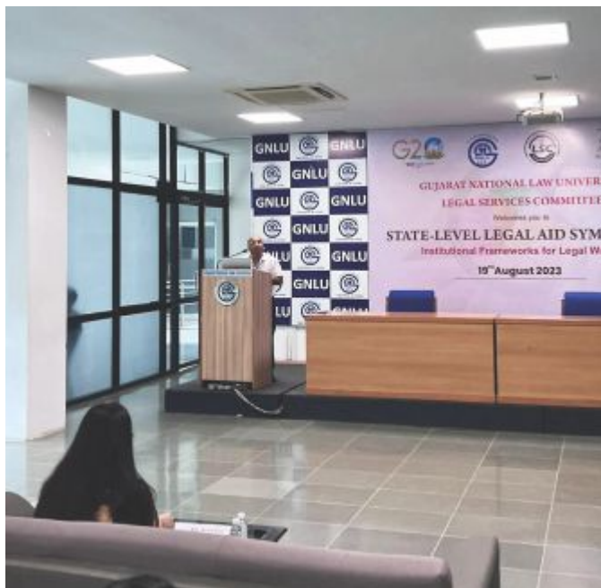
State Level Legal Aid Symposium

Symposium organized on August 19, 2023. The participants were from various colleges of the State of Gujarat. The symposium provided an opportunity to interact with different stakeholders of the Legal Aid Clinic across the state.