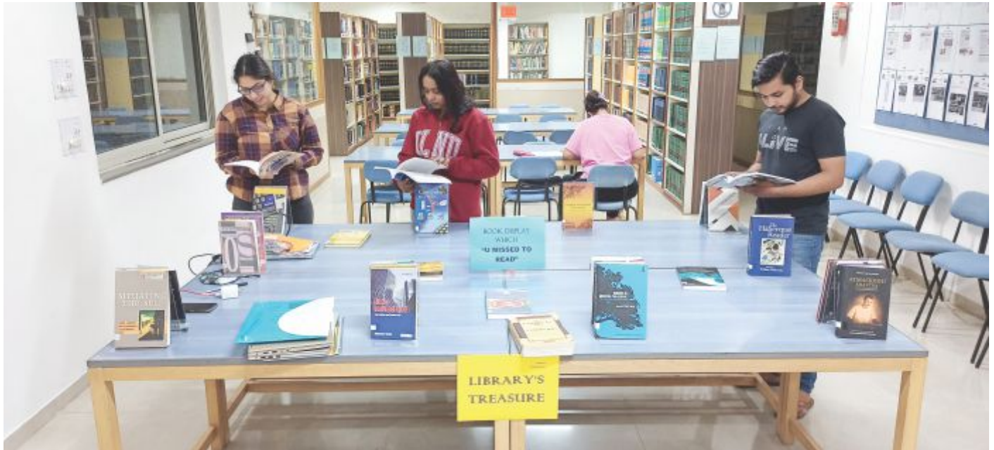
Book Display at ILNU Library

Library at ILNU on October 27, 2023 organized a Display of Books which help students to glance over the new titles procured by the library and encourage the budding readers to take up the habit of reading good literature.