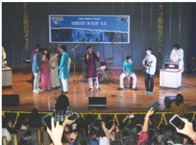
Musical Concert in Blue 5.0

The Music Committee of ILNU organized the fifth edition of Concert in Blue on November 5, 2023. This concert mainly for the new batch of first-year students showcased a diverse array of musical genres. The resounding success of the event left attendees with heartfelt sentiments and memories.