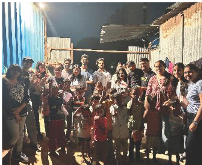
Education Drive by NSS

The National Service Scheme (NSS) at ILNU conducted an educational drive for the children of construction workers on October 28, 2023. This initiative, geared towards supporting underprivileged children, focused on imparting foundational knowledge. The drive also emphasized the significance of education in the process.