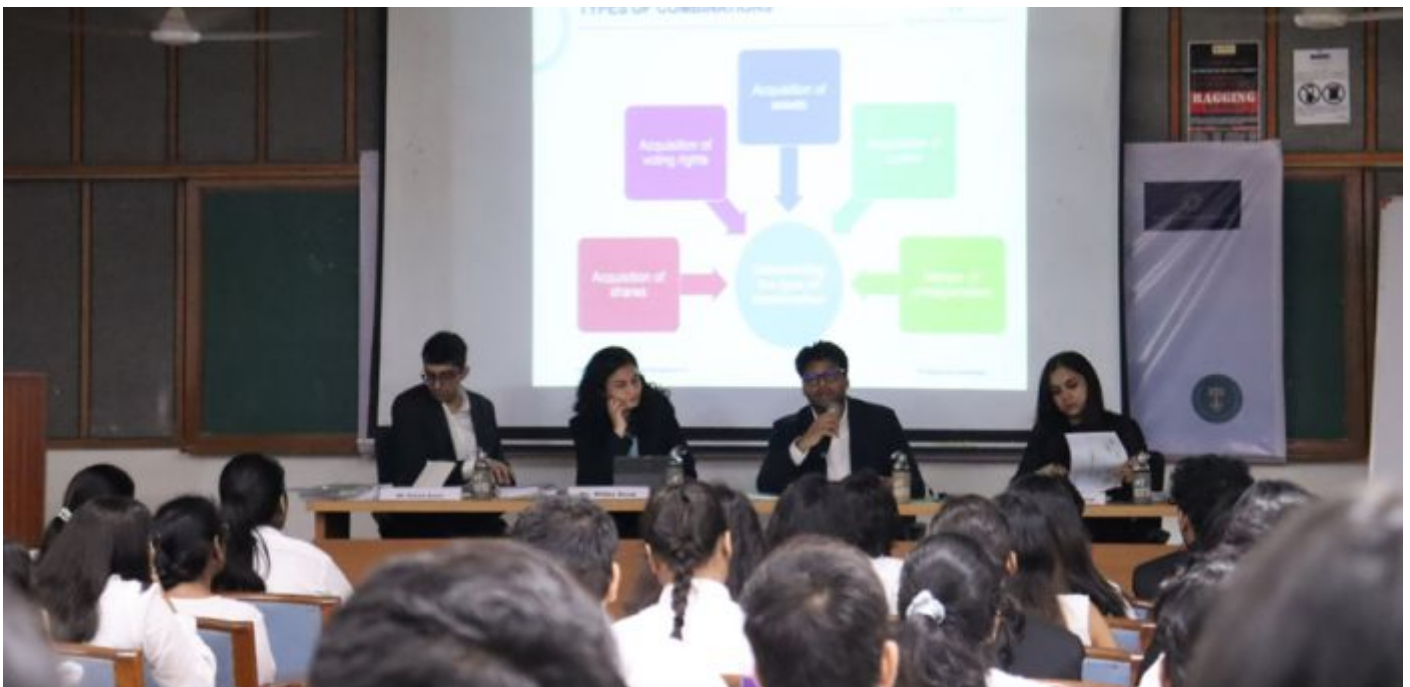
Competition Law Conclave