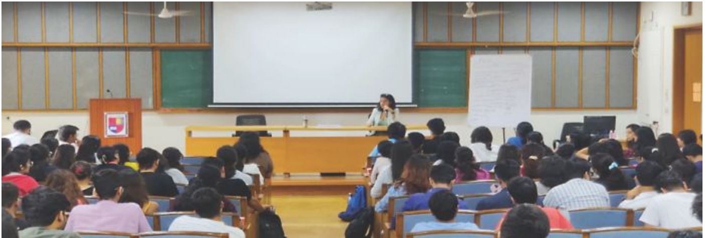
Competition Law Conclave

ILNU in collaboration with AZB & Partners hosted Competition Law Conclave organized by the Centre of Competition Law on September 20, 2023. The session highlighted the need for continuous adaptation in the ever-changing markets and technologies.