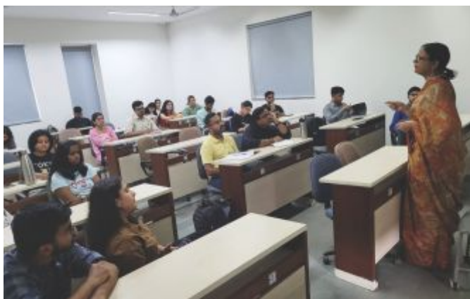
Guest Lecture on POCSO and Grey Areas of Criminal Law