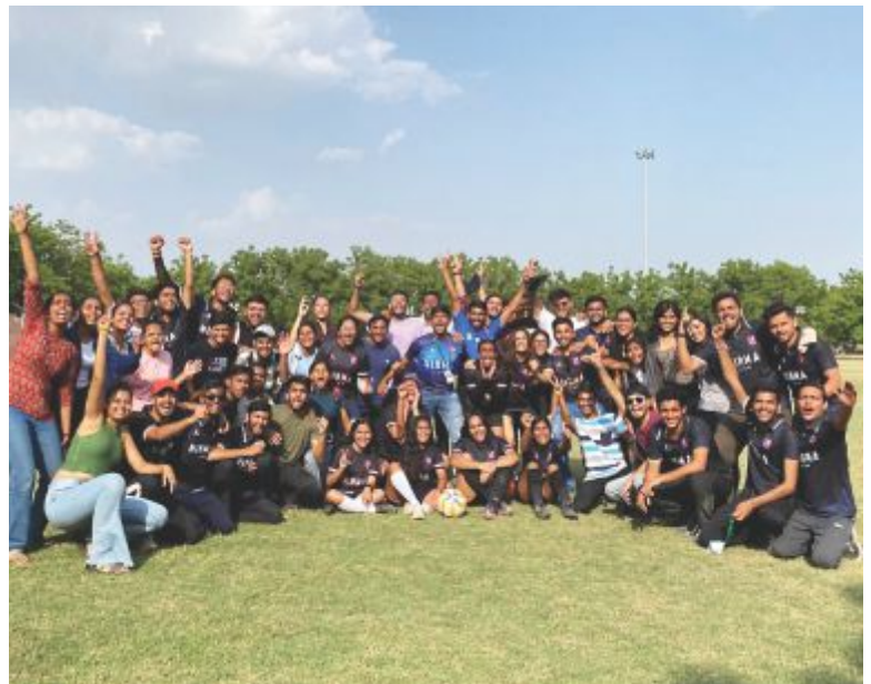
ILNU Sports Team at YUVARDHA VII, NLU Jodhpur