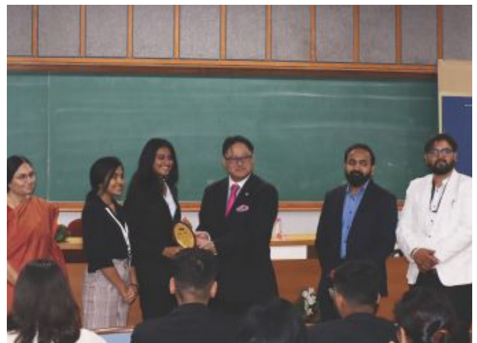
International Conference on Corporate Law & Finance at ILNU