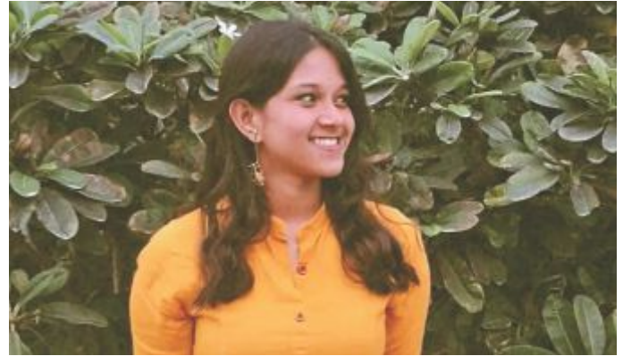
Volunteers of the month (Newsletter Committee)