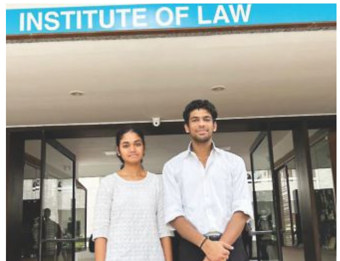
16th IIT Bombay Parliamentary Debate