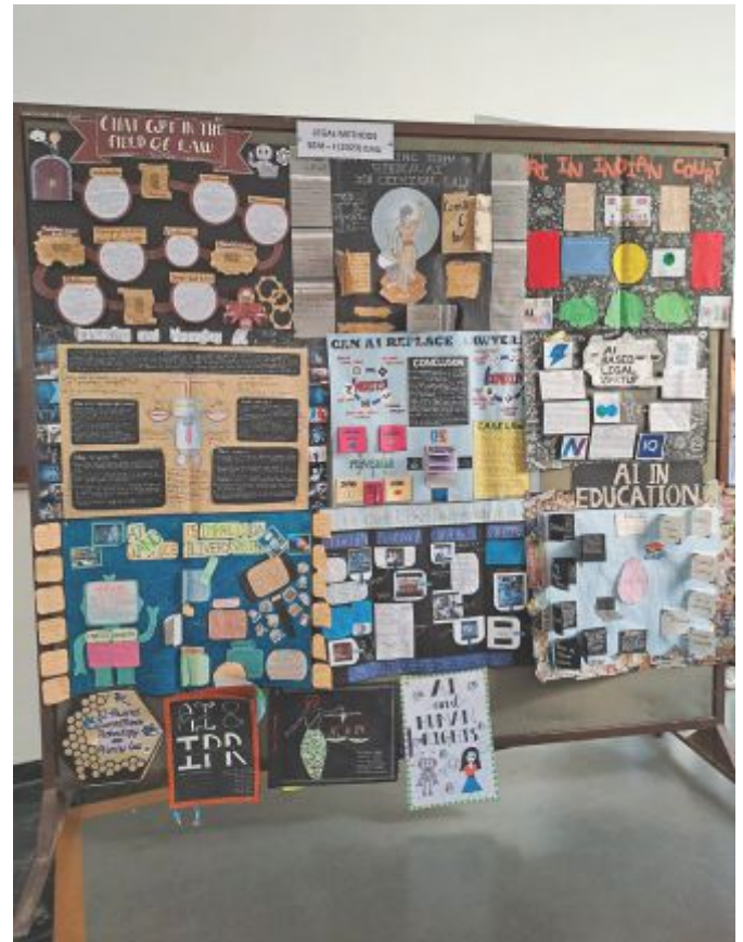
Project work display by First-Year Students at ICCLF

ILNU presented an exhibition in the International Conference on Corporate Law and Finance featuring project work completed by first-semester students in the Legal Methods course, focusing on the contemporary theme of 'AI & Law'. The students' work was appreciated by faculty members and visitors at the conference.