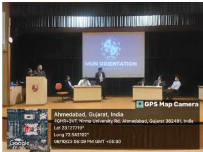
MUN Orientation Programme

concept of MUN. The programme served as an introductory session to the concept of MUN, the United Nations, and its various aspects.