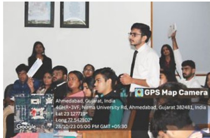
Intra MUN at ILNU

an opportunity for the students to experience how MUN functions. The participants indulged in fruitful and insightful debates making the conference a success.