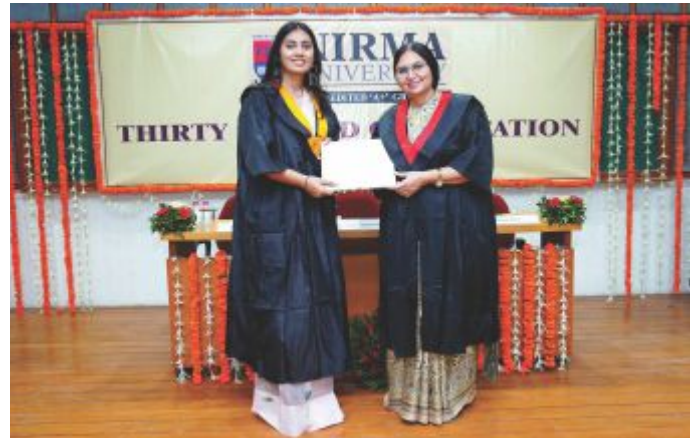
ILNU celebrated its 32nd Annual Convocation