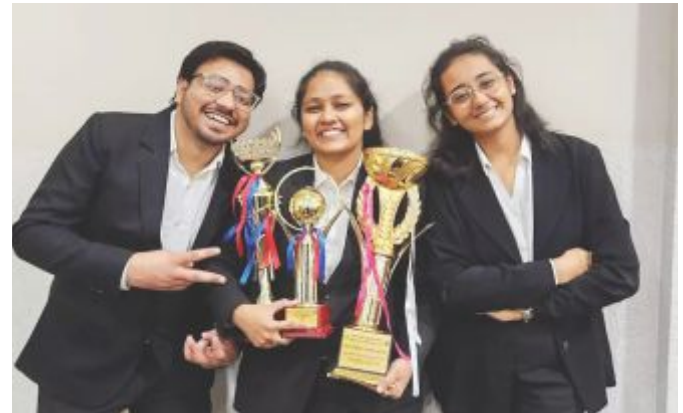
Jaipur National University National Trial Advocacy