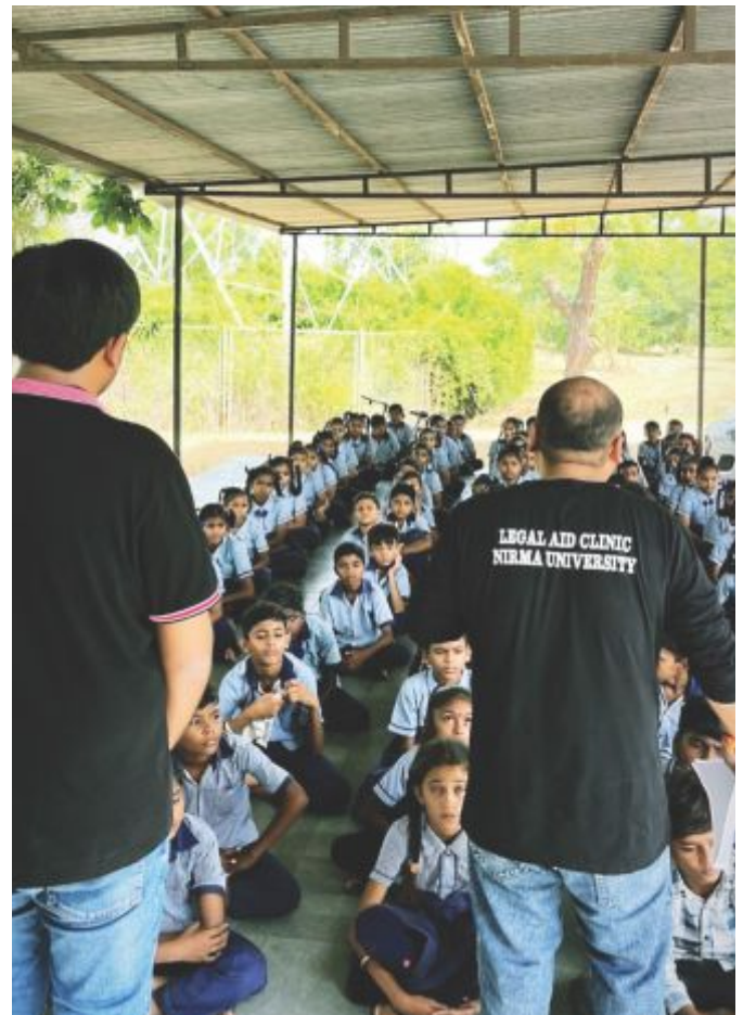
Visit to Limbadia Village by Legal Aid Clinic

and pamphlets of emergency important contact numbers and information about Legal Aid Clinic were put on display near the post office of the village Limbadia.