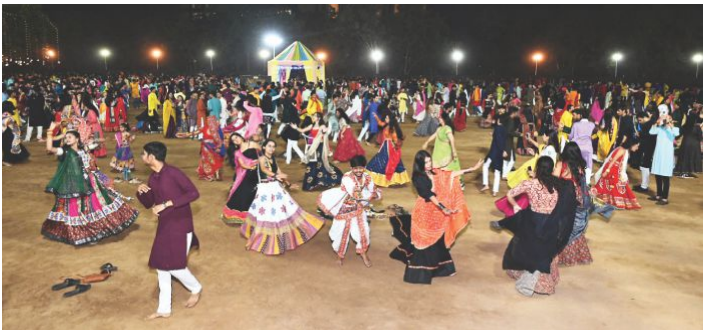
NU Raas Garba hosted by ILNU

On the occasion of Navratri 2023, the event of Raas Garba was hosted by ILNU and Student Welfare Board on October 27, 2023 at Nirma University Campus. The event was attended by a large number of students and faculty-staff. Students and faculty-staff members were felicitated with trophies for the best performance and best costume.