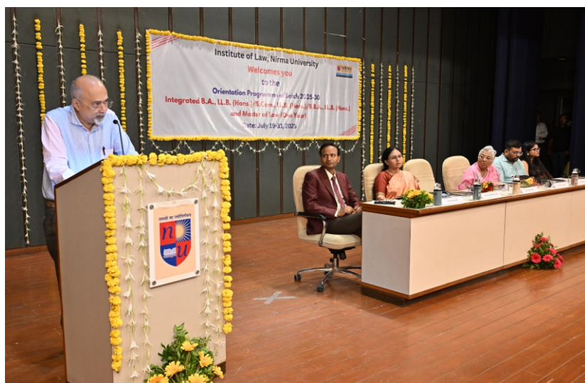
Chief Guest Addresses Students

Coordinated by faculty from the Humanities and Commerce area, with support from staff and volunteers, the program reflected ILNU's commitment to combining academic excellence with professional readiness. It laid a strong foundation for the students' journey by instilling clarity, confidence, and a sense of belonging.