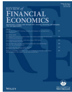
Review of Financial Economics (Scopus Q2, ABDC 'B' Category)