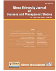
Nirma University Journal of Business and Management Studies