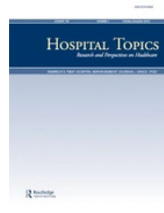
Hospital Topics (Scopus Q2)