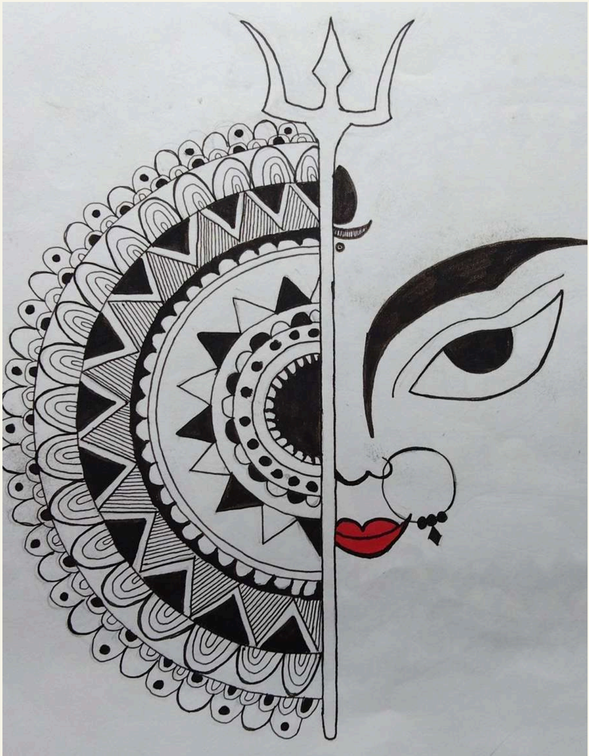
-Hardavi Talpara (Sem III)