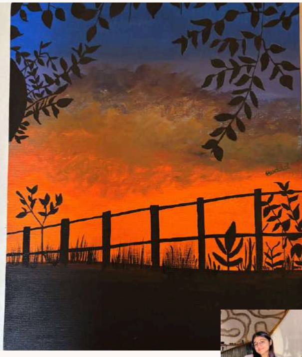
-Hardavi Talpara (Sem III)